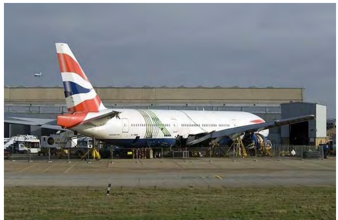
Crashed British Airways 777

RB211 Trent 800 series engine fuel/oil heat exchanger such that ice accumulation on the face of the FOHE will not restrict fuel flow to the extent that the ability to achieve commanded thrust is reduced. Once the fuel/oil heat exchanger is approved by certification authorities, require that operators of 777-200s powered by Trent 800s install the redesigned FOHE at the next scheduled maintenance opportunity or within 6 months.