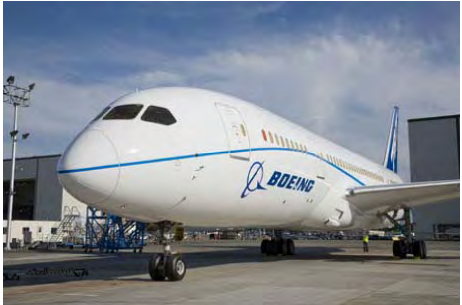
787 flight test airplane painted in special Boeing livery

Bombardier announced the delivery into service of the first Global 5000 business jet in mainland China to Reignwood Group, a Beijing-based corporation with worldwide operations. "This delivery marks an important milestone in our expanding pres-