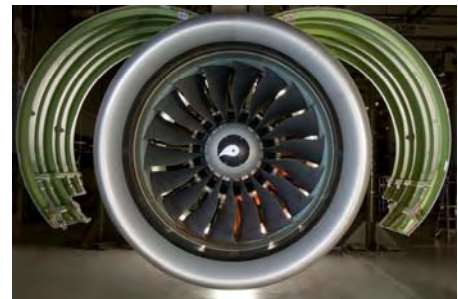
PurePower PW1000G engine with Goodrich nacelle

lating more than 40,000 take offs "at the equivalent loads at 30,000 pounds of thrust" loads, with 15,000