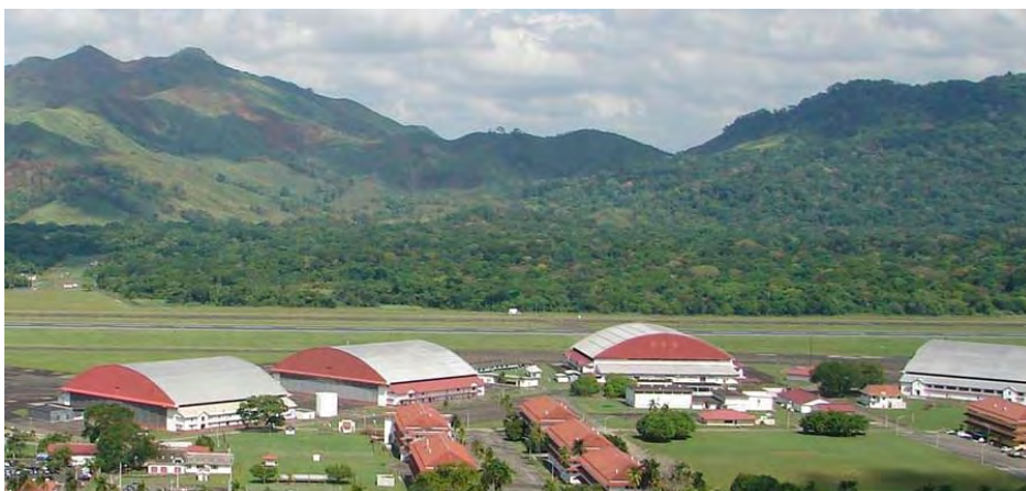
ST Aerospace's maintenance facilities in Panama

Copa Airlines and ST Aerospace signed a three-year maintenance service agreement. Commencing immediately and worth an estimated $18.5 million, the agreement covers the maintenance, repair and overhaul of Copa Airlines' existing fleet of 28 Boeing 737 next generation and 15 Embraer E-190 aircraft, as well as an additional 11 E-190 aircraft from Copa-owned Aero República. This new agreement is a renewal and expansion of the scope of the existing contract. The original deal between Copa Airlines and ST Aero-