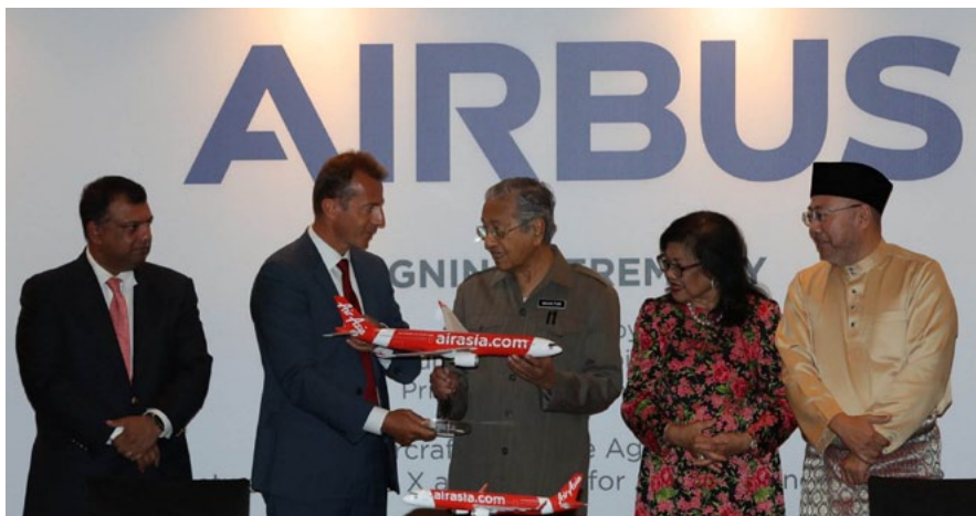
Signing of the MOA in Kuala Lumpur, Malaysia, between Airbus and AirAsia Group Bhd