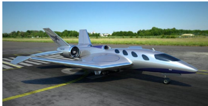
Pegasus signs MOU with Callen-Lenz Group

South Africa's Pegasus Universal Aerospace, pioneer of the Vertical Business Jet (VBJ®) Pegasus One, has signed a Memorandum of Understanding (MOU) with U.K.-based technical aviation consultancy, Callen-Lenz Group.