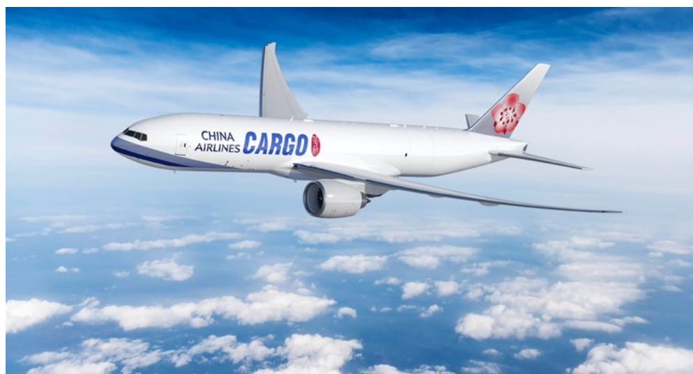
China Airlines has finalized an order for six Boeing 777 Freighters