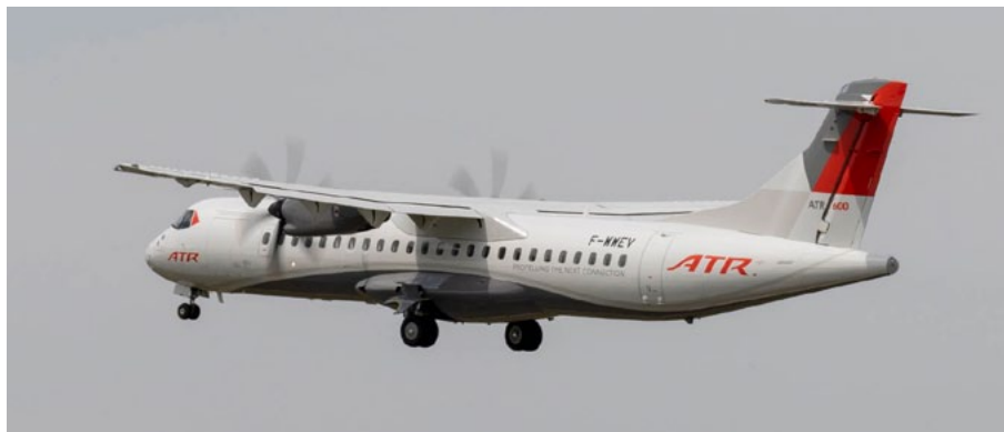
ATR 72-600 prototype MSN 1157

Tunisair Express and ATR, the regional aircraft manufacturer, have confirmed a firm order for three ATR 72-600s. The aircraft will renew Tunisair Express's regional fleet and supply essential connectivity, both domestically and internationally. The modern ATR turboprops support airline operations by burning 40% less fuel and emitting 40% less CO 2 . The ATR -600 cabin will also introduce the best onboard experience to Tunisair Express passengers, including ATR's Cabinstream™ In-Flight Entertainment system, enabling passengers to enjoy their flight by accessing a range of multimedia content on their personal electronic devices.