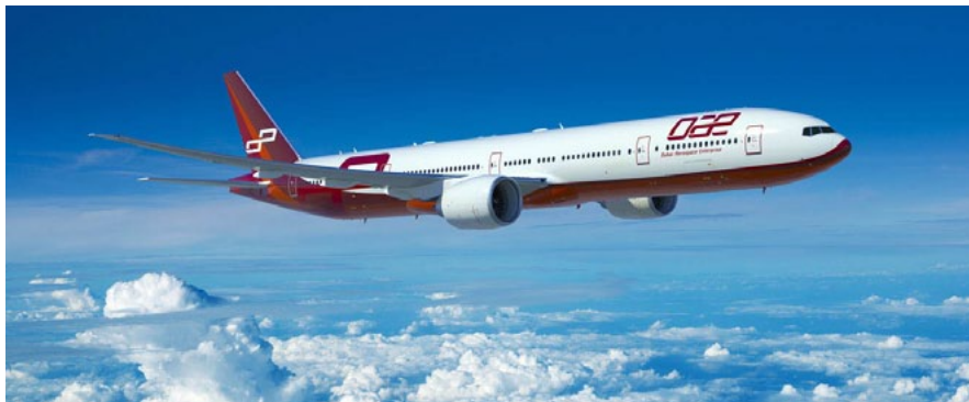
DAE Boeing 777-300 aircraft