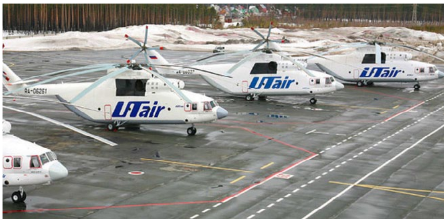
UTair helicopter fleet

Japan Airlines has selected GE Aviation for Digital Records Management across its fleet of more than 200 airplanes. The implementation is currently underway and adds to the 700 million