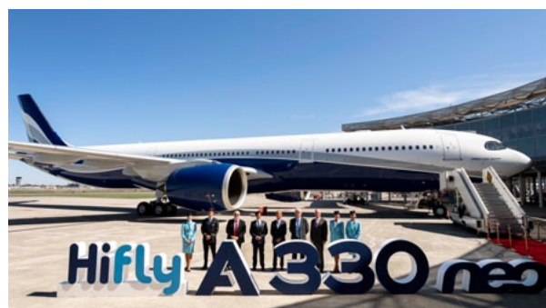
Hi Fly takes delivery of its first A330neo

Passengers will enjoy higher comfort levels in the Airspace signature brand new cabin designed and recently released by Airbus, while the airline itself will benefit financially from significantly lower fuel consumption and carbon emissions. The aircraft seats 371 passengers in a two-class configuration (18 high-comfort business-class seats with flat beds and 353 standard economy seats). All seats have the latest generation inflight entertainment ZODIAC RAVE IFE System Generation 3 installed. This new A330neo is powered by the highly efficient new-generation Rolls-Royce Trent 7000 engines, the seventh iteration of the Trent family of large turbo-fan jet engines designed exclusively for the Airbus A330neo. A new optimized wing with Sharklets, specially designed for the Airbus family, further and significantly improves its performance. The move to a more environmentally friendly aircraft with reduced fuel-burn is in line with Hi Fly's long-held commitment to sustainability practices. This investment reflects the company's intent to fly modern, efficient and environmentally friendly aircraft. The airline is on track to meet its commitment to fly plastic-free by the end of this year after it made industry history in a series of successful trial passenger flights last December without a single-use plastic item on board. Hi Fly is also committed to becoming carbon neutral by the end of 2021.