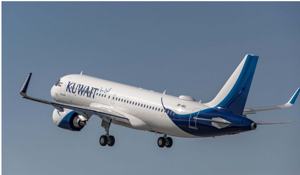
Kuwait Airways A320neo