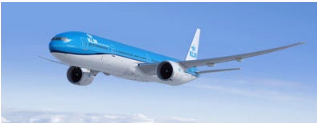
KLM Boeing 777