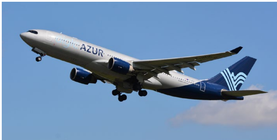
Aigle Azur operated two A330s.

ECS Group's Turkish subsidiary GACTR (Globe Air Cargo Turkey) has signed an exclusivity contract with EgyptAir Cargo to begin optimising marketing of its cargo offering from September.