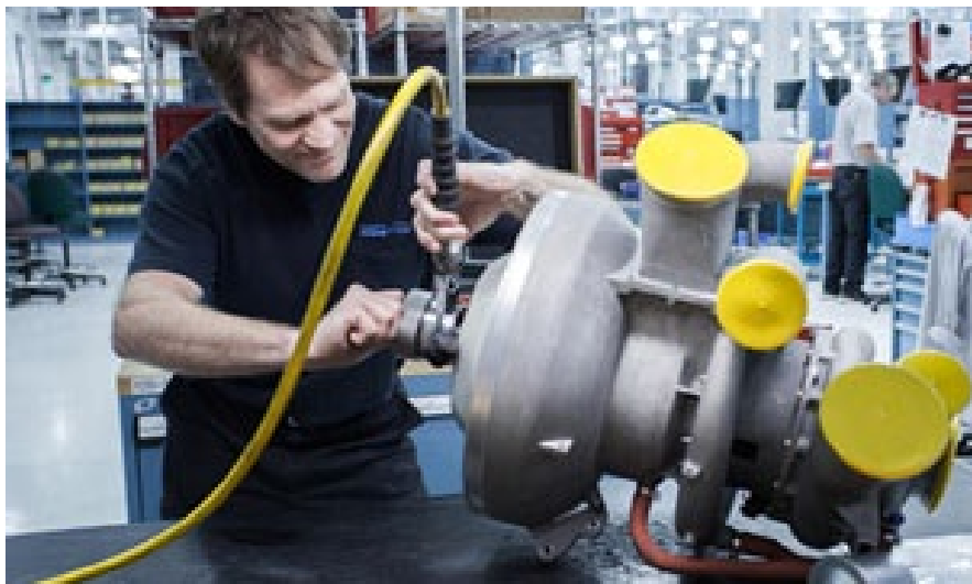
AJW Technique and Liebherr Aerospace enhance relationship