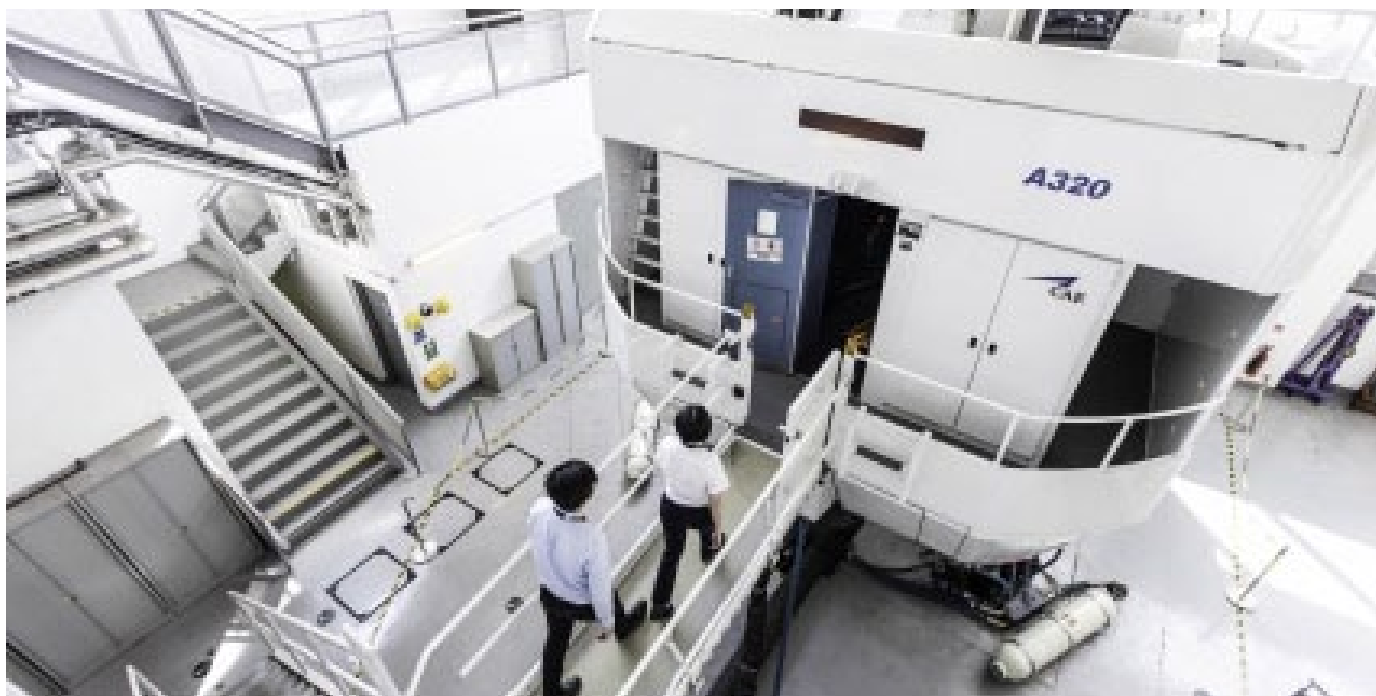
A320 full flight simulator