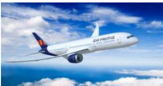
Korean airline Air Premia