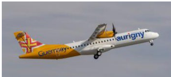
Aurigny to become the launch customer for ClearVision on its new ATR 72-600

ATR has delivered the first of three ATR 72-600 aircraft to Aurigny. By replacing its fleet of three ATR 72-500 aircraft with the -600 Series, Aurigny will optimize its operations. The ATR 72-600 burns up to 40% less fuel and emits 40% less CO2 compared to a regional jet. The Guernsey-based airline will also further benefit from -600 Series' latest-generation Standard 3 avionics suite and is the launch customer for the ClearVision™ Enhanced Vision System (EVS). The EVS will provide pilots with outstanding vision and situational awareness during conditions of reduced visibility. In the cabin, Aurigny's passengers will benefit from the -600 Series' modern Armonia cabin which will introduce the latest standards of comfort, offering more space for luggage in overhead bins and providing passengers 18" wide seats.