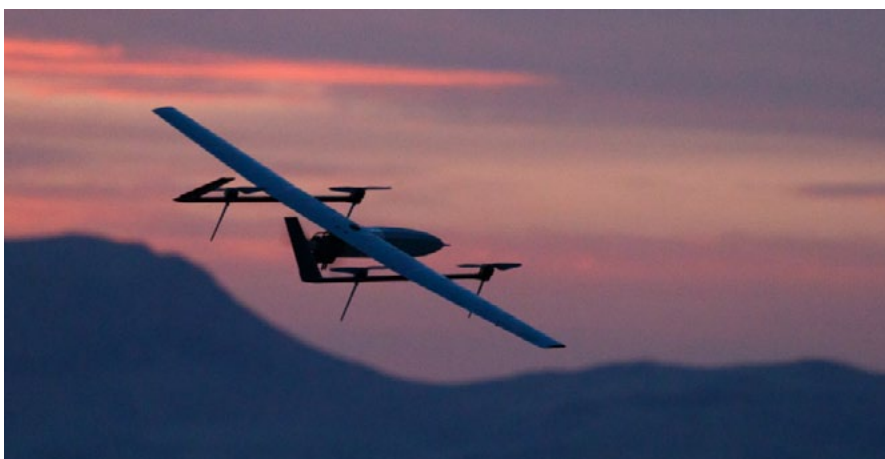
Hybrid Project's SuperVolo UAV