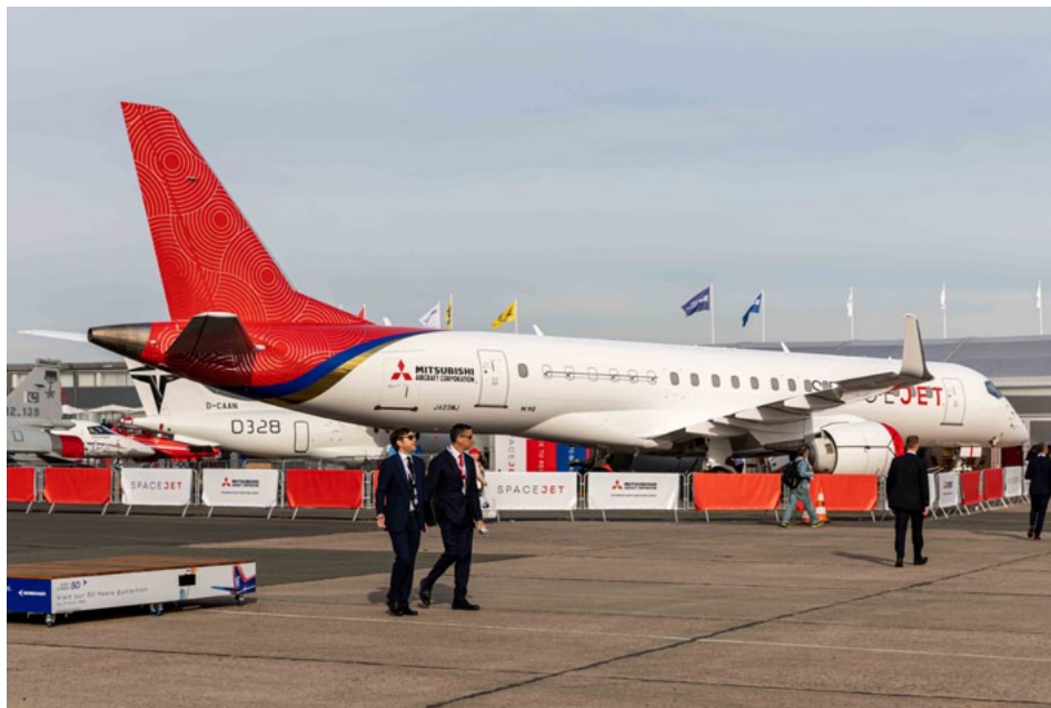
The M90 faces U.S. scope clause restrictions.

London Gatwick is trialling a new boarding technique in a bid to avoid queues and congestion at gates. During the two-month trial, large digital screens and staff will be placed at Gate 101 to show passengers the order to board. A range of sequences will be trialled to test whether they make the process faster, more relaxing and, potentially, reduce the need for large numbers of passengers to rush forward at any stage.