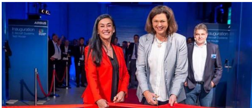
Grazia Vittadini, Ilse Aigner inauguration ceremony