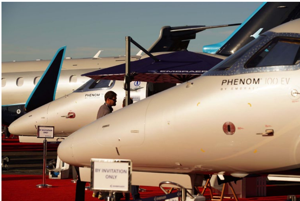
The Embraer demo tour fleet set for Inflight the Jet Centre