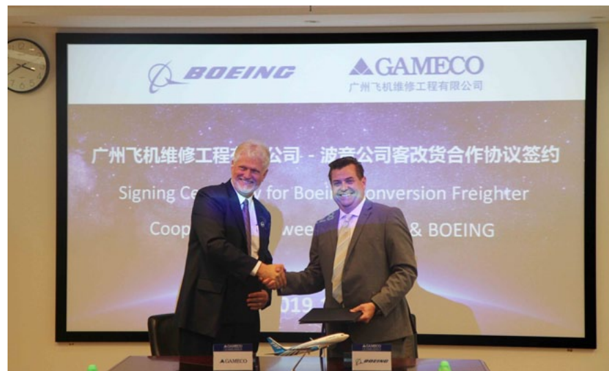
Boeing and GAMECO agree on partnership for 737-800 Boeing Converted Freighter production line