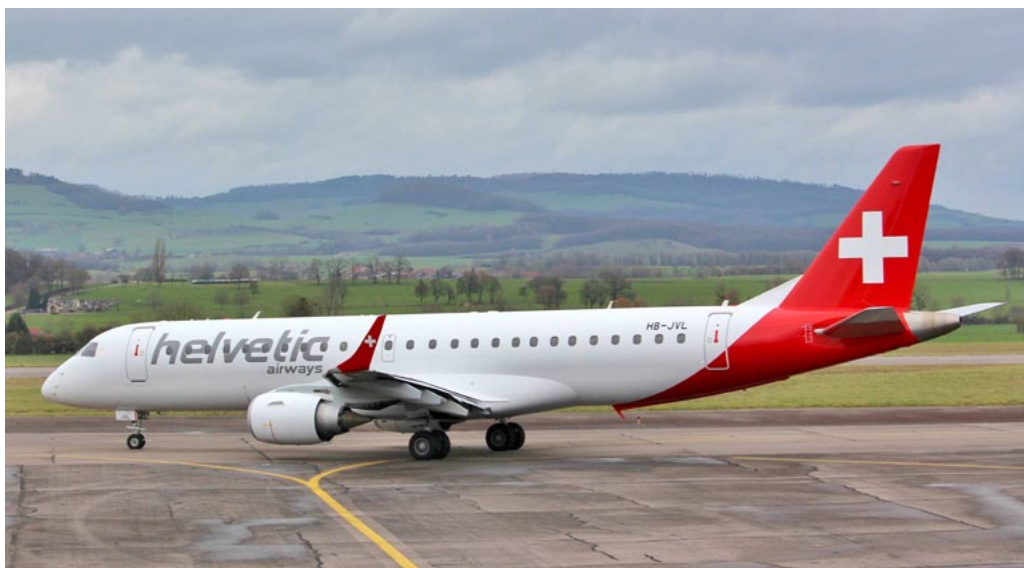
Helvetic Airways takes delivery of its first E190-E2 jet

Zurich, Switzerland-based Helvetic Airways officially received its first E190-E2 jet from Embraer. The airline has a contract for a firm order of 12 jets of this model, and purchase rights for a further 12 E190-E2s, with conversion rights to the E195-E2, bringing the total potential order up to 24 E-Jets E2s. This E190-E2 aircraft marks the start of Helvetic's fleet renewal program. The purchase rights for a further 12 aircraft (E190-E2s or E195-E2s) will enable Helvetic Airways to grow according to market opportunities. Helvetic Airways is configuring the E190-E2 in a single-class layout with 110 seats and will deploy the aircraft on several domestic and international routes.