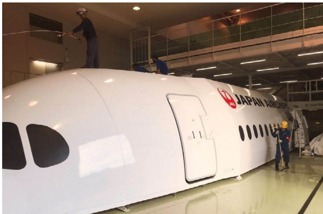
EDM complete state-of-the-art Airbus A350 cabin trainer for Japan Airlines

EDM, one of the leading global providers of training simulators to the civil aviation and defense sectors, has announced that the installation of Japan Airlines' Airbus A350 Cabin Emergency Evacuation Trainer (CEET) has been completed in Tokyo, Japan. Japan Airlines' new simulator is one of the most advanced that EDM has produced to date. This CEET has been designed and manufactured to represent the Airbus A350, which the airline has recently taken delivery of. The A350 CEET build was extensive both externally and internally, whereby all interior panels for the Cabin Trainer were replicated to truly increase the fidelity of the simulator. This included operable overhead bins, rated to hold a weight of up to 45kg.