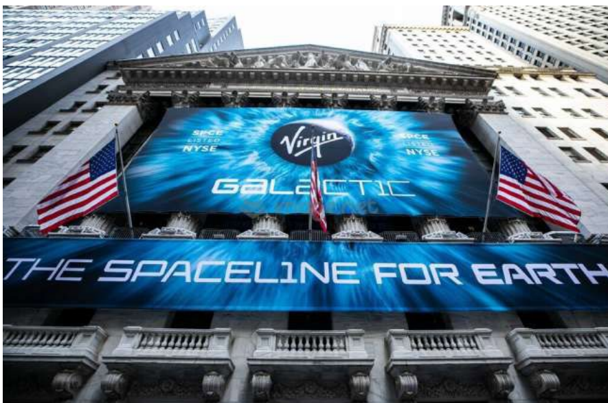
Photo: Virgin Galactic visits the New York Stock Exchange to celebrate its listing