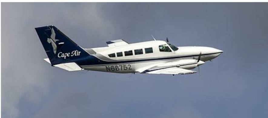
Cape Air Cessna 402