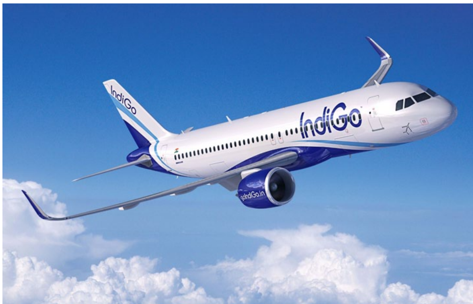
IndiGo signs for 300 A320neo Family aircraft