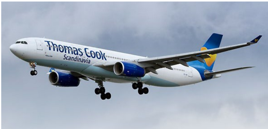
Thomas Cook Airlines Scandinavia