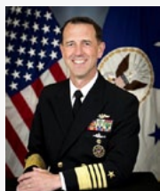
Adm. John M. Richardson (Ret.)

• Boeing's Board of Directors has elected retired Adm. John M. Richardson as its newest member. Richardson served as the 31 st chief of Naval Operations from September 2015 until August 2019, when he retired from the U.S. Navy after 37 years of service. Richardson will join the Aerospace Safety Committee, which was formed in August following a rigorous five-month review of the company's policies and processes for airplane design and development by the board's temporary Committee on Airplane Policies and Processes. He also will serve on the board's Special Programs Committee.