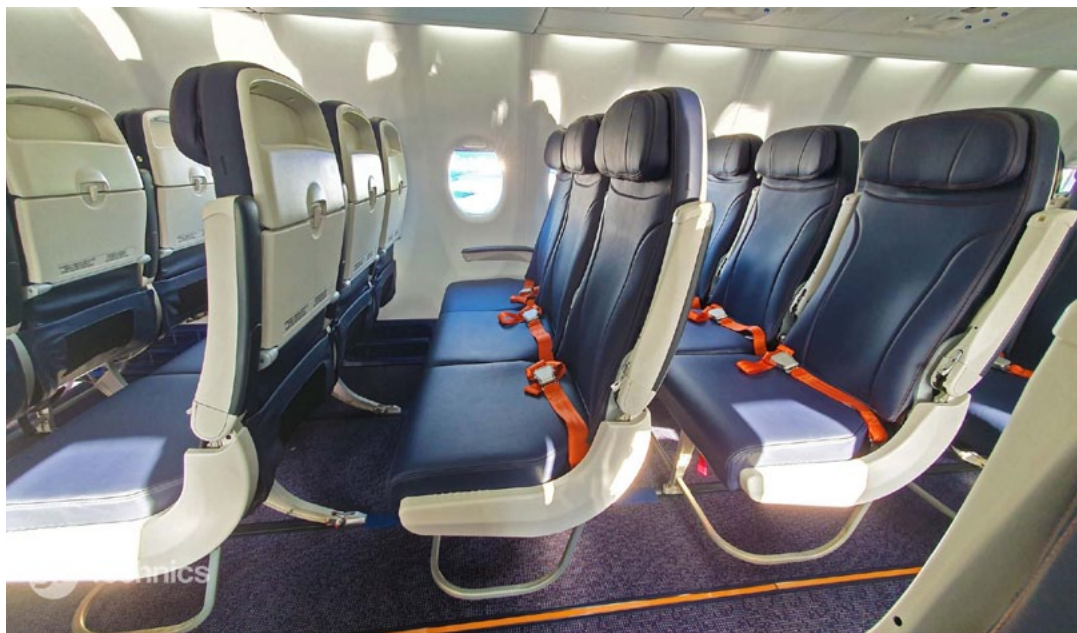
S7 to produce leather seat covers for the SSJ 100 aircraft