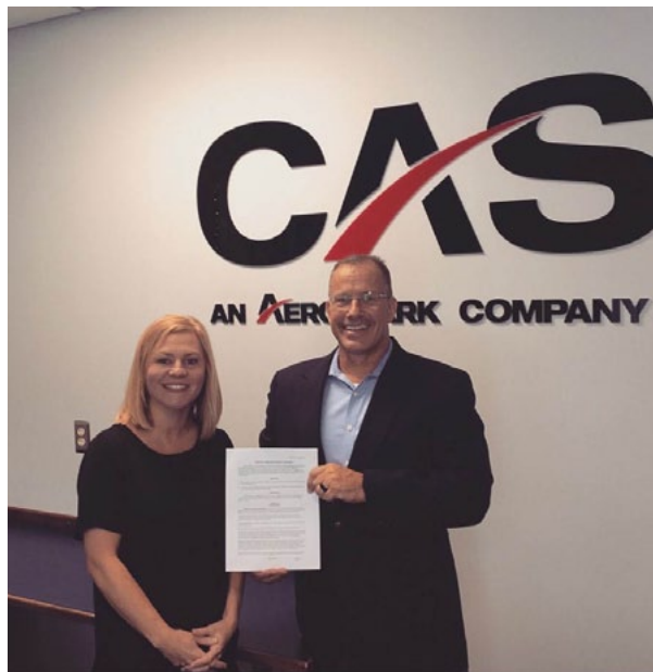
Photo: CAS signs five-year contract with major cargo carrier

Certified Aviation Services (CAS) Components, a leading provider of component overhaul, has signed a five-year agreement with a major cargo carrier. Out of a competitive pool of approved vendors competing for the service contract, CAS was chosen by the air carrier as its preferred component repair shop. This extensive contract requires full coverage on repair and overhaul of high-flow pneumatics, air cycle machines and mechanical accessories. The agreement was specifically assembled to provide higher reliability and reduced turnaround time. In addition, CAS has internally