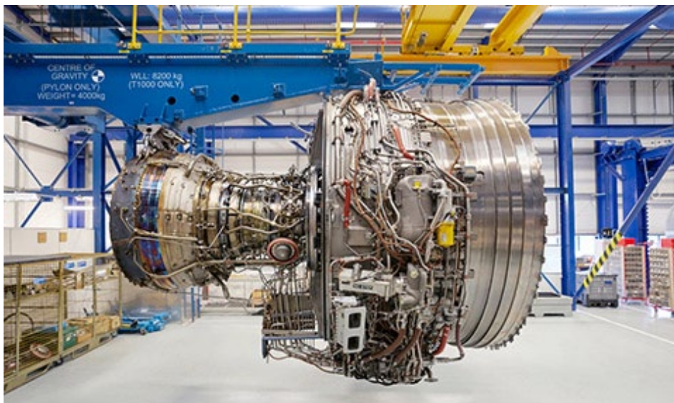
Rolls-Royce plans to expand its global engine overhaul network to support further fleet growth