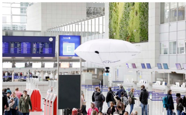
Prototype of a camera zeppelin at Frankfurt Airport

The H-Aero is a small, helium-filled hybrid aerial vehicle. From October 28 to 31, passengers at Frankfurt Airport were able to see it floating almost silently through Halls D and E in Terminal 2. Fraport AG joined forces with the start-up Hybrid-Airplane Technologies GmbH to carry out test flights assessing whether the aerial vehicle could be used to