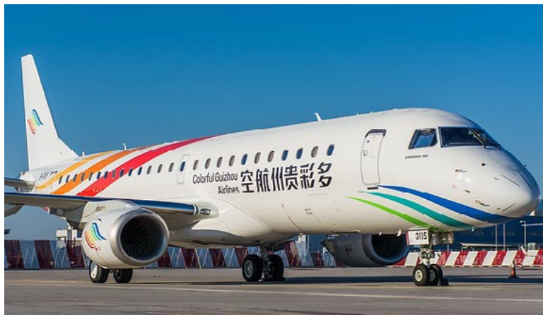
Colorful Guizhou Airlines finalizes RPFH-agreement for LEAP-1A engines with CFM

Colorful Guizhou Airlines has finalized a 12-year Rate-Per-Flight-Hour (RPFH) agreement for LEAP-1A engines that will power the airline's future fleet of up to 35 Airbus A320neo aircraft, along with five spare engines. The agreement is valued at approximately US$1.0 billion at list price. The contract was signed in conjunction with French President Emmanuel Macron's state visit to China. RPFH agreements are part of CFM's portfolio of flexible aftermarket support offerings. Under the terms of the agreement, CFM Services guarantees maintenance costs for the airlines LEAP-1A engines on a dollar-per-engine-flight-hour basis. Established in June 2015, Colorful Guizhou Airlines is one of the fastest-growing airlines among the newly established airlines. Since its inception on December 31, 2015, it has developed routes covering 31 cities in the provinces, North China, East China, South China, Central China and West China, and initially built a "Guizhou-based, nationwide-oriented" route network.