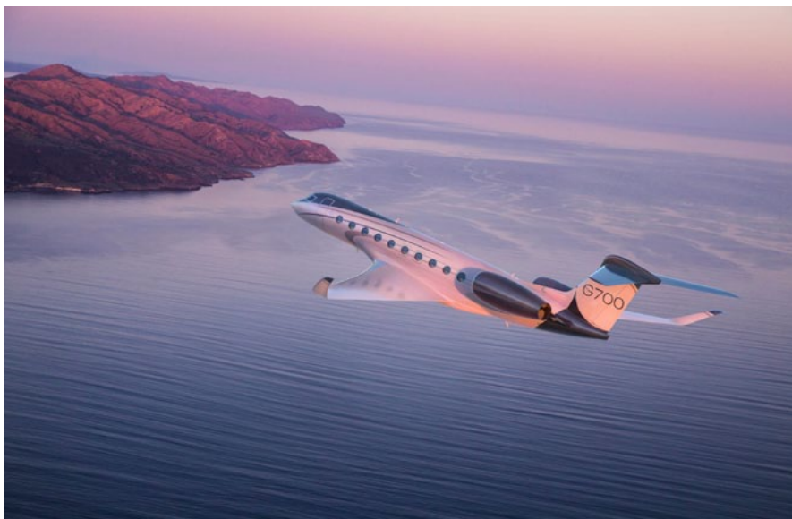
The Gulfstream G700