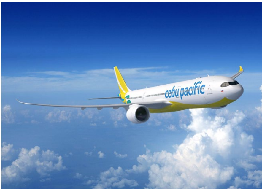
Cebu Pacific signs order with Airbus for 16 A330neo aircraft