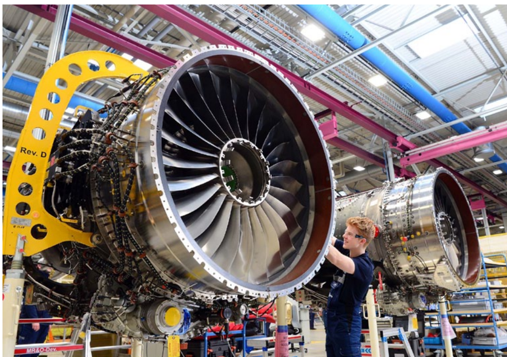
Pearl 700 engine assembly

Liebherr-Aerospace has been selected to supply the pneumatic component package for Rolls-Royce's next-generation business jet engine Pearl 700: Both the pneumatic valves and the actuation devices that control pneumatic power around the engine have been designed, are manufactured and serviced by Liebherr-Aerospace Toulouse SAS, Toulouse (France). Liebherr-Aerospace Toulouse SAS provides Rolls-Royce with lightweight, high-reliability valves and actuation devices that match the requirements of the Pearl 700 engine program, the most powerful in the Rolls-Royce business jet propulsion portfolio. The Pearl 700 is the latest member of Rolls-Royce's Pearl® engine family and the exclusive power plant for the new Gulfstream G700. The new contract is another important step in the relationship between Rolls-Royce and Liebherr-Aerospace: In 2015, both companies established a 50:50 joint venture called Aerospace Transmission Technologies GmbH. It is based in Friedrichshafen (Germany) and develops manufacturing capability and capacity for the power gearbox for Rolls-Royce's new UltraFan™ engine. In addition, the engine manufacturer has selected Liebherr-Aerospace to supply a pneumatic valve for the Trent 7000 engine.