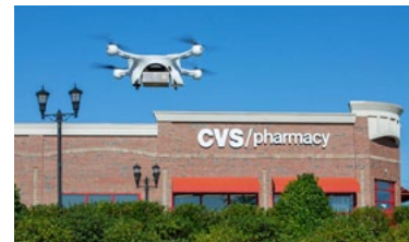
First residential drone deliveries of prescription medicines

UPS Flight Forward (UPSFF) and CVS Health Corporation subsidiary CVS Pharmacy have successfully completed the first revenue-generating drone delivery of a medical prescription from a CVS pharmacy directly to a consumer's home. This was followed by another delivery of a medical prescription to a second customer in a nearby retirement community. Both flights occurred on Friday, Nov. 1, 2019, using the M2 drone system by UPS partner and drone systems developer Matternet. The deliveries mark another milestone in a recently announced collaboration between UPS and CVS to develop a variety of drone delivery use cases, including business-to-consumer operating models. The companies plan ongoing drone delivery program development in the coming months in order to bring to market the speed and convenience advantages of UAVs. The recent prescription delivery flights occurred with FAA approval to conduct a residential drone delivery and according to FAA regulations. The flights launched from a CVS store in Cary, NC and flew to CVS customers' homes. The drones flew autonomously but were monitored by a remote operator who could intervene if necessary. The drone hovered about 20 feet over the properties and slowly lowered the packages by a cable and a winch to the ground. One of the packages was delivered to a CVS customer whose limited mobility makes it difficult to travel to a store to pick up a prescription.