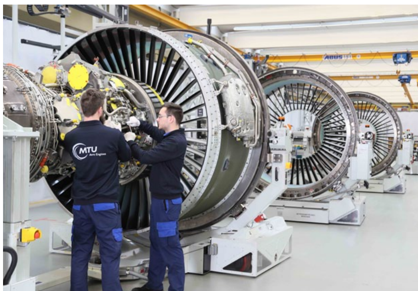
MTU's engine assembly line