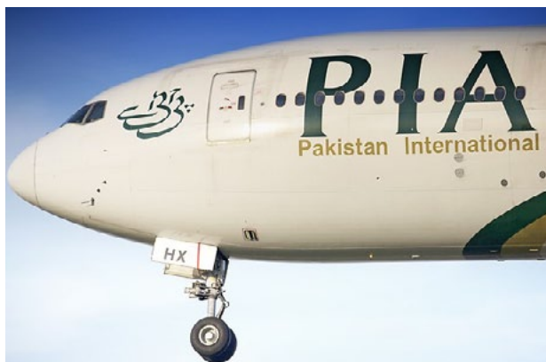
Pakistan International Airlines