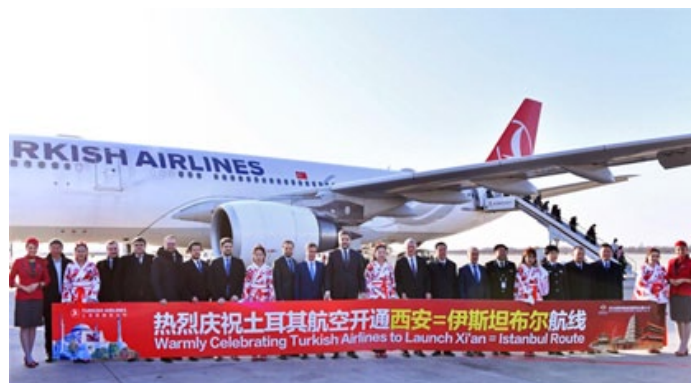
Photo: Turkish Airlines celebrates the addition of Xi'an to its flight network

Offering its guests the opportunity to fly directly to 126 countries from Istanbul, Turkish Airlines added Xi'an, the Chinese city with three thousand years of history, to its flight network on December 30. Xi'an became the carrier's fourth destination in Mainland China and the 318th destination in the world. The flights will be operated three times a week with Airbus A330 aircraft. Starting its flights to the People's Republic of China back in 1999 with Beijing as its destination, Turkish Airlines reinforced its strong position in Asia with the Xi'an flights. With this new addition, the global carrier's flight network encompassed the entirety of the historical Silk Road that started in Xi'an and ended in Venice.