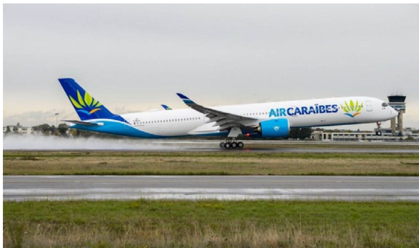
The first A350-1000 for Air Caraïbes