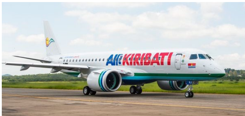
Air Kiribati E190-E2 jet

Air Kiribati, the flag carrier of the Republic of Kiribati, has received its first E190-E2 jet. Embraer has signed the contract with the Government of Kiribati, in partnership with its national airline, Air Kiribati, in December 2018. The airline has ordered two E190-E2s and has purchase rights for two more. Air Kiribati is the launch operator for the E190-E2 in Asia Pacific. The aircraft will be configured in a dual class layout seating 92 passengers in total, with 12 seats in business class and 80 seats in economy class. Located in the central Pacific, Air Kiribati can now fly longer domestic and international routes than it currently does with its turboprop fleet.