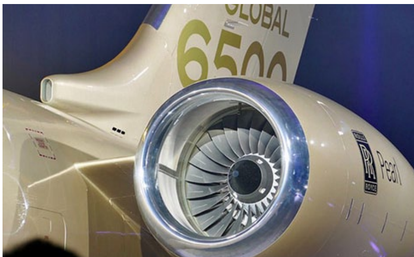
Rolls-Royce Pearl 15 engine receives US certification

The Pearl® 15, the exclusive engine option for Bombardier's Global 5500 and Global 6500 aircraft, has received its official certification by the Federal Aviation Administration (FAA). The engine, which was developed at the Rolls-Royce Centre of Excellence for Business Aviation engines in Dahlewitz, Germany, has previously been certified by the European Union Aviation Safety Agency (EASA) and Transport Canada Civil Aviation (TCCA). The Pearl 15 was custom designed to power the Global 5500 and Global 6500 aircraft, which have the longest range and the largest cabin in their category and feature Bombardier's signature smooth ride technology. Rolls-Royce is the world's leading engine supplier for business aviation, powering more than 3,200 aircraft in service today. The new state-of-the-art Pearl engine family for business aviation, has already been chosen to power three different business jets, reaffirming Rolls-Royce's leading position in this important market.