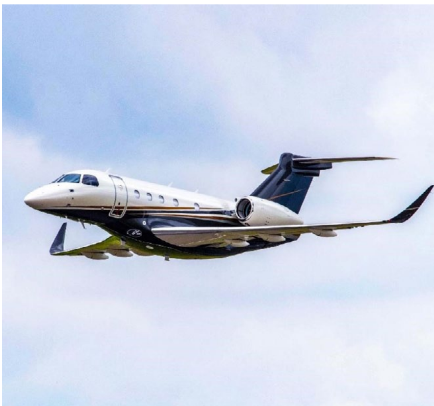
Photo: Embraer Praetor 500 business jet

Embraer has delivered its first Praetor 500 business jet to the market, just over one year after its announcement at the 2018 National Business Aviation Association's Business Aviation Convention and Exhibition (NBAA-BACE), alongside the Praetor 600, both of which have received triple certification from ANAC, the FAA, and EASA. The first Praetor 500 was delivered to Flexjet, a global leader in private jet travel, which is introducing the aircraft into its fractional fleet through a purchase agreement with Embraer, announced at NBAA-BACE 2019. The deal is valued at up to US$1.4 billion, at current list prices, and comprises a fleet of Embraer business jets. With this order, which includes the Phenom 300 light jet and the recently certified Praetor 500 and Praetor 600 jets, Flexjet became the Praetor fleet launch customer.