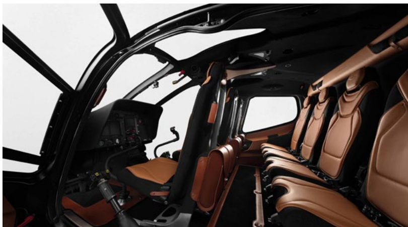
ACH130 Aston Martin Edition

The ACH130 Aston Martin Edition, the first offering from the recently announced partnership between Aston Martin Lagonda and Airbus Corporate Helicopters, was revealed on January 3rd, at Courchevel in the French Alps. This stylish special edition of the ACH130 helicopter comes equipped with a range of four interior and exterior designs generated by Aston Martin which will delight helicopter owners and pilots who appreciate the pleasures of possessing and driving high performance bespoke luxury cars. The aeronautical designers at Airbus Corporate Helicopters (ACH) and the automotive designers at Aston Martin have worked closely together for over a year, marrying ACH's key values of excellence, quality and service with Aston Martin's commitment to beauty, handcrafting and automotive art to bring a new level of aesthetics and rigorous attention to detail to the helicopter market.