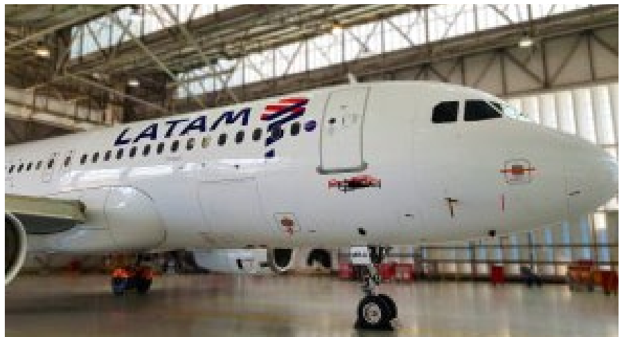
Photo: Latam Airlines Group will use Donecle's automated drone solution

LATAM Airlines Group has decided to use Donecle's automated drone solution to improve the efficiency and reliability of aircraft visual inspections during base maintenance for their A320 fleet. The solution will help optimizing maintenance activities, increase workers' safety and improve traceability of inspections. – LATAM is Donecle's first customer in Latin America. Following a successful 3-month trial period, LATAM decided to integrate Donecle's solution in its São Carlos site, one of the company's main base maintenance sites. The drone will be used for visual inspections during heavy checks.