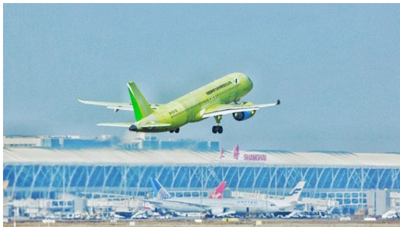
The 6 th C919 takes off for its maiden flight