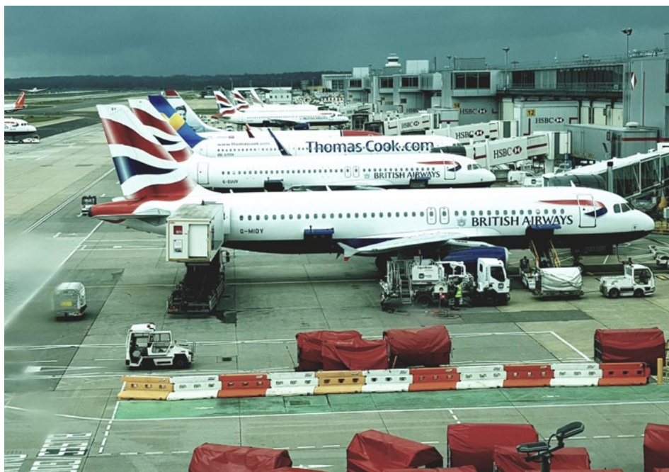
Aviation saw fatal accidents halved in 2019.

AerCap has signed an agreement with AirSial Limited, a privately-owned Pakistani start-up airline, for the lease of three used Airbus A320 aircraft. The aircraft are scheduled to deliver in the second quarter of 2020 and will be the first aircraft to be delivered to the airline. AerCap is a major player in aircraft leasing in the Pakistani market.