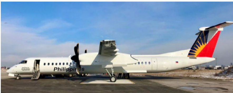
De Havilland Canada Dash 8-400 aircraft