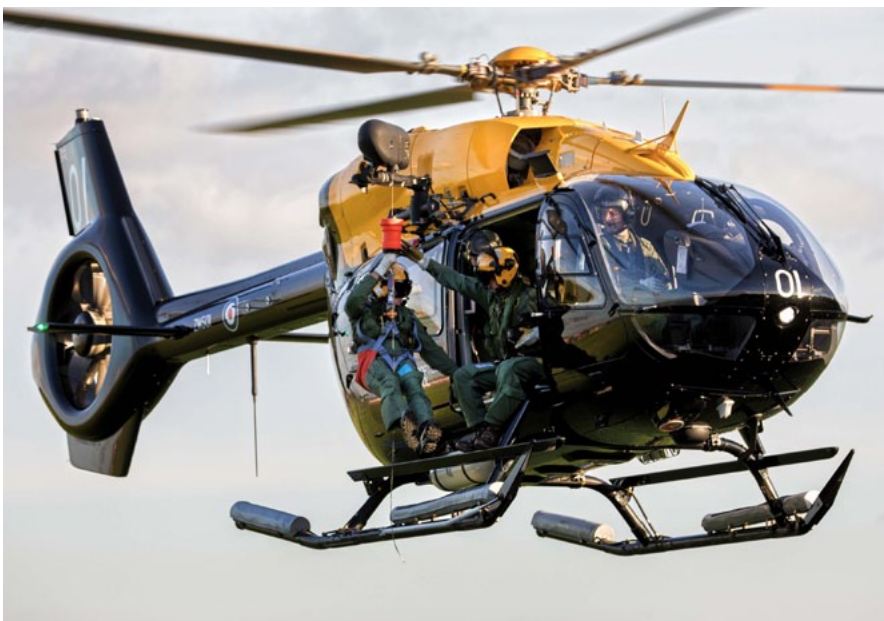
MFTSH 145 Jupiter