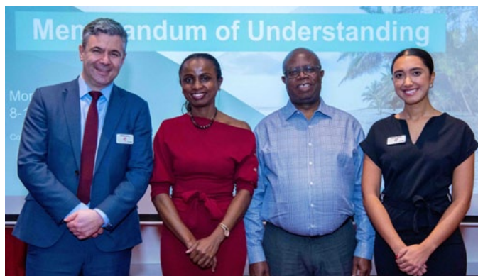
Routes and AFRAA sign agreement

Small added; "For over a decade, Routes has recognised the importance of enhancing intra-Africa connectivity. We are delighted that senior