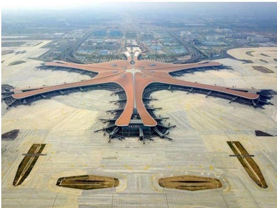
Beijing Daxing International Airport