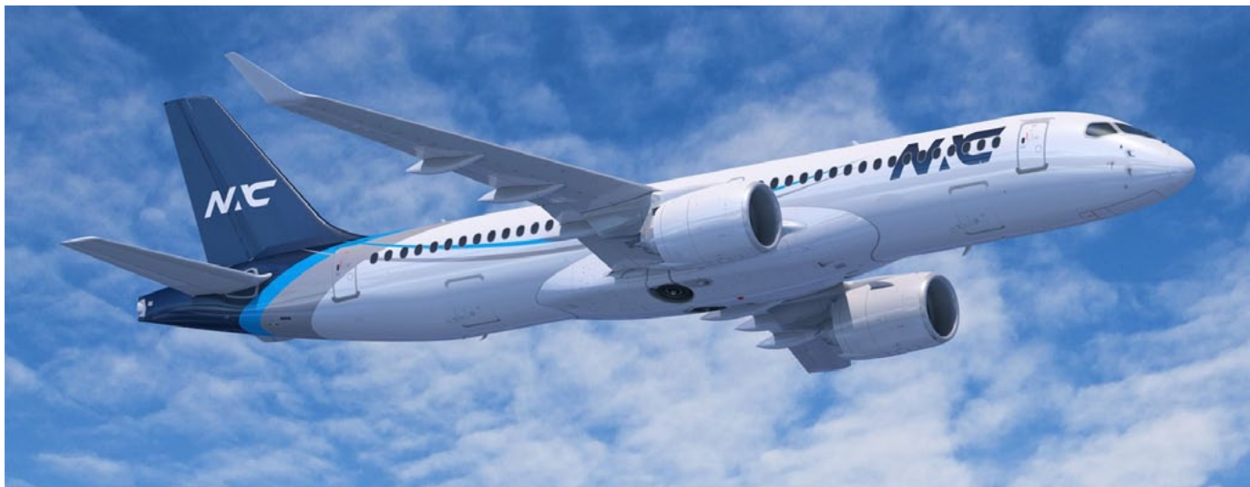
A220-300 Nordic Aviation Capital