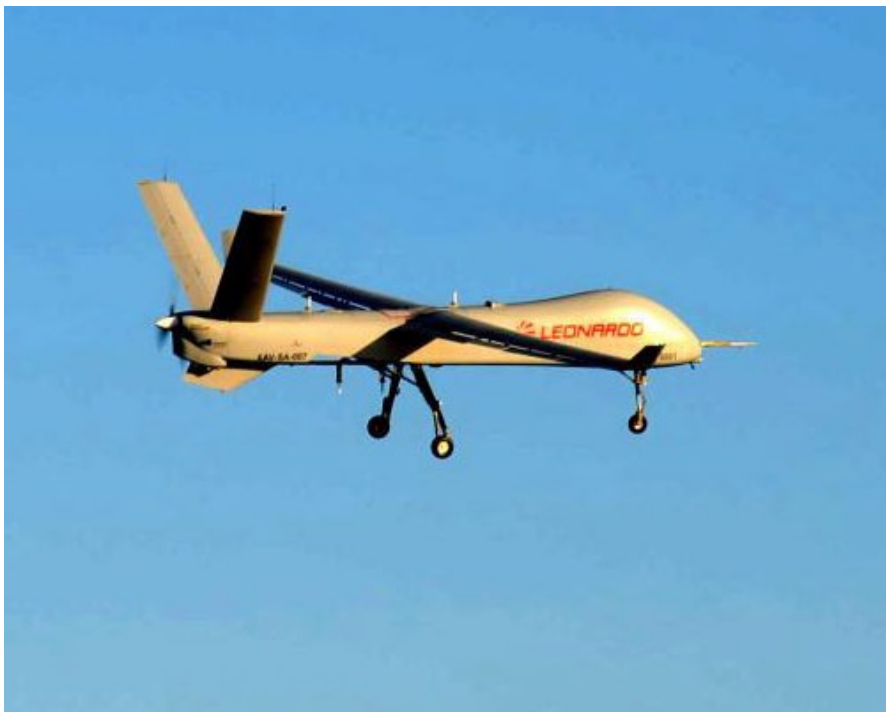
Falco Xplorer maiden flight

Leonardo's new Falco Xplorer drone aircraft has performed its maiden flight. Falco Xplorer S/