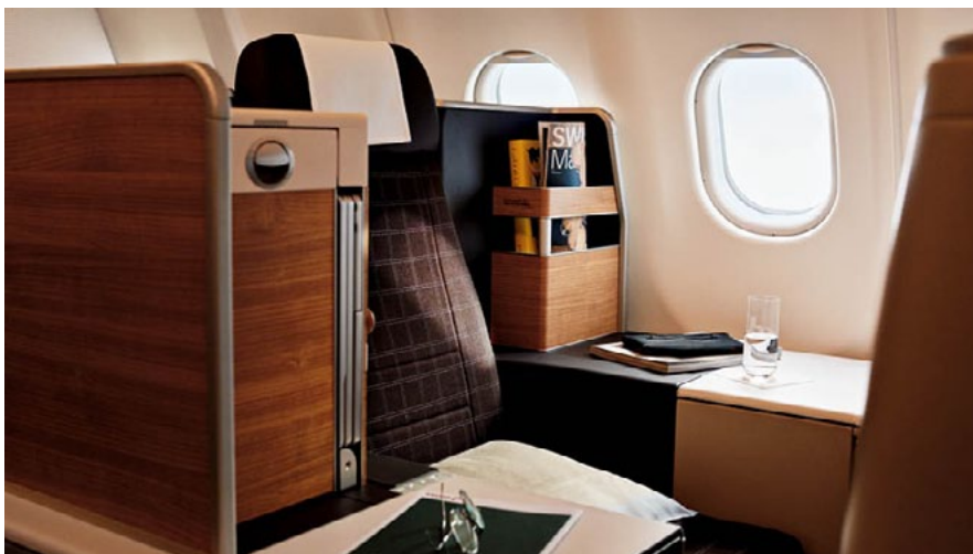
SWISS A340 Business Class