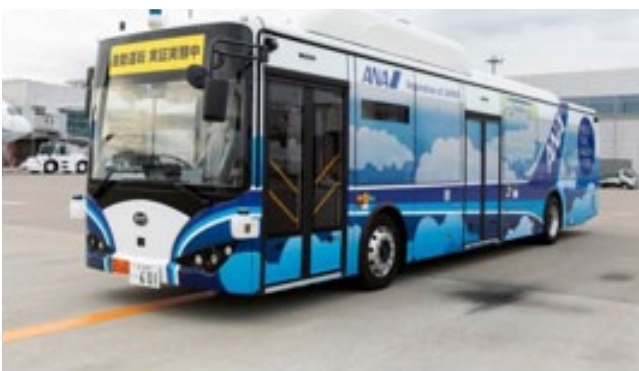
Autonomous electric bus at Haneda International Airport

For the full year 2019, Farnborough Airport saw a year-on-year increase in air traffic movements of 5.3%. For December 2019, the airport recorded an 11.6% increase in movements for the month, with initial forecasts indicating this positive trend is set to continue in 2020. Specifically, air traffic movements to and from the U.S. experienced significant growth during the year, with an increase of 15% year-on-year. In the same period, traffic to and from Europe saw a 6% increase. The airport has also introduced its new brand identity following the recent acquisition. The new brand both embodies the airport's philosophy to consistently offer a five-star service and reflects the award-winning architecture of the airport's facilities with its iconic shapes and curves.