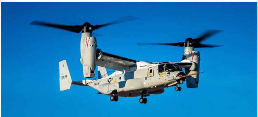
The maiden flight of the first CMV-22B Osprey