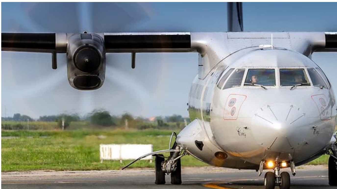
ATR 42-500 aircraft