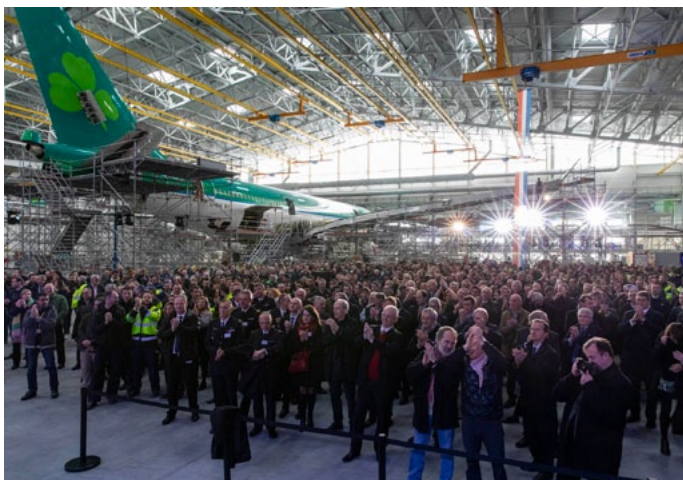
Grand opening of Sabena's new hangar in Bordeaux, France