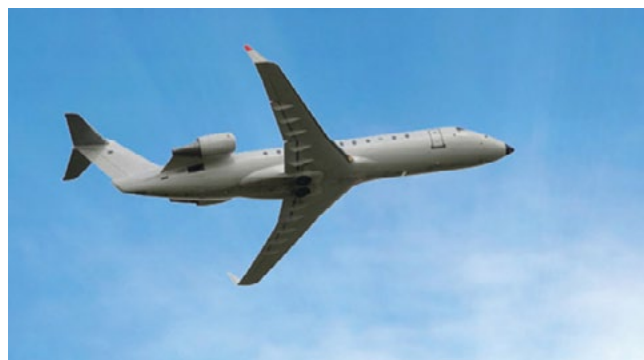
Aventure Aviation acquires two Bombardier CRJ200 airframes for teardown

Aventure Aviation has acquired two Bombardier CRJ200 airframes (MSN 7344 and MSN 7397) for teardown from Beatech Power Systems. The dismantling is currently underway in Kingman, Arizona, USA. "This purchase continues Aventure's strategic support for our CRJ200