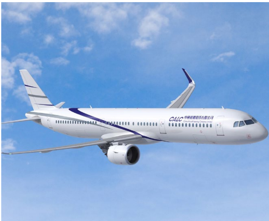
CALC orders additional 40 A321neo aircraft