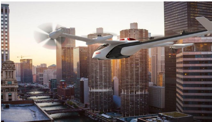
Honeywell is developing a line of lighter-weight, electro-mechanical flight controls to bring agility and safety to a new breed of urban air vehicles