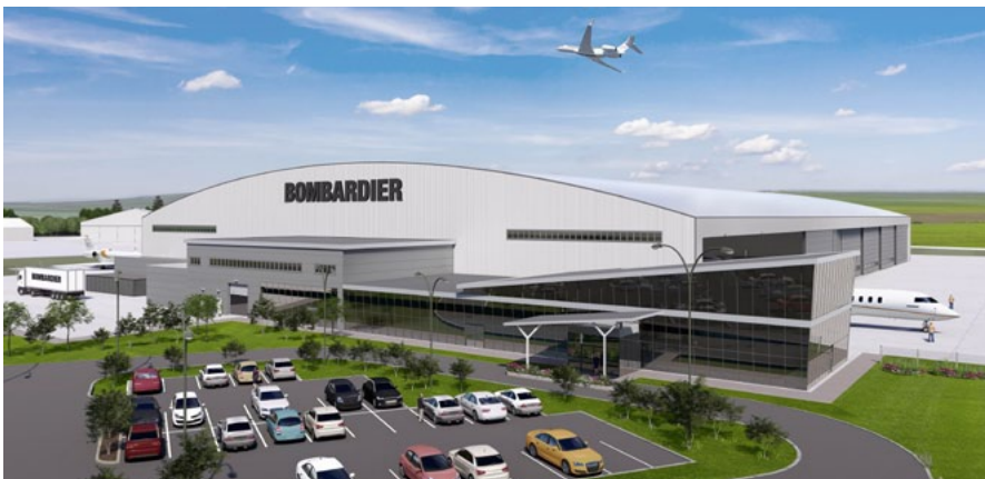
Bombardier plans to expand its London Biggin Hill service center