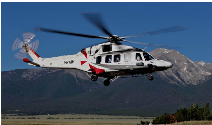
The all new AW189k helicopter