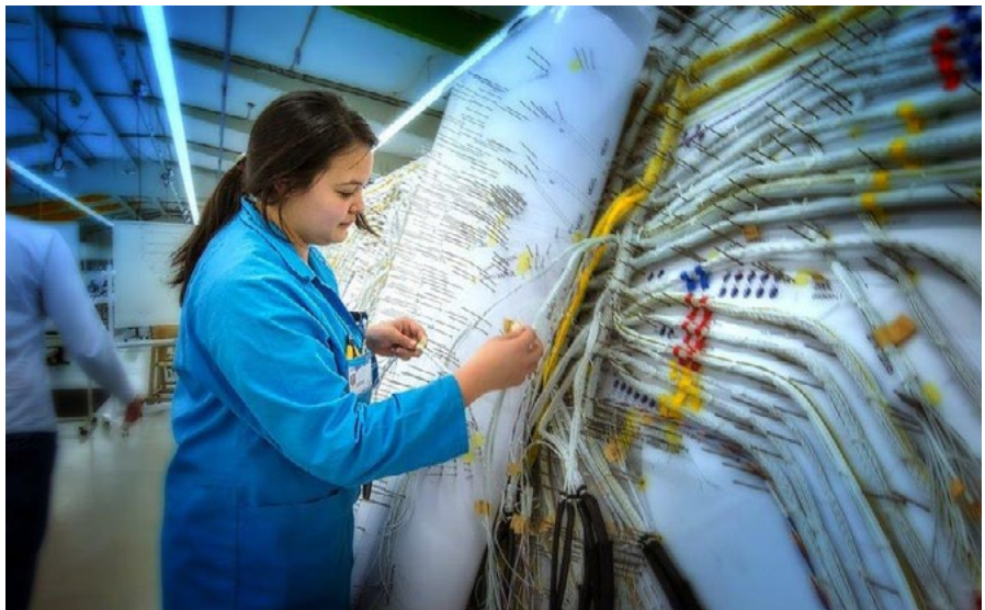
GKN Fokker Elmo to supply electrical wiring interconnection systems (EWIS) for the new Boeing 777X family

GKN Fokker Elmo has signed a contract to supply electrical wiring interconnection systems (EWIS) for the new Boeing 777X family. Production will start at the end of the first quarter 2020. The 777X EWIS will be delivered out of a number of strategic global locations, such as China, the Netherlands, and the new state-of-the-art wiring facility in Pune, India. GKN Fokker Elmo has supplied EWIS to Boeing for more than a decade for the 777, 737 and P-8A. The new contract reaffirms GKN Fokker Elmo's position as a strategic EWIS supplier to Boeing.