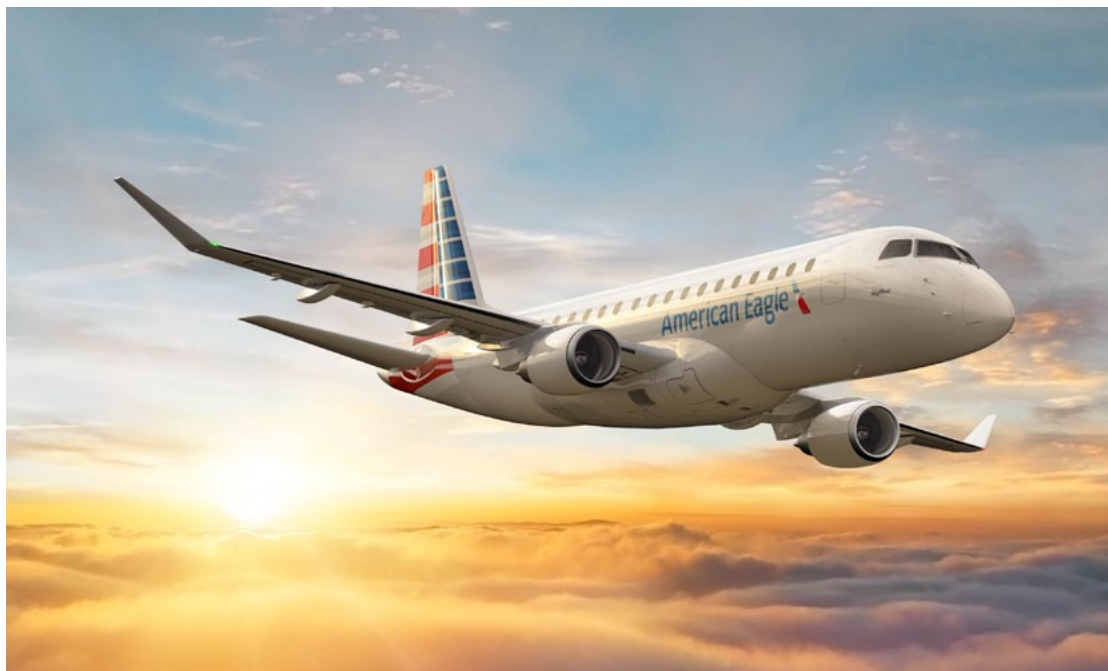
SkyWest will operate 20 new E-Jets within the American Airlines network