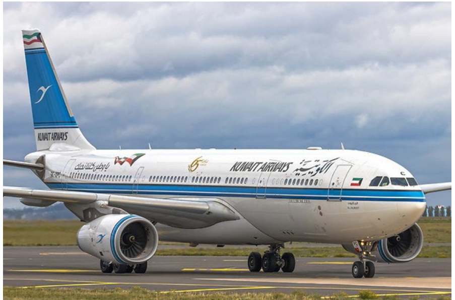
Kuwait Airways Airbus A330-200