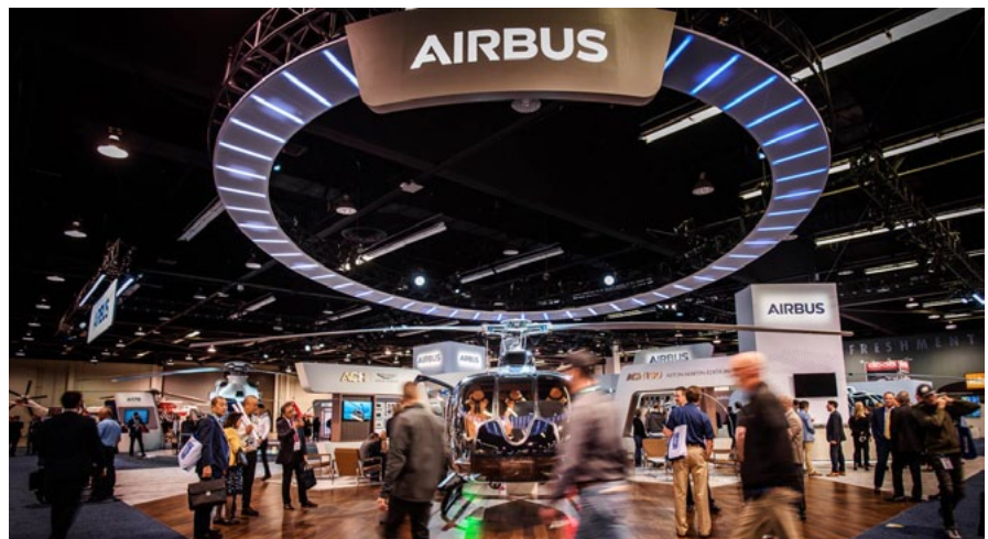
Airbus booth at Heli-Expo 2020