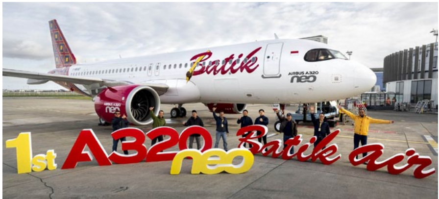
The first A320neo for Batik Air arrives at Soekarno-Hatta International Airport in Jakarta, Indonesia