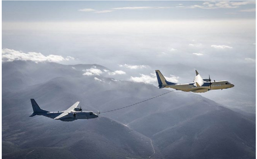
AAR tanker flight test