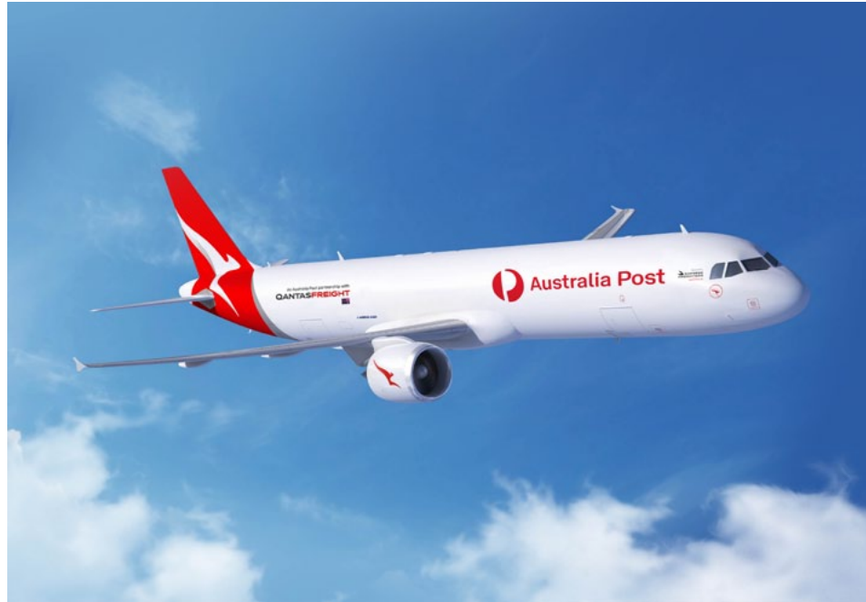
The first delivery to Qantas will be in July 2020.

As part of its latest restructuring programme, South African Airways will drop four longhaul routes including Hong Kong and Munich. Four regional routes will be dropped including Luanda and Ndola and finally the airline will axe three domestic stations including Durban. Other changes are the deployment of more fuel-efficient aircraft, changing of organisational structures and renegotiation of contracts with suppliers.