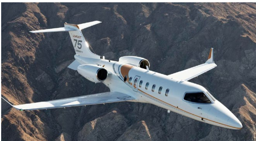
Learjet 75 Liberty