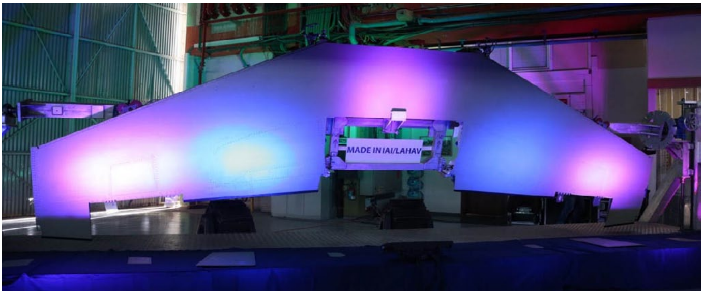
IAI has been producing T-38 wings since 2011