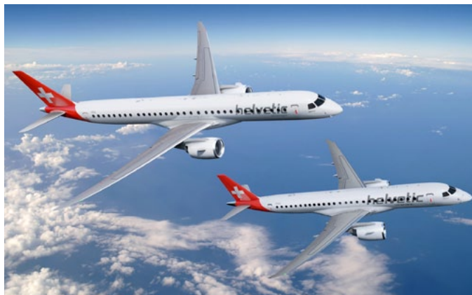
12 E2s are on order with a further 12 options.

By the end of February 2020, the Swiss regional airline welcomed its third new Embraer E190-E2, as part of a strategic fleet upgrade plan that began in October last year. The Zurich-based carrier ordered 12 E190-E2s in July 2018, with options for another 12. Helvetic Airways is also considering converting some of its current orders for the E190-E2s to the larger E195-E2 version.