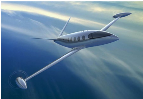
Alice, the all-electric aircraft launched by Eviation