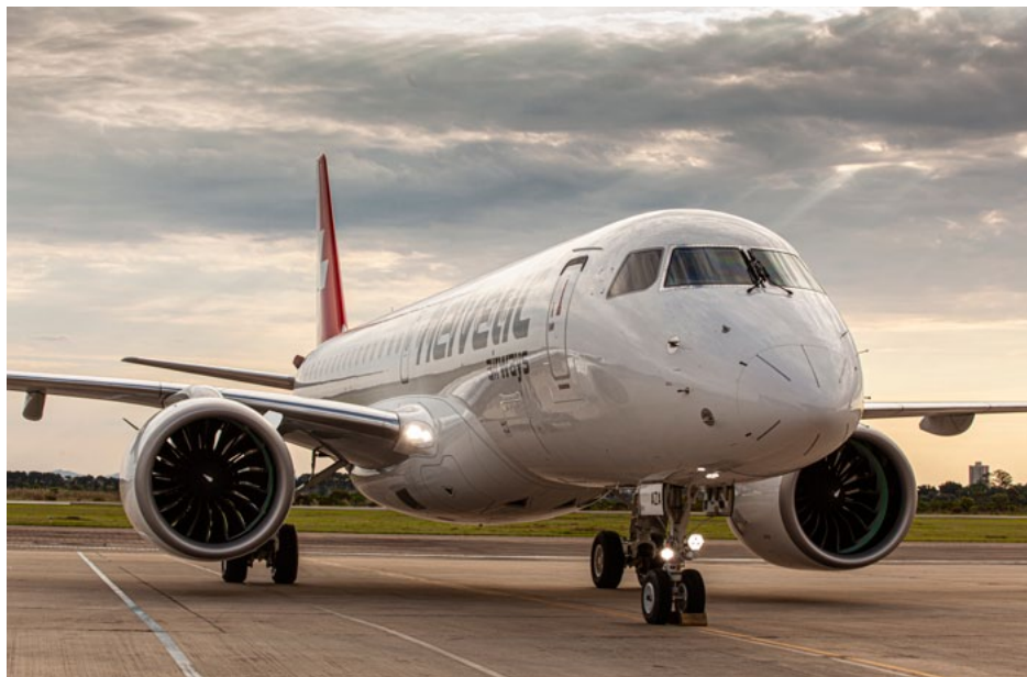
New E190-E2s are joining the fleet.

Ryanair has welcomed new EU guidelines to ensure that European travel can return to flying within the European Union in the coming weeks in a manner that best protects their health and the health of airline crew. These effective guidelines now allow Europe's tourism industry to restart in July and August. Ryanair especially welcomes the advice on face masks, which reflects Ryanair's own health protocols as it returns to widespread flying on 1 July.