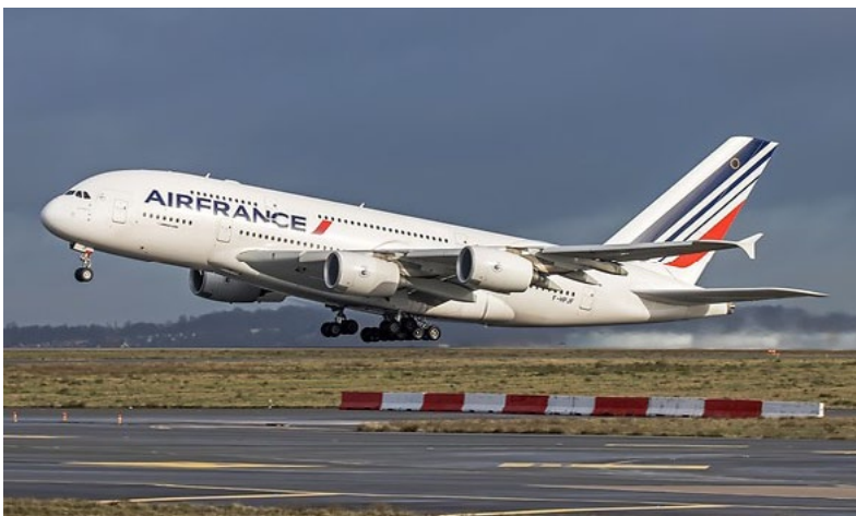
Air France's A380 fleet will be phased out

Air France-KLM Group has announced the definitive end of Air France's Airbus A380 operations. Initially scheduled by the end of 2022, the phase-out of the Airbus A380 fleet is beginning with immediate effect and fits in the Air France-KLM Group fleet simplification strategy of making the fleet more competitive, by continuing its transformation with more modern, high-performance aircraft with a significantly reduced environmental footprint. Five of the Airbus A380 aircraft in the current fleet are owned by Air France or on finance lease, while four are on operating lease. The global impact of the Airbus A380 phase-out write down is estimated at €500 million (US$550 million) and will be booked in the second quarter of 2020 as a non-current cost/expenses. The Airbus A380 will be replaced by new-generation aircraft, including the Airbus A350 and Boeing 787, whose deliveries have not yet been completed.