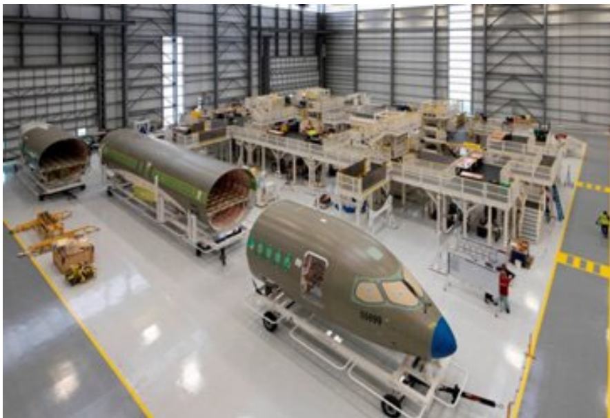
A220 FAL, Mobile, Alabama