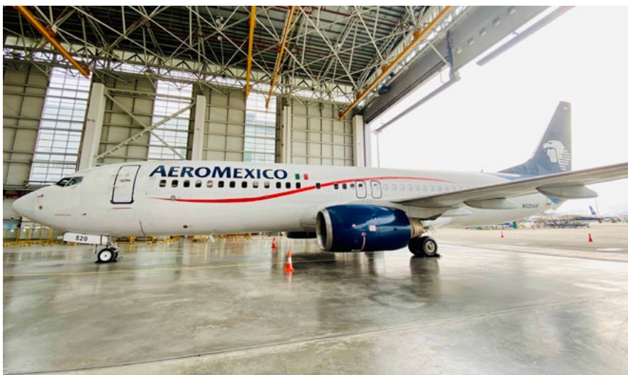
GAMECO starts first PTF conversion on a Boeing 737-800