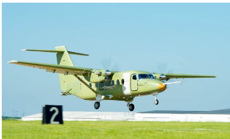
Cessna SkyCourier takeoff