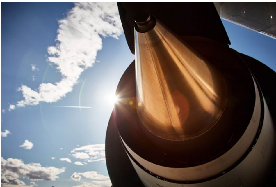
Boeing 777 engine LH Cargo

In response to previously reported COVID-19 F-35 supplier delays, Lockheed Martin is taking proactive measures to mitigate impacts and position the program for the fastest possible recovery by adjusting work schedules, maintaining specialized employee skillsets, and accelerating payments to small and vulnerable suppliers, to continue meeting customer commitments. Lockheed Martin and the International Association of Machinists and Aerospace Workers (IAM) agreed to a temporary alternate work schedule for F-35 production line employees in Fort Worth to maintain its skilled workforce. The alternate schedule allows Lockheed Martin to staff the production line to meet a slower workflow resulting from supplier delays. In addition, it provides a work rhythm that retains the expertise of the talented workforce and provides opportunities to adjust work to better support production.