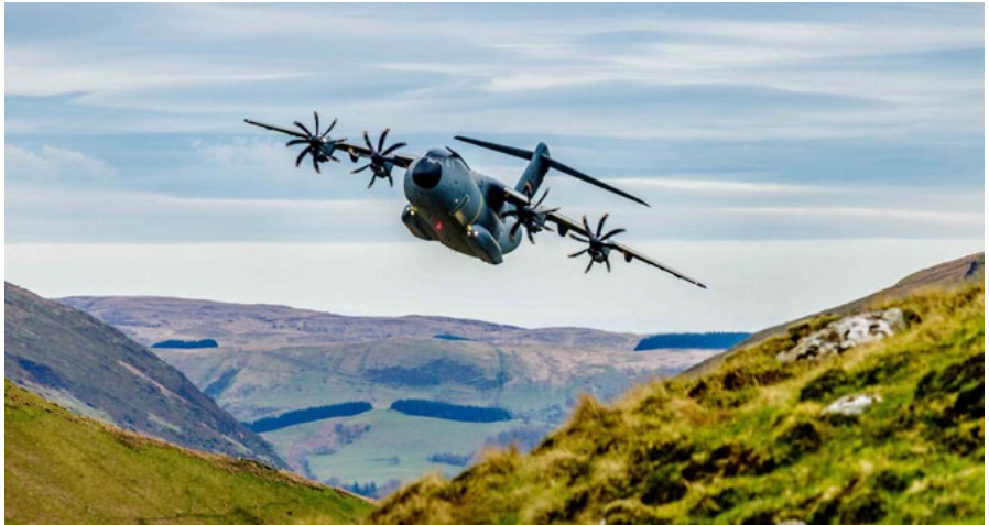
RAF A400M performing low level flights in Wales