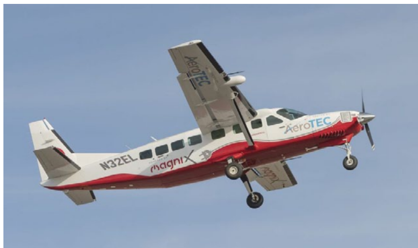
Successful maiden flight of an all-electric Cessna Grand Caravan 208B