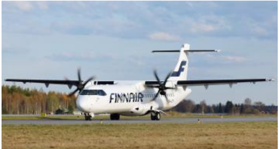
Finnair signs ten-year GMA with ATR for Nordic Regional Airlines' fleet of 12 ATR 72-500