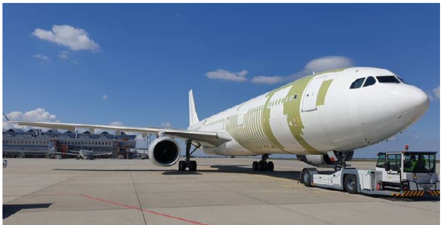
EFW delivers another A330-300P2F freighter to customer DHL