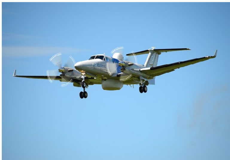
Beechcraft King Air 350CER aircraft