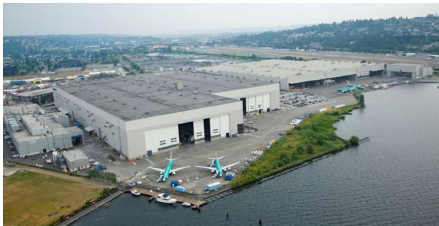
Photo: Boeing Renton production facility