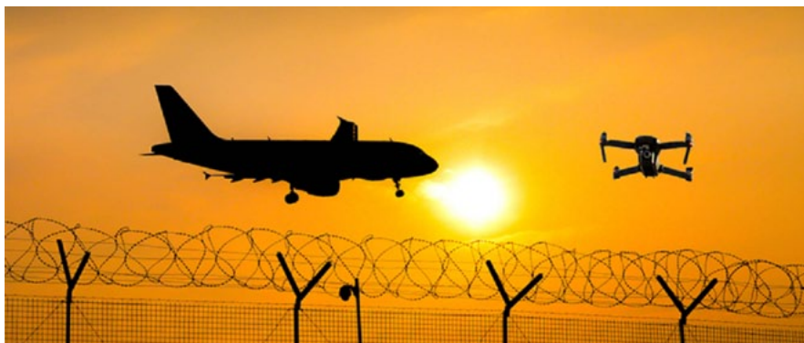
Anti-drone-system to be installed at Bristol Airport, U.K.