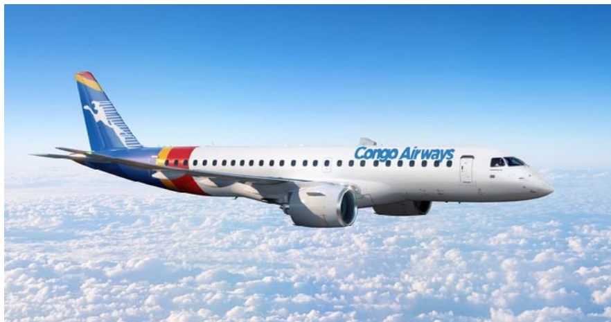
Congo Airways converts order of two Embraer E175 into E190 E2 aircraft