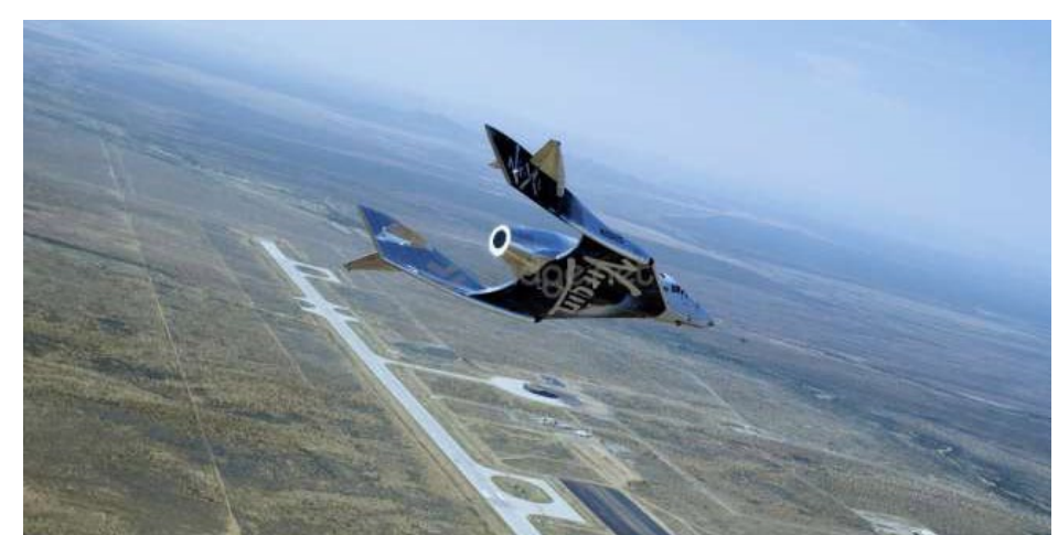
SpaceShipTwo Unity second glide flight over Spaceport America