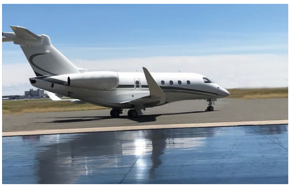
Embraer has completed the conversion of a Legacy 450 to a Praetor 500 jet

Embraer Services & Support has completed the first conversion of a Legacy 450 to a Praetor 500 for an undisclosed customer. The conversion was performed at the Embraer Executive Jets Service Center at Bradley International Airport in Windsor Locks, Connecticut. In order to generate the impressive range improvements synonymous with the Praetor 500, the level-sensing wiring in the fuel tanks were replaced, the over-wing gravity fueling ports were moved, the fuel measurement system was relocated, and the wing ribs were reinforced to hold additional weight. These adjustments entailed updates to the flight control systems, including a new avionics load for the acclaimed Collins Aerospace Pro Line Fusion flight deck. Most noticeably, the iconic swept winglets of the Praetor were installed, and the placards and logos were replaced to officially convert