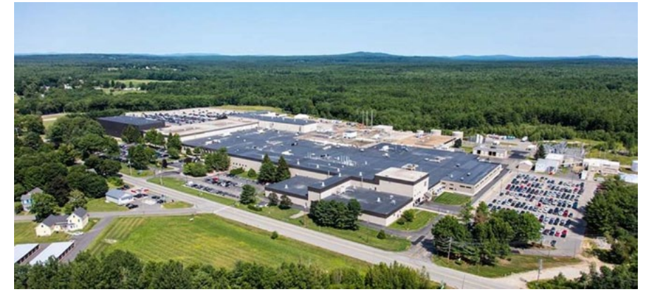
North Berwick facility

Pratt & Whitney will invest US$12.5 million into its North Berwick, Maine facility, expanding its Pratt & Whitney GTFTM maintenance, repair and overhaul (MRO) network. North Berwick will perform maintenance on high-pressure turbine and high-pressure compressor modules for the PW1100G-JM engine. This investment bolsters Pratt & Whitney's global GTF MRO Network and accelerates growth by utilizing the facility's already existing expertise. The addition of GTF high-pressure turbine and high-pressure compressor module maintenance at North Berwick benefits GTF operators by reduction of lead-time associated to compressor upgrade and repair. The transformation will consist of upgrades to the current space, increasing efficiencies to help minimize disruption to the current flow of operations and allowing for a seamless transition as the facility takes on a new role.