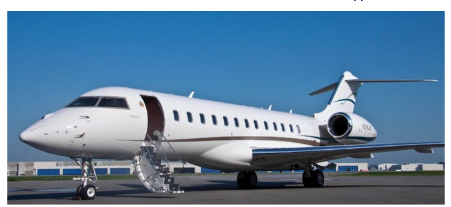
Photo: Inflite The Jet Centre, adds Bombardier Global 700 Series to its approvals

Inflite The Jet Centre (ITFC), part of the Inflite group of companies, based at London Stansted Airport, will add base maintenance capability for the Bombardier Aviation Global Express (BD700 Series). Capability for both line and base MRO is now active under ITJC's Part 145 organization EASA rating. Further applications are in process to add the BD700 Series to all other NAA existing capabilities held by ITJC. "This is another important strategic step for Inflite The Jet Centre, following our acquisition of Bombardier MRO specialist Excellence Aviation early in 2019. This latest accreditation expands the portfolio of aircraft types we can support and we look forward to working with, and supporting more Global Express operators in Europe and the Middle East," commented Alan Barnes, General Manager, Inflite The Jet Centre. With the now concluded integration of Excellence Aviation businesses, (which include CAMO and its Part NCC aircraft management business) Inflite can offer solid expertise as a Bombardier Challenger and Global BD700 MRO business. "This equips us well to serve demands for maintenance support on Bombardier platforms in the region – and at our London Stansted home too," Barnes added. Inflite remains fully operational for both base and line maintenance, as does Inflite's fully integrated VVIP integrated award-winning FBO – available to all corporate services.