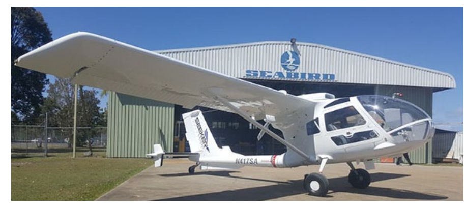
The Seeker, a mission specific, light observation aircraft