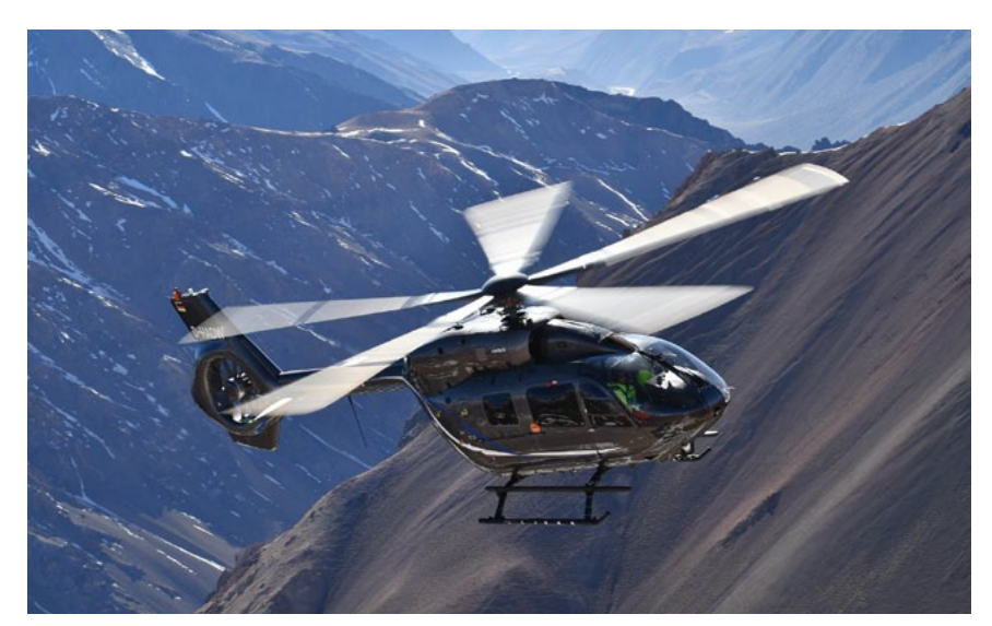
The five-bladed H145 helicopter has received type certification from EASA

Airbus Helicopters' five-bladed H145 has been certified by the European Union Aviation Safety Agency (EASA), clearing the way for customer deliveries towards the end of summer 2020. The certification covers the full range of capabilities, including single-pilot and instrument flight rules (IFR) and single-engine operations (Cat.A/ VTOL), along with night vision goggles capability. This latest upgrade of the H145 family adds a new, innovative five-bladed rotor to the multimission H145, increasing the useful load of the helicopter by 150 kg (330 lbs.). The simplicity of the new bearing-less main rotor design will also ease maintenance operations, further improving the benchmark serviceability and reliability of the H145, while improving ride comfort for both passengers and crew. Certification by the Federal Aviation Administration (FAA) will follow later this year. The certification for the military version of the five-bladed H145 will be granted in 2021.