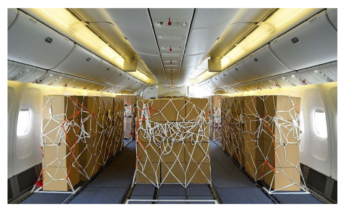
Emirates offers more cargo capacity with aircraft modification