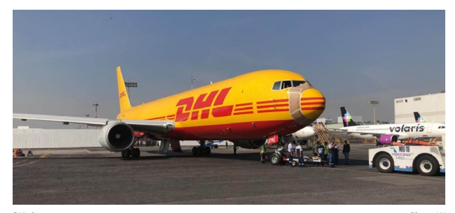
DHL Cargo

Israel Aerospace Industries (IAI) will convert an additional three B767-300 passenger aircraft to cargo aircraft, with the potential for a fourth aircraft. This contract marks another major milestone for IAI's aircraft cargo conversions program and the broadening of business for IAI's Aviation Group. Over the last decade, converted B767 have been the backbone of the cargo aircraft market. To maintain IAI's future dominance in this market and to offer new solutions, IAI's Aviation Group signed a contract with GECAS to design, develop, and certify the B777-300 passenger-to-cargo conversion. IAI's Aviation Group was established in January 2019 by combining the company's commercial and military aircraft activities. IAI's Aviation Group is one of the world leaders in the design, development, and certification of passenger-to-cargo aircraft conversions.