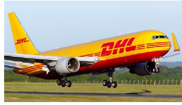
DHL Express is building a new cargo hub at Munich Airport