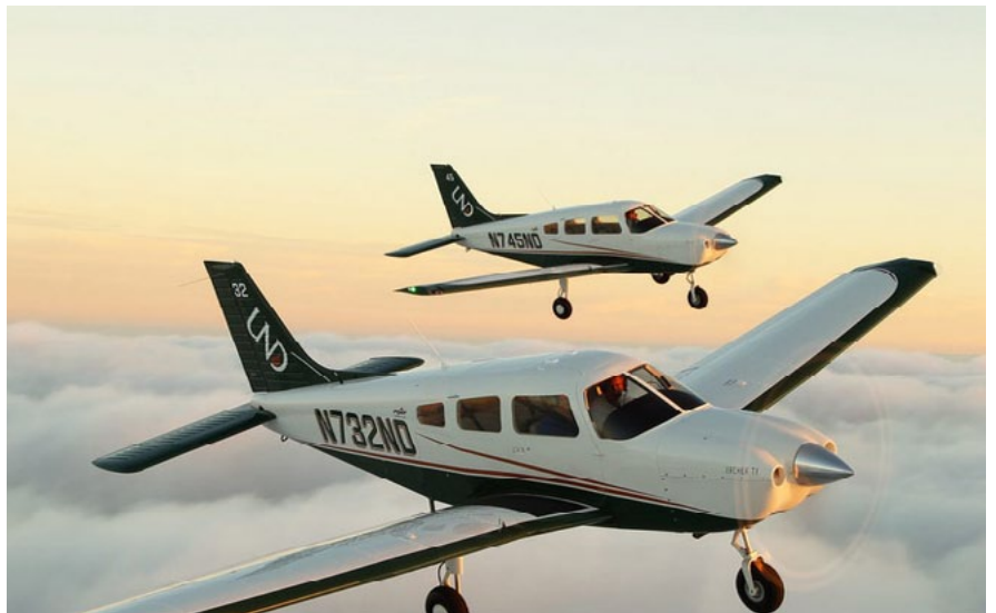
Photo: Piper Archer TX