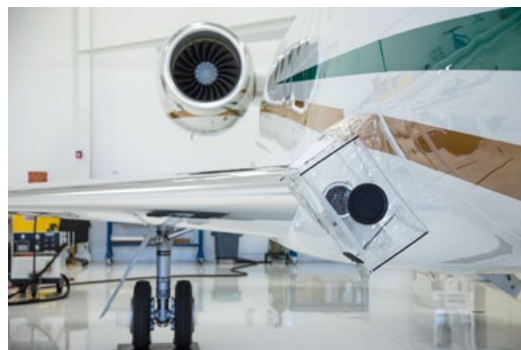
DIRT Bag™/Falcon 2000

The DIRT Bag™ provides composite repair technicians with an off-the-shelf solution to provide contamination and environmental control during the repair process. During damage removal, the DIRT Bag™ keeps contaminants from entering the surrounding environment and can be used with HEPA vacuum systems. The DIRT Bag™ can also be used during the repair layup or curing process to keep outside contaminants from entering the repair area, and can be used with environmental control units that provide temperature and humidity controlled air to the enclosed area. "This new product is a game changer for those working in repair technology and we are excited to partner with CRG to bring the DIRT Bag™ to the composite repair market," said Eric Casterline, President, HEATCON / HEATCON Composite Systems. "This product is an ideal complement to Heatcon's portable composite repair equipment, further reducing the time needed to complete a repair." The DIRT Bag™ is used by both military and commercial aircraft repair organizations, is listed in Boeing structural repair manuals and the F-35 General Use Consumables List (GUCL), and can be used for other applications where contamination control is needed. It can be set up in minutes and can be customized for each repair or coating removal situation.