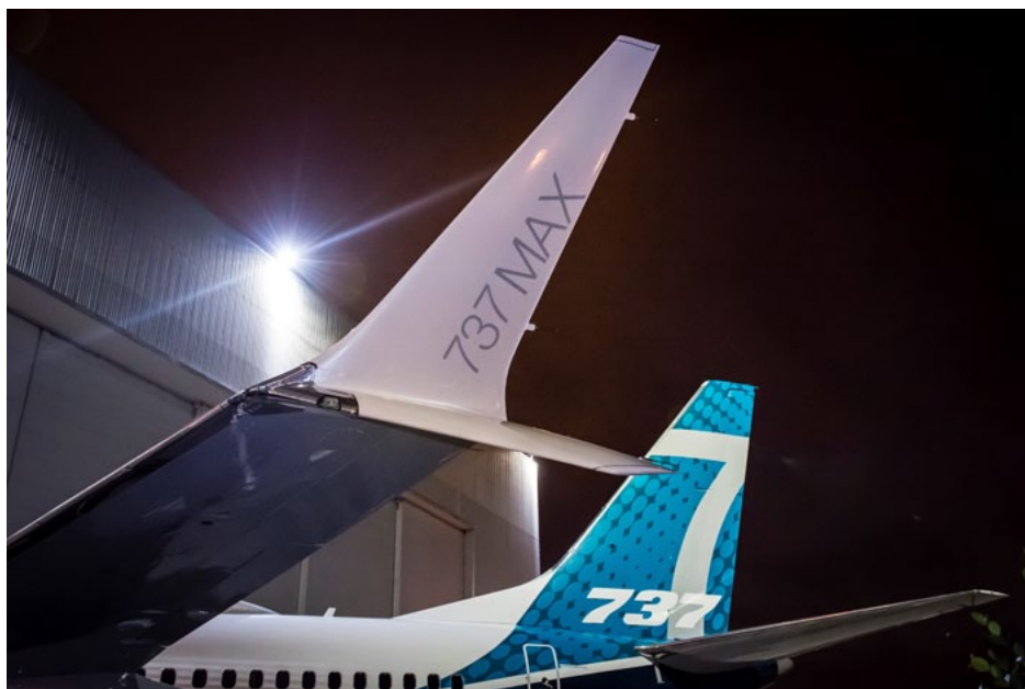
The 737 Max was grounded back in March 2019.

L3Harris announced the certification for the 25-hour cockpit voice and data recorder, SRVVR25™. The recorder supports the 25-hour Cockpit Voice Recorder mandate for new aircraft entering service starting January 2021 across EASA and other regions. The SRVVR25 product line offers airlines the most data ever available for analysis which, combined with the L3Harris portfolio of flight data analysis services, enables airlines to take advantage of big data like never before.