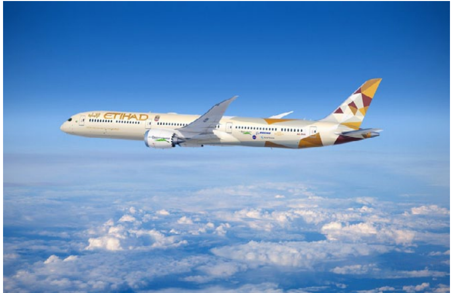
Etihad 787-10 Dreamliner