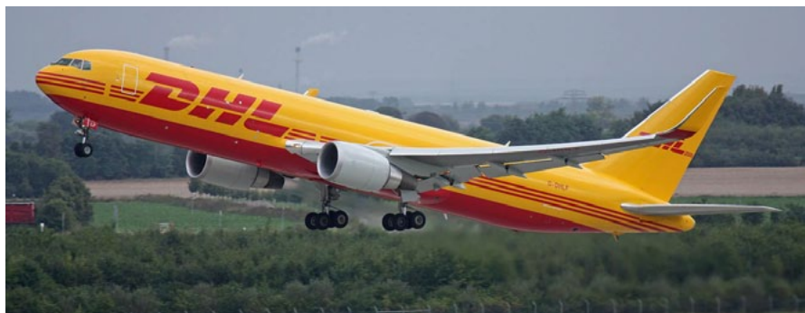
DHL Express will add four 767-300 Boeing Converted Freighters (BCF)