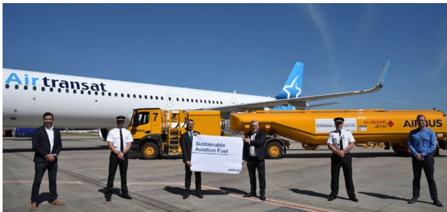
Photo: Air bp supplies sustainable aviation fuel for Airbus delivery flights

GKN Aerospace will participate in feasibility studies on technology development for the future combat air system and next generation of fighter jet engines with partner industries in Italy and the U.K. GKN Aerospace and Saab are the two companies in Sweden that are part of the cooperation. Air combat capabilities are designated by Sweden as a national security interest. Through a joint technology development, the Swedish aviation industry will be able to build and sustain their continuous development of competencies and capabilities in a cost-effective way. GKN Aerospace was contracted in Q1 2020 by FMV to conduct a study on collaboration with Rolls Royce on technology development of the future fighter engine. Future fighter jets will impose completely new demands on the engine. It will not only have to meet increased propulsion needs, but also supply increasingly demanding sensors and weapons with more power output and cooling needs. Therefore, a substantial technological leap will be needed compared to today's fighter engines.