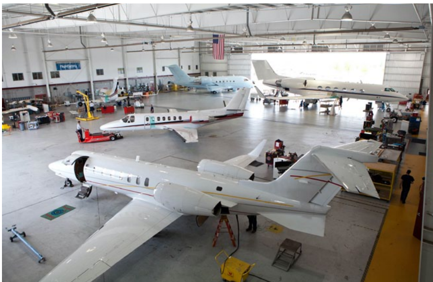
Photo: Stevens Aerospace hangar

Stevens Aerospace and Defense Systems (Stevens) Greenville, S.C. (GYH) facility successfully completed a multi-day surveillance audit with zero nonconformances earlier this month. This audit marks a four-year anniversary of Stevens' registration commitment to the AS9110 and ISO9001 Quality Management System standards. Commitment and adherence to these standards furthers Stevens' goals of continuous improvement and customer satisfaction. Stevens Aerospace and Defense Systems provides MRO (maintenance, repair, and overhaul) services on a wide range of aircraft produced by manufacturers such as Textron, Bombardier, Gulfstream, Pilatus, Dassault and Embraer.