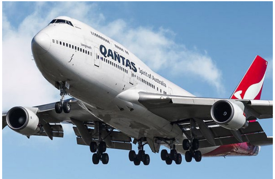
Qantas says farewell to the "Queen of the skies"