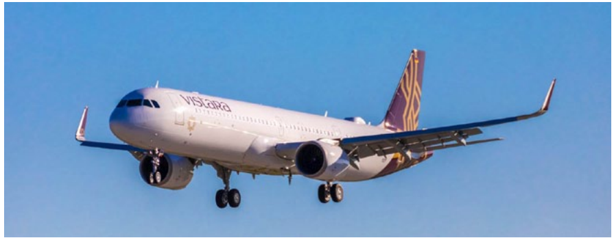
Air Vistara receives first A321ne