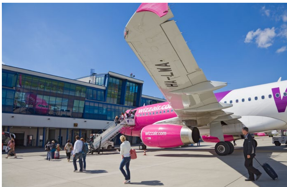
Wizz Air plans to expand UK based operations.

Central and East European low-cost operator Wizz Air has announced a major expansion of its Latvian operations, adding one new Airbus A320 aircraft to the Riga base. This will enable the start of seven new routes from Riga to Bergen in Norway, Birmingham in the United Kingdom, Billund in Denmark, Hamburg in Germany, Reykjavik in Iceland, Stockholm Skavsta in Sweden, Trondheim in Norway and one new route from Tallinn in Estonia to Bergen in Norway.