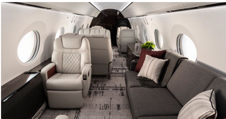
The all-new Ionization System complements the Signature Gulfstream Cabin Experience