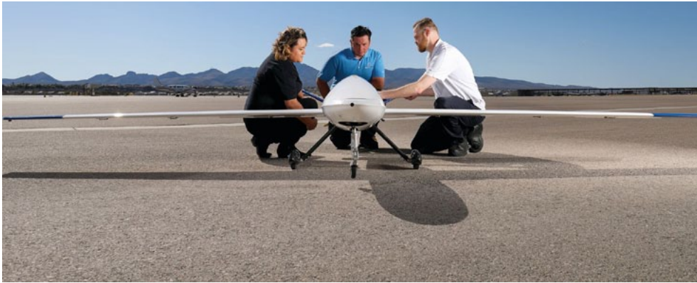
Barfield is now a Robotic Skies authorized repair station