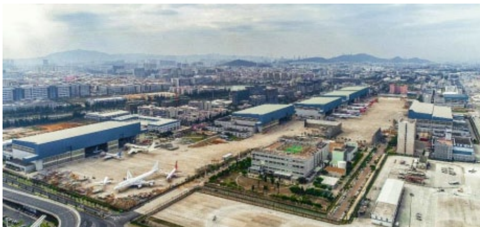
Photo: HAECO Xiamen's hangar facilities