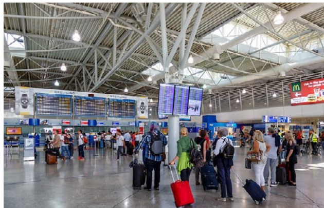
Athens International Airport