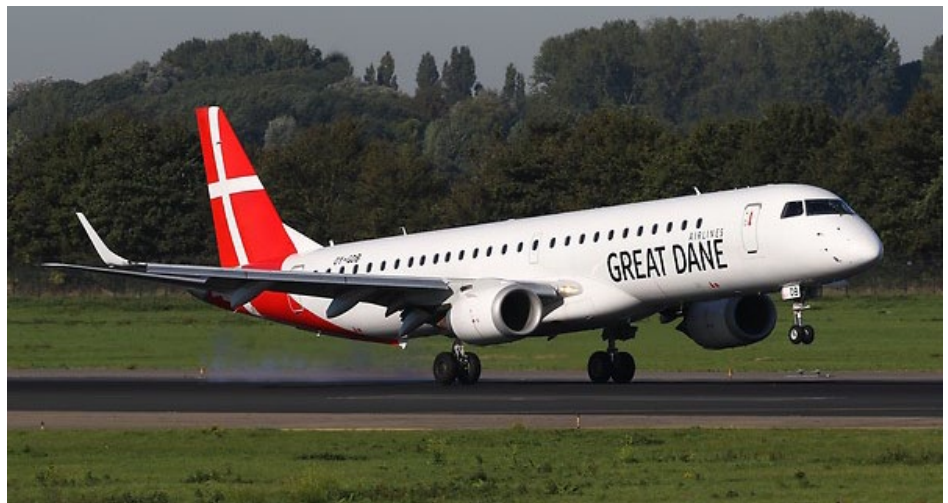
Great Dane Airlines and AerFin sign long-term Flight-Hour-Agreement

Danish Charter operator Great Dane Airlines, has become the latest airline to select AerFin's BeyondPool™ component Flight-Hour solution, signing a long-term Flight-Hour Agreement (FHA) to support the airline's fleet of three (3) E195 E-Jet aircraft. AerFin's BeyondPool™ is a fully bespoke, comprehensive E-Jet component FHA solution, covering repair, overhaul, pooling and on-site provisioning of E-Jet rotatable component inventory and is fully supported out of Great Dane Airlines' main hub in Aalborg, Denmark. In addition, AerFin will also be positioning a comprehensive on-site stock of inventory into Hanoi, Vietnam – this, following the recent announcement that Great Dane Airlines will be providing ACMI capacity support for Vietnamese operator, Bamboo Airways.