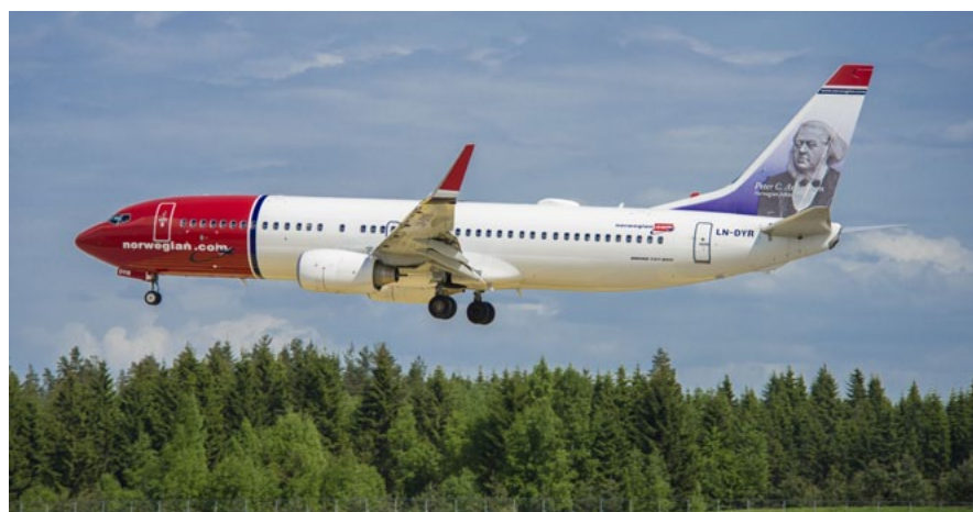
Norwegian and LHT extending cooperation for another five years