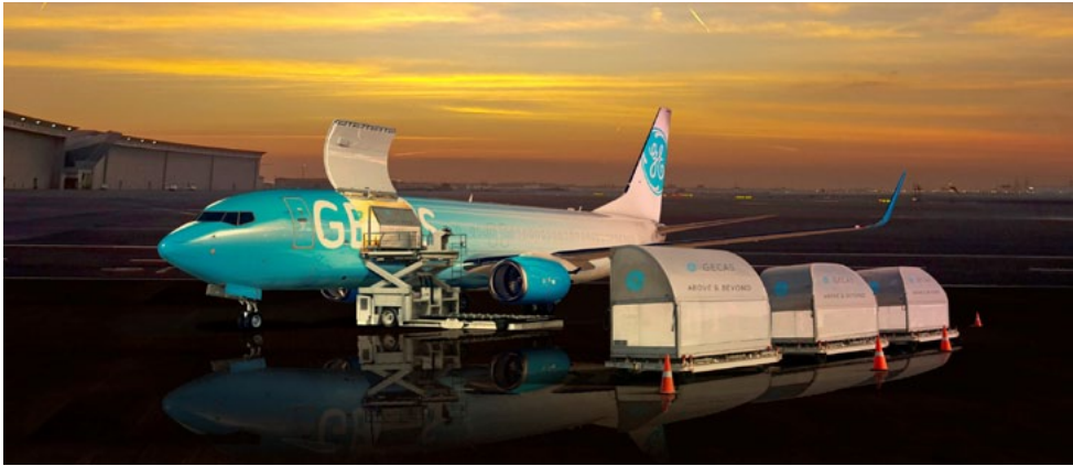
GECAS has signed an agreement with Boeing for the conversion of 11 737-800 BCF-options to firm orders