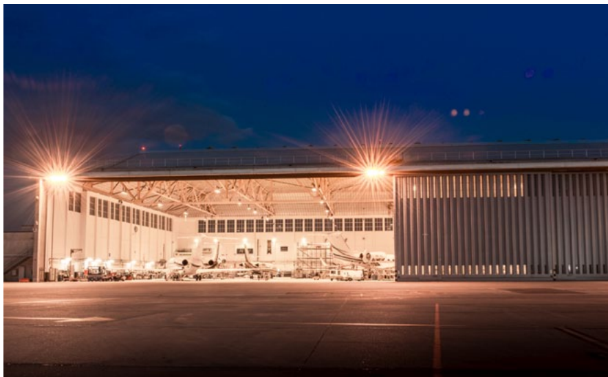
Photo: Jet Aviation Geneva hangar

Jet Aviation's maintenance facility in Geneva has re-delivered its first 240-month check on a Global Express. The inspection was successfully performed in conjunction with an avionics modification and a number of service bulletins. The company has since initiated a combined 120/180-month check on a Global Express XRS — with more in the pipeline. Essentially a repeat (the second) of the largest inspection for the Global Express, the 240-month check involves an extensive overhaul of all major aircraft systems and structures, including the internal side of the aircraft's fuselage. Gaining access for such rigorous scrutiny necessitates removal of the entire cabin and soundproofing materials, ensuring exceptional care in their storage, while paying great attention to detail for the duration of the check.