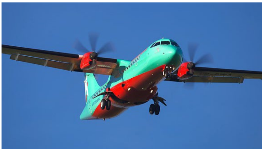
Windrose ATR 72-600