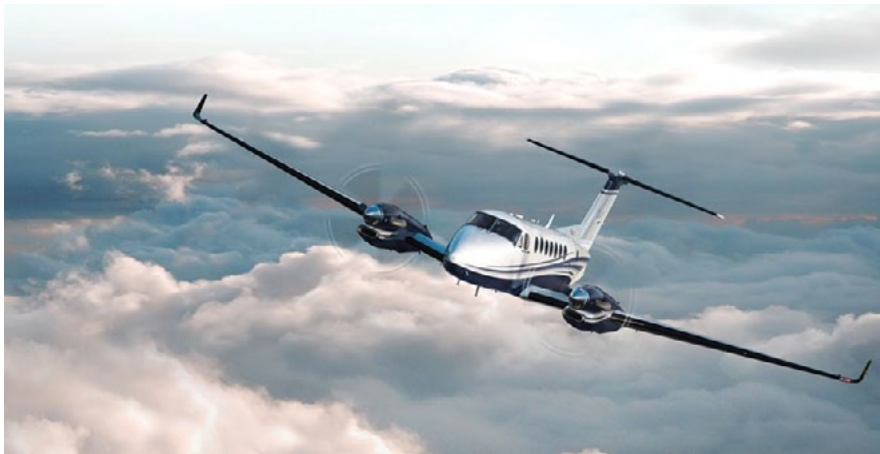
Beechcraft King Air 360