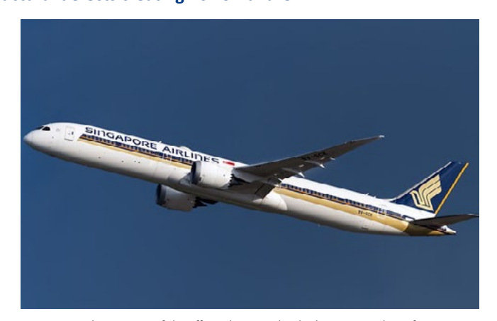
Singapore Airlines is one of the affected carriers by the latest grounding of Boeing 787 Dreamliners

Boeing has been forced to ground eight of its 787 Dreamliner jets after the discovery of two manufacturing flaws which could severely compromise the structural integrity of the aircraft. The problems in question relate to the composite barrel sections at the rear of the 787. These sections are melded together at the South Carolina Boeing plant, which has previously suffered lapses in quality, including the 2015 case where Boeing was fined US$12 million. "We are taking the appropriate steps to resolve these issues and prevent them from happening again," Boeing said by email. The company said it has "fully briefed" the U.S. Federal Aviation Administration and is "conducting a thorough review into the root cause." The first issue affecting the grounded aircraft involves shims that are built to a robot's precise, laser-guided measurements to fill any gaps where the two barrels are joined to ensure that stresses are distributed as designed. Some of the gaps were improperly filled, according to Air Current, as reported by Bloomberg. The aircraft also were found to have roughness on the inner skin of the barrel wall. Combined, the two issues meant that the segments might not withstand the required structural loads, the Air Current said. This news is especially critical for Boeing after structural flaws with pickle