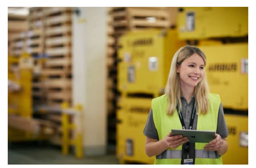
Airbus Canada has officially transferred the overall A220 material management services offer to Satair

Satair, an Airbus services company, has taken the lead on global material support and services for A220 operators, working in close coordination with the A220 program team within Airbus Canada Limited Partnership. In July, Airbus Canada officially transferred the overall A220 material management services offer to Satair over the summer and as part of the integration of the program into Airbus. Overall, Satair will now be in charge of a wide range of value-adding activities including planning and inventory; purchasing; quality inspection; certification; warehousing and distribution; customer order handling; 24/7 AOG handling; initial provisioning and tool lease. Over time, Satair will also develop the areas of parts lease, repair and exchange for the A220. The customer order handling of the A220 program is now solely managed in the Satair-OEM parts and services channel with its global group of Satair companies. The A220 program headquarters are located in Mirabel, Canada, together with main customer services functions, such as engineering expertise and a 24/7/365 Customer Response Center.