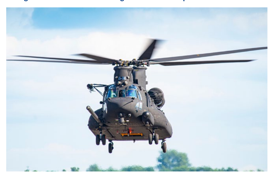
Boeing delivered the first next-generation MH-47G Block II Chinook to U.S. Army Special Operations