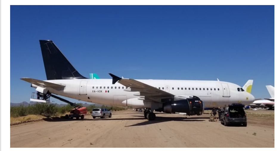
APOC Aviation has acquired one Airbus A319 from Aircastle for teardown