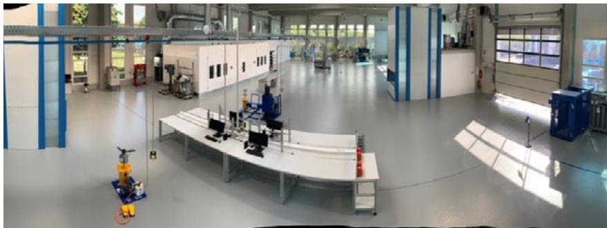
Photo: AeroMates shop floor

AeroMates , a Part-145-certified start-up company that specializes in maintenance, repair and overhaul of aircraft components including wheels (MRO), has decided to go for AMOS, the comprehensive, fully integrated MRO software solution. Since the two founders both have gained vast AMOS experience from their former careers, the decision was quickly taken in favor of AMOS. This valuable know-how has also allowed AeroMates to implement AMOS in an extremely quick and streamlined approach according to the special needs of a start-up with a limited number of users and a lean set-up. AeroMates is an MRO-shop located close to Cologne, Germany. The company offers maintenance, repair and overhaul of wheels and non-destructive testing (NDT) of aircraft components. AeroMates is Part-145 certified and a start-up company that only launched its business at the beginning of 2020.