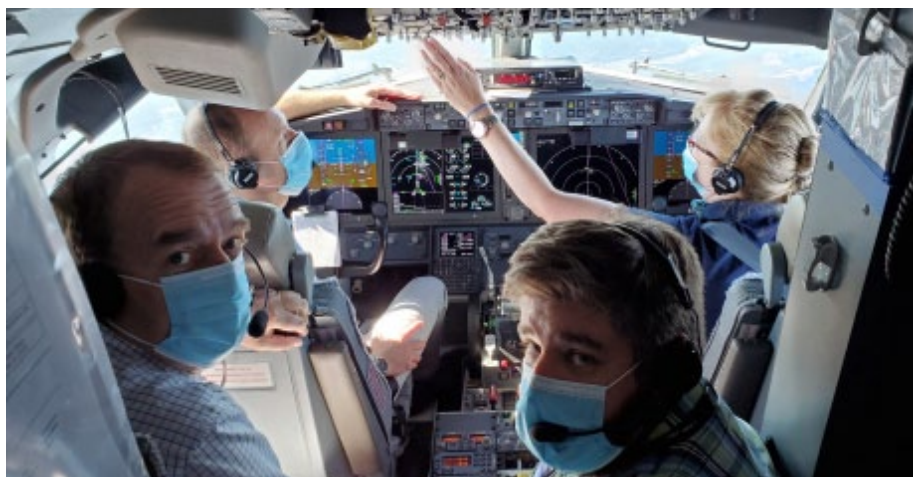
EASA has completed its test flight of the Boeing 737 MAX in Vancouver, Canada