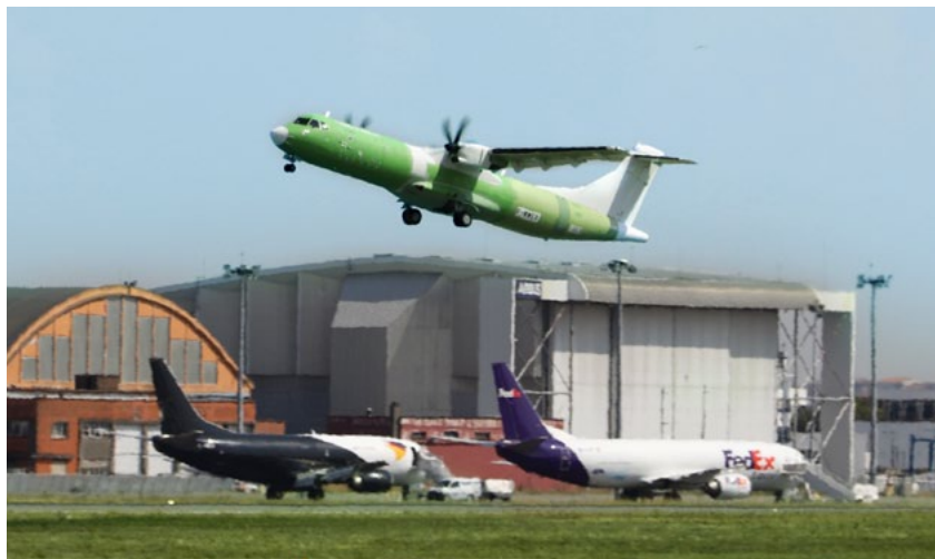
First flight of ATR's new purpose-built regional freighter aircraft

Regional aircraft manufacturer ATR has reported the successful first flight of its new purpose-built regional freighter aircraft. The flight took off at its Saint-Martin site and lasted two hours. During the flight, crew onboard performed several tests to measure the new aircraft's flight envelope and flight performance. The first aircraft will be delivered to FedEx Express, one of the world's largest cargo airlines and express transportation companies, which placed a firm order for 30 aircraft, plus 20 options, in November 2017. The brand-new straight-from-factory cargo aircraft will offer a number of unique advantages to operators. With a large cargo door included as part of the original design and the same wide cross section as all ATR aircraft, the freighter will be able to accommodate bulk cargo and industry-standard pallets and containers. The aircraft will also provide operators with the very latest avionics suite, which can be continuously upgraded.