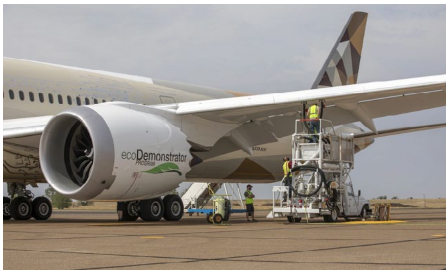
Boeing, Etihad ecoDemonstrator fueling

Boeing and Etihad Airways have concluded testing on the aerospace company’s 2020 ecoDemonstrator program last week with a cross-country flight using a 50/50 blend of sustainable and traditional jet fuel. Flying from Seattle to Boeing’s manufacturing site in South Carolina, Etihad’s newest 787-10 Dreamliner used the maximum sustainable fuel blend permitted for commercial aviation. The transcontinental flight also demonstrated a new way for pilots, air traffic controllers and airline operations centers to communicate simultaneously and optimize routing. Boeing’s ecoDemonstrator program takes promising technologies out of the lab and tests them in the air to accelerate innovation. This year’s program evaluated four projects to reduce emissions and noise and enhance the safety and health of passengers and crew. All of the 787-10 test flights used a blend of traditional jet fuel and sustainable fuel produced from inedible agricultural wastes to minimize emissions, with the final flight operating at the maximum 50/50 commercial blend. The fuel from World Energy and supplied to Boeing by EPIC Fuels has been certified by the Roundtable on Sustainable Biomaterials to reduce carbon emissions by more than 75% over the fuel’s life cycle.