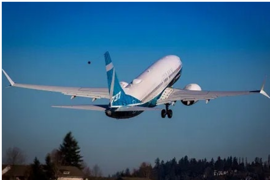
Photo: Boeing 737 MAX

US congressional investigators have released a 239-page report on the 737-MAX crashes where it identifies both Boeing Co (Boeing) and the Federal Aviation Administration (FAA) for “repeated and serious failures”, together with a culture of “concealment” instigated by Boeing to withhold important information from the FAA. The report identified Boeing’s sense of urgency to launch the 737MAX to compete with the Airbus A320. “Our report lays out disturbing revelations about how Boeing – under pressure to compete with Airbus and deliver profits for Wall Street – escaped scrutiny from the FAA, withheld critical information from pilots and ultimately put planes into service that killed 346 innocent people,” said Chairman Representative Peter DeFazio, an Oregon Democrat. “What’s particularly infuriating is how Boeing and FAA both gambled with public safety in the critical time period between the two crashes.” The report said Boeing made “faulty design and performance assumptions” especially