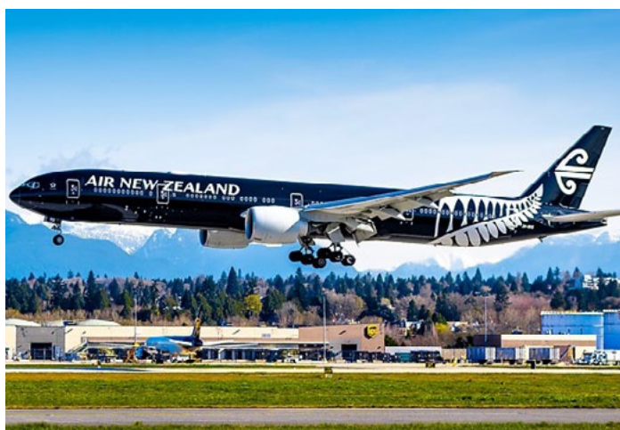
Air New Zealand Boeing 777