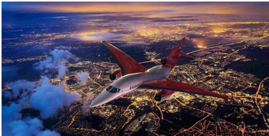
Honeywell and Aerion collaborate on flight deck for new AS2 Supersonic Jet

Moscow Domodedovo Airport served 4.7 million passengers in June-August 2020.