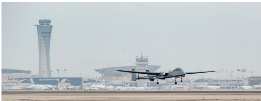
IAI Heron lands at Ben Gurion Airport