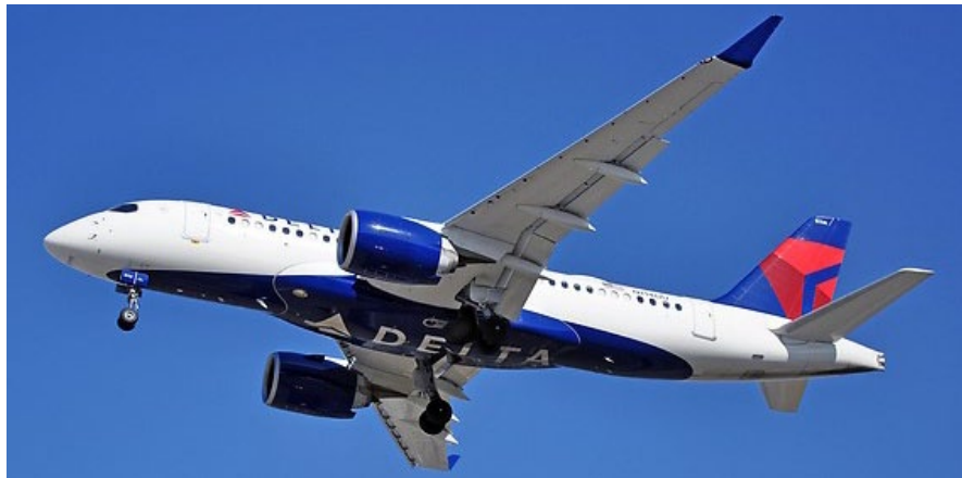
Delta Air Lines