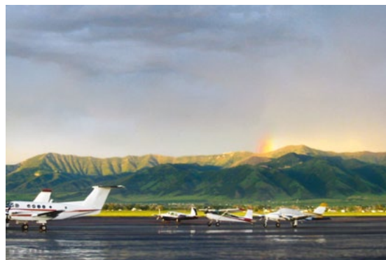
Bozeman FBO tarmac