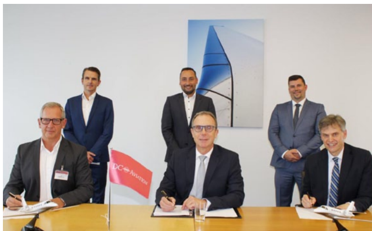
Contract signing of DC Aviation and AeroVisto Group