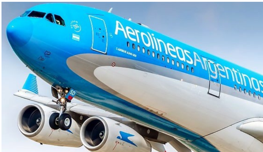
AvAir has purchased the complete surplus inventory of Aerolíneas Argentinas