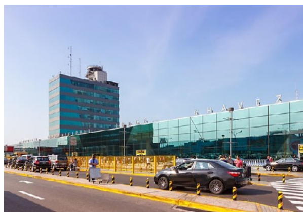
Jorge Chávez International Airport, Lima