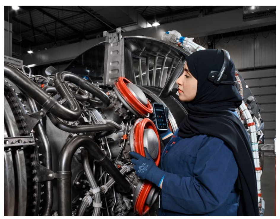
Sanad has been a trusted MRO partner for the V2500 engine

Sanad, an industry leader in aerospace engineering and leasing solutions, and a wholly owned subsidiary of Mubadala Investment Company (Mubadala), announced a new one billion Emirati dirham (US$272 million) deal with Pratt & Whitney and International Aero Engines (IAE). The new agreement will see Sanad Aerotech providing IAE with expanded MRO services for its V2500 engines, which powers the Airbus A320 family of aircraft. The announcement of the new deal came during the Global Aerospace Summit in Abu Dhabi, where industry leaders convened to discuss the impact of COVID-19 on the aerospace, defense and space industries. This agreement expands the cooperation between Sanad and IAE in the field of maintenance, repair and overhaul (MRO) of aircraft engines. Under the agreement IAE, the manufacturer of V2500 engines, will offload V2500 engines for MRO services to Sanad's state-of-theart facility in Abu Dhabi Airports Free Zone. This step reaffirms the confidence of major global OEMs to collaborate with Abu Dhabi's resilient aerospace sector especially during turbulent times.