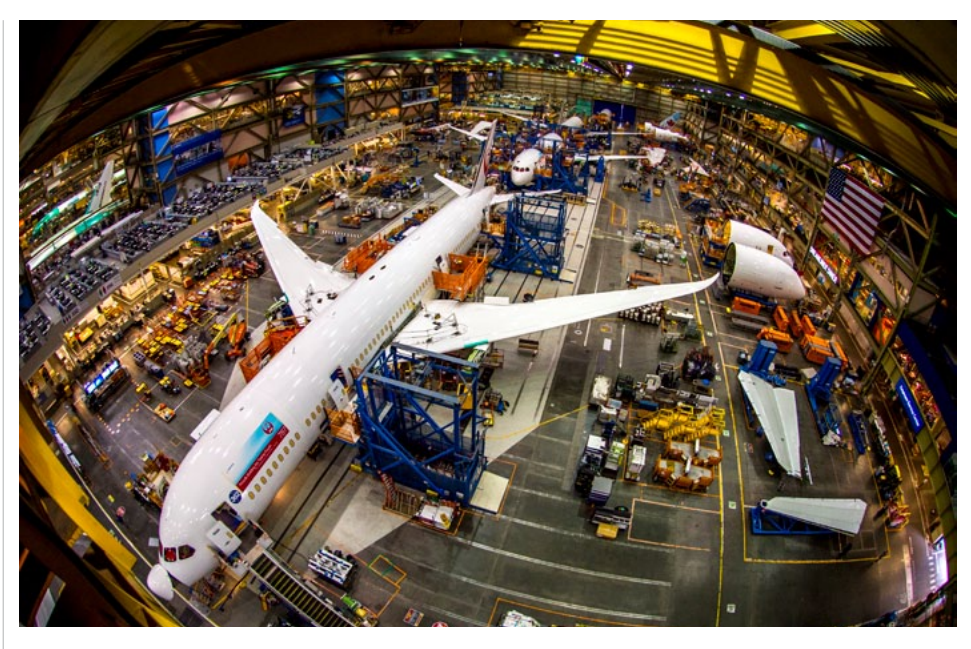
787 Factory

IAG Cargo has announced a new direct service from the UK to Lahore, Pakistan, starting from October 2020. The service will run yearround, four times per week from London Heathrow. The new service will strengthen IAG Cargo's existing presence in Pakistan, which since 2019 has also included flights to Islamabad, which resumed service on 14 September 2020 operating daily between the two capital cities.