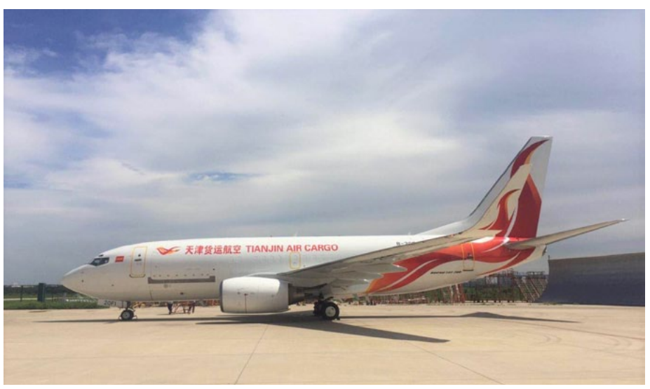
Tianjin 737-700BDSF Photo

Israel Aerospace Industries (IAI) Aviation Group has delivered the first passenger-tocargo converted Boeing 737-700 to Chines airline Tianjin Cargo Airlines, which will become the first operator of this type of aircraft in China. The conversion work was carried out at the Tianjin MRO site under a partnership agreement with IAI and Haite Group for developing the B737-700 and B737-800 STC. The two companies have been working together since 2017 to meet the increasing demand for cargo aircraft in China and around the world. With the rise of e-commerce and the resulting higher demand for cargo aircraft, together with the effects of the COVID-19 pandemic, cargo aircraft have become the lifeblood of the Chinese economy. In recent years, most narrow-body cargo aircraft were based on the Classic Boeing 737 family, in particular the 737-400 model. As the Classic models are