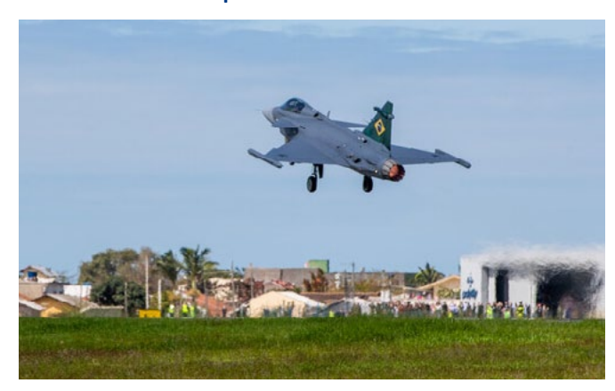
Embraer Gripen E take-off at Navegantes, Brazil