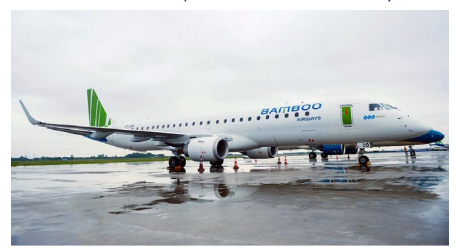
Bamboo Airways' Embraer E195 makes its debut in Vietnam