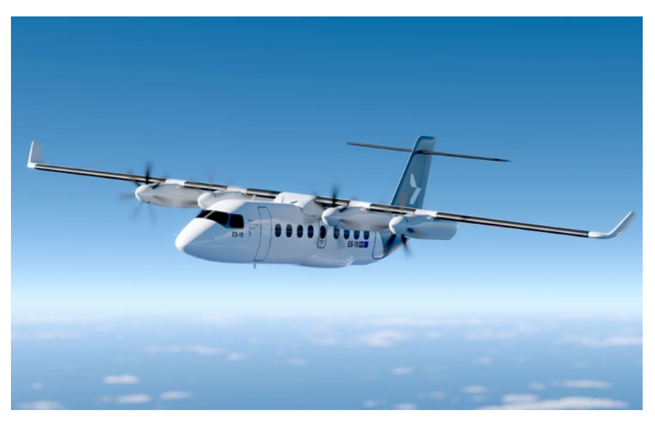
Heart Aerospace developed ES-19, an all-electric aircraft scheduled to enter commercial service as early as 2026

Baines Simmons, part of the Safety & Security division at Air Partner, the global aviation services group, has partnered with Heart Aerospace, the Research Institutes of Sweden and Electroflight to provide consultancy and training support in the development of a commercially viable all-electric aircraft. Working alongside its three partners, Baines Simmons assisted in securing funding for the project as part of the Eureka Initiative, a joint U.K./Swedish government scheme that supports and funds international collaborative research-and-development projects. The joint project is future-facing and comes at a time where scrutiny of the ecological impact of the aviation industry is increasing. The development of all-electric aircraft is a vital next step in minimizing air travel's environmental footprint, and Baines Simmons is working to support a greener future for the industry. The secured matchfunding of €1.6 million (US$1.9 million) will be used to further develop the battery power system of the Heart Aerospace-developed