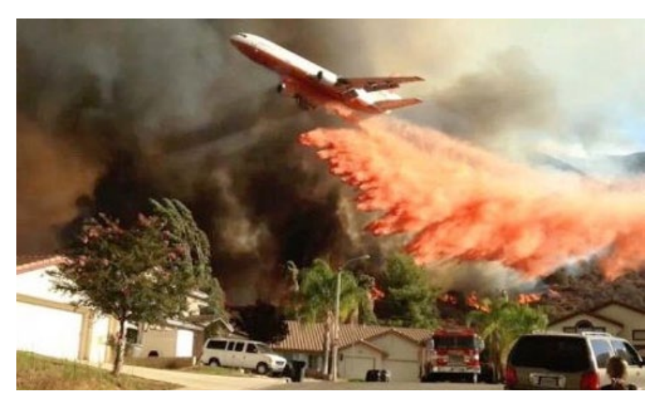
Aerial firefighting pilots can see through smoke and identify targets and terrain on their incredible missions

The International Air Transport Association has downgraded its 2020 traffic forecast from down 63% to down 66% when compared to 2019 traffic volume on the back of poor August figures that have reflected a weaker-than expected recovery from the effects of the global pandemic. August revenue passenger kilometers (RPKs) were down 75.3% when compared to August 2019, only a marginal improvement for the July figure of a 79.5% contraction. While domestic markets are outperforming international ones in terms of recovery, August capacity (available seat kilometers or ASKs) was still down 63.8% compared to a year ago, and load factor plunged 27.2 points to an all-time low for August of 58.5%. IATA identified the key negative turning