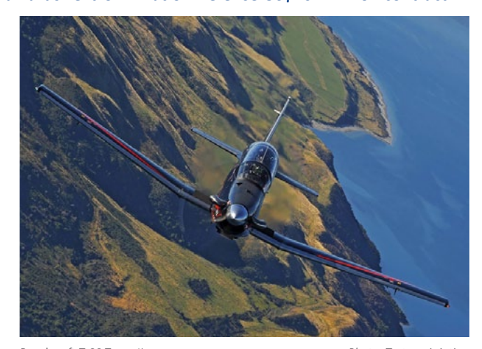
Beechcraft T-6C Texan II

Textron Aviation Defense announced US$162 million contract with the Royal Thai Air Force for an Integrated Training System in support of operations at the Royal Thai Air Force Flying Training School at Kamphaeng Saen air base. The contract is for 12 Beechcraft T-6C Texan II advanced military aircraft. training ground-based training systems for pilots and