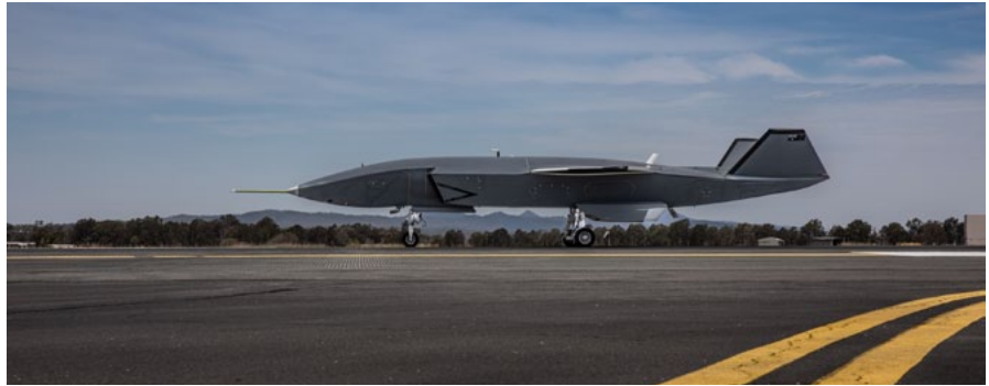
Boeing Australia has completed the low-speed taxi test on its first Loyalty Wingman unmanned aircraft

The Boeing Loyalty Wingman aircraft being developed with the Royal Australian Air Force (RAAF) recently moved under its own power for the first time, a key milestone for the aircraft that's expected to make its first flight this year. Reaching a maximum speed of 14 knots (approximately 16 mph, or 26 kph) on the ground, the aircraft demonstrated several activities while maneuvering and stopping on command. "The low-speed taxi enabled us to verify the function and integration of the aircraft systems, including steering, braking and engine controls, with the aircraft in motion," said Paul Ryder, Boeing Australia Flight Test manager. Three Loyalty Wingman prototypes will be the foundation for the Airpower Teaming System that Boeing will offer customers worldwide. The aircraft will fly alongside other platforms, using artificial intelligence for such teaming missions. It has advanced design and flight characteristics, including a modular nose section that's customizable for specific needs and a conventional take-off and landing approach suitable for many missions and runway types.