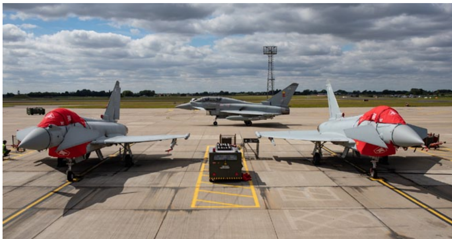
Air Covers has won a competitive bid to provide environmental protective covers for 147 RAF Typhoon aircraft

Air Covers, a leading specialist in the design of bespoke protective covers for the aerospace and marine sector, has won a competitive bid to provide environmental protective covers for 147 RAF Typhoon aircraft. Air Covers also won the supply contract for the Typhoon Display Team. Deliveries of the covers to RAF Coningsby have already started. A total of 50 complete sets have been dispatched to date, with a further 97 to follow. Each cupola cover is made at Air Covers' facility in Wrexham, North Wales. The Typhoon fleet will be protected with Air Covers' full convection cooling cover technology. The cupola covers are 30% lighter than the aircraft's incumbent covers, which were also creating a heat sink effect, raising cockpit temperatures above ambient levels. The new covers have been successfully trialed and tested with three air forces (with similar combat aircraft) in Italy, Afghanistan and Saudi Arabia.