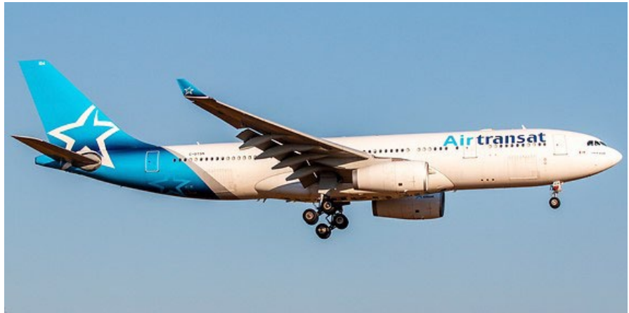
Air Transat Airbus A330