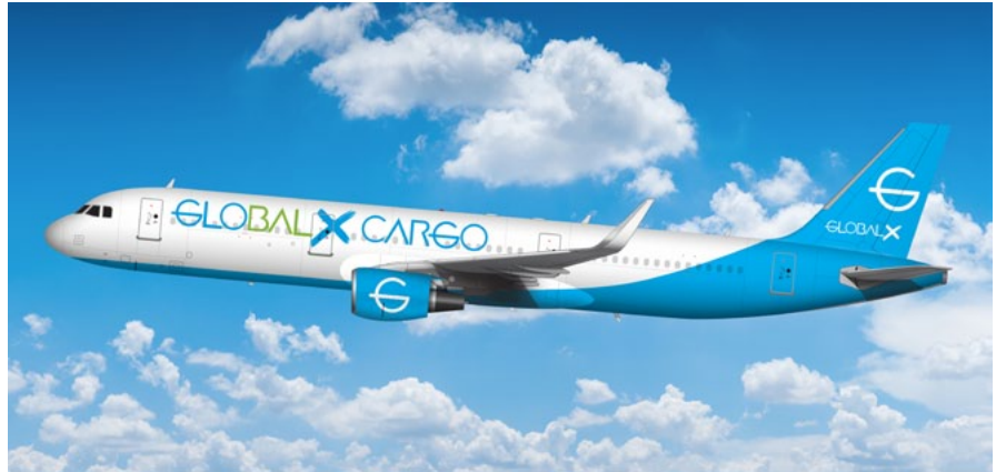
GlobalX cargo A321 mock up