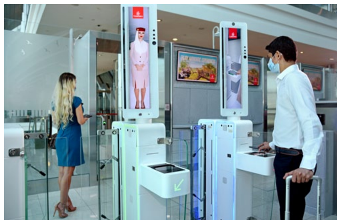
Utilising the latest biometric technology – a mix of facial and iris recognition

The biometric path is the latest in a host of initiatives by Emirates to provide a smart contactless journey. In the last month, the airline has introduced other services including self-check-in and bag drop kiosks at DXB for a smoother airport experience.