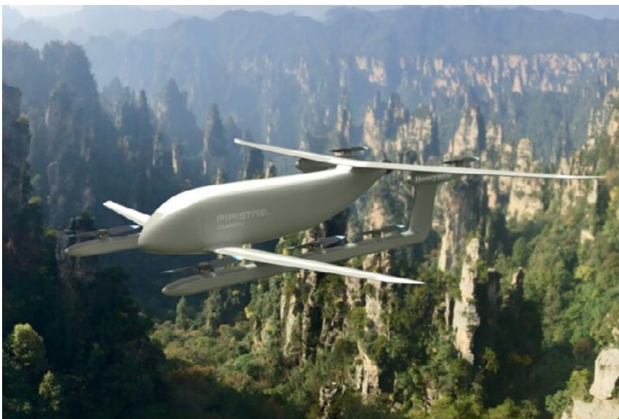
Pipistrel Nuuva V300