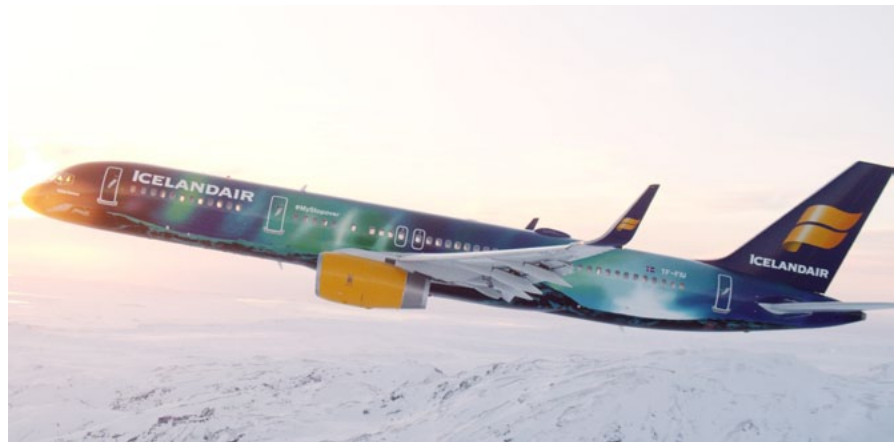
AvAir has partnered with Icelandair on a full asset management contract for all surplus materials