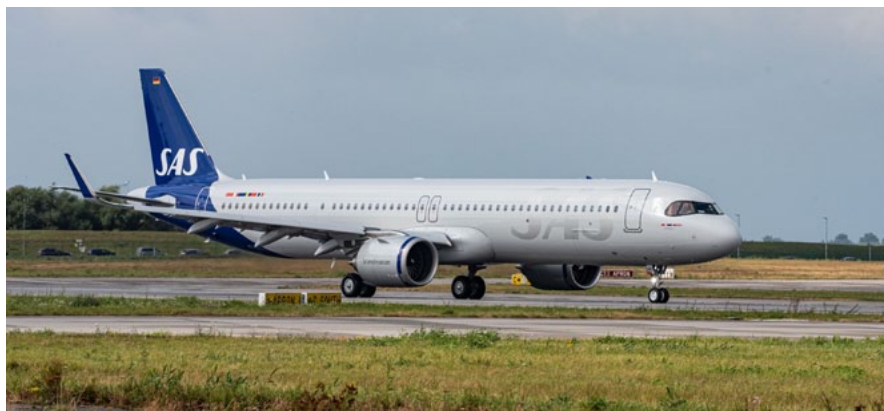
SAS takes delivery of first of three A321LR aircraft, on lease from ALC