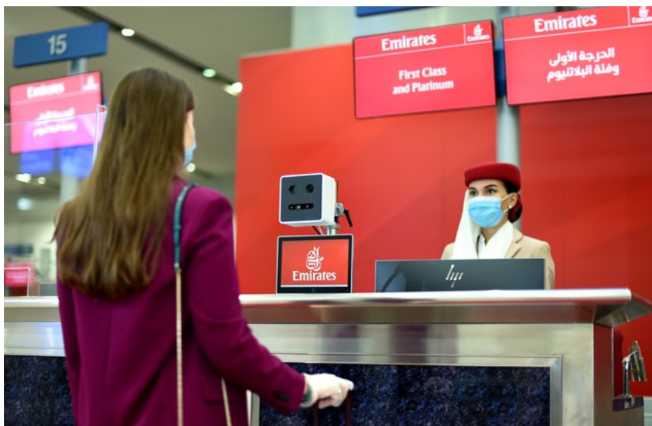
Emirates has launched an integrated biometric path at DBX.

Qatar Airways has announced it has taken delivery of three more Airbus A350-1000 aircraft, reaffirming its position as the largest operator of Airbus A350 aircraft with 52 in its fleet. All three A350-1000 are fitted with the airline's Business Class seat, Qsuite and will operate on strategic long-haul routes to Africa, the Americas, Asia-Pacific and Europe. Due to COVID-19's impact on travel demand, the fleet of Airbus A380s will remain grounded.