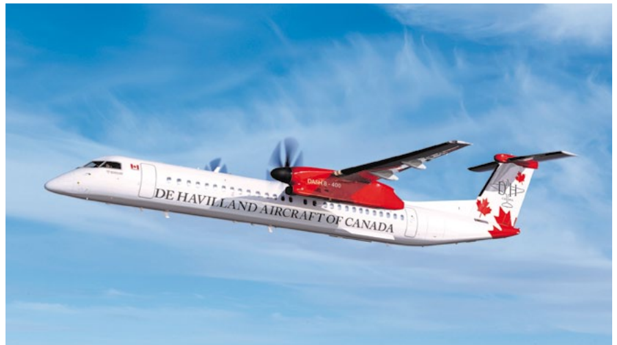
IFS Applications™ will be deployed in the cloud at De Havilland Canada's facilities in Toronto and will support operational processes

Magnetic MRO , a Total Technical Care and Asset Management organization, has signed an extended Managed IT and Cloud services agreement with BTT Cloud . BTT Cloud is a managed IT services provider that has been operating successfully for more than a decade. Since the global pandemic hit the world in early 2020, the digitalization and role of well-balanced IT processes have increased significantly, thus, according to Magnetic MRO's representatives, such collaboration was a natural step. BTT Cloud has been a partner to Magnetic MRO since 2014 with an overall 13 years' experience in IT business. However, before this expanded agreement, BTT Cloud has mainly supported Vilnius-based users and related IT infrastructures. Now BTT Cloud will provide full-scope managed IT services to all employees across the Baltics and will take care of the whole IT and cloud infrastructure that drives all business-critical workloads. With this strategic partnership, Magnetic MRO aims to work further on standardizing its IT infrastructure and IT services while applying best practices and new technologies. This will enable business growth and provide employees with high-quality, timely support which will allow Magnetic MRO teams to fully focus on their core activities and solutions that create more value to the business.