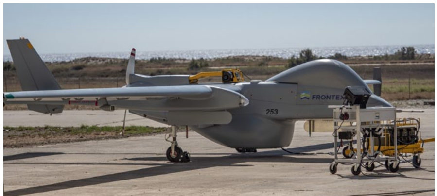
The maritime Heron RPAS from IAI