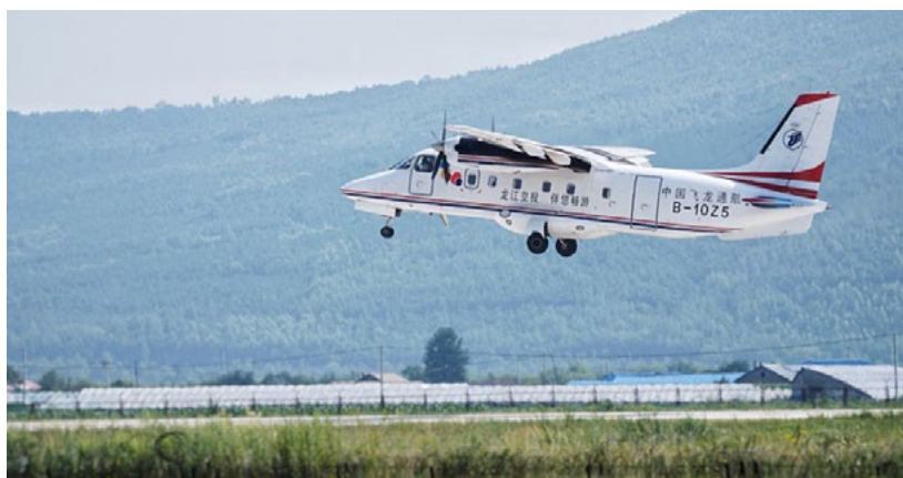
China Flying Dragon Y12 aircraft

Pratt & Whitney has presented China Flying Dragon GA with its official Designated Maintenance Facility (DMF) plaque and certification, officially inducting the aviation maintenance facility into the global Pratt & Whitney customer service network. Based in Harbin, the capital city of China's northernmost province, Heilongjiang, China Flying Dragon is now authorized to provide line maintenance and mobile repair technician services to operators of Pratt & Whitney's PT6A-27 and PT6A-135A engines. In addition to the maintenance services it provides to customers, China Flying Dragon has its own fleet of Y12 and King Air 350 aircraft, both of which are powered by PT6A engines. Using these aircraft, China Flying Dragon operates short-haul passenger and cargo charter flights as well as aerial photography, forest protection and other GA services.