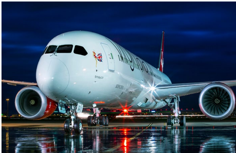
Financing transactions relate to two 787 aircraft.

The effects of the COVID-19 pandemic have seen Munich Airport record its lowest traffic figures since it opened in 1992. Due to global travel restrictions, the passenger volume in Munich fell by around 37 million to a little more than eleven million, nearly 77% lower than the previous year's figure. In the same period, the number of take-offs and landings dropped by more than 270,000 to around 147,000 – a fall of nearly 65%.