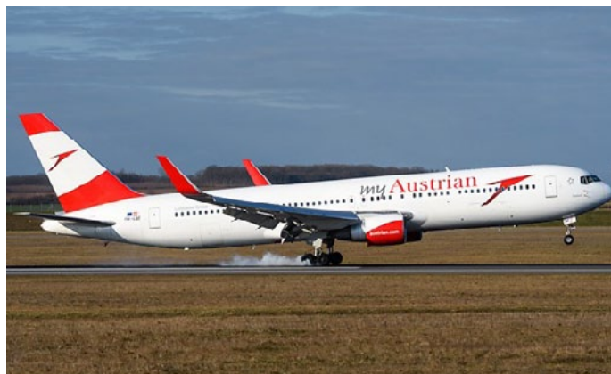
The Boeing 767, OE-LAT, was in service with Austrian for around 20 years

OE-LAT, the first of three Boeing 767-300ER aircraft, will leave the Austrian Airlines fleet in March. The long-haul jet was manufactured in 1991 and was in service with Austrian Airlines for around 20 years after the Lauda takeover in 2001. OE-LAT made its last passenger flight on January 10, 2021. Over the next few weeks, the aircraft will undergo all the necessary preparations for handover, with the transfer flight of the jet to the U.S.A. scheduled for early March. The two other B767s, OE-LAX and OE-LAW, are scheduled for phase-out by fall. Both long-haul aircraft will remain in service until then. With an average age of 28.5 years, the three B767s are among the oldest aircraft in the Austrian Airlines fleet. By the beginning of 2022, a total of 28 aircraft will have left the fleet of Austria's flag carrier: in addition to the three Boeing 767-300ERs mentioned above, 18 Dash turboprops and seven Airbus A319 jets will be phased out. Ten of the turboprops mentioned have already left the Austrian Airlines fleet, with the eight remaining to follow from the end of March. This means that the fleet will consist of around 60 aircraft by the beginning of 2022.