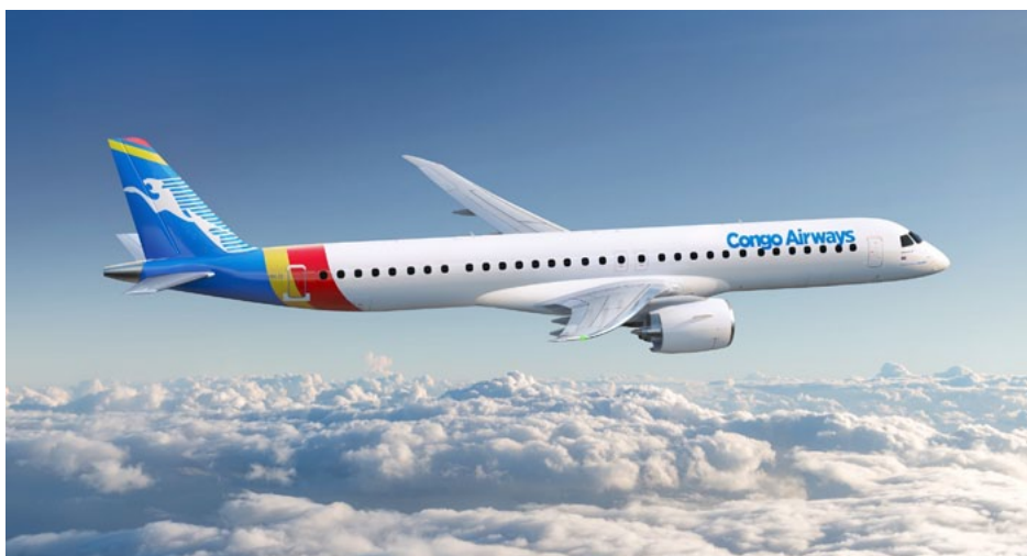
Congo Airways E195-E2

Just six months after its first E2 order, Congo Airways has placed a firm order for two E195-E2 jets. This is in addition to its existing two-aircraft order for the smaller E190-E2. The four-aircraft deal has a total value of US$272 million at current list prices. This new firm order will be included in Embraer's 2020 fourth-quarter backlog. The E195-E2 will be configured in a dual-class 120-seat layout, 12 in business, 108 in economy – an additional 25% capacity when compared to the 96-seat configuration chosen by Congo Airways for its E190-E2s. The E2 deliveries are expected to begin in 2022 with Embraer and Congo Airways continuing to review the potential to anticipate the beginning of the deliveries. There are currently 206 Embraer aircraft operating in Africa with 56 airlines in 29 countries.