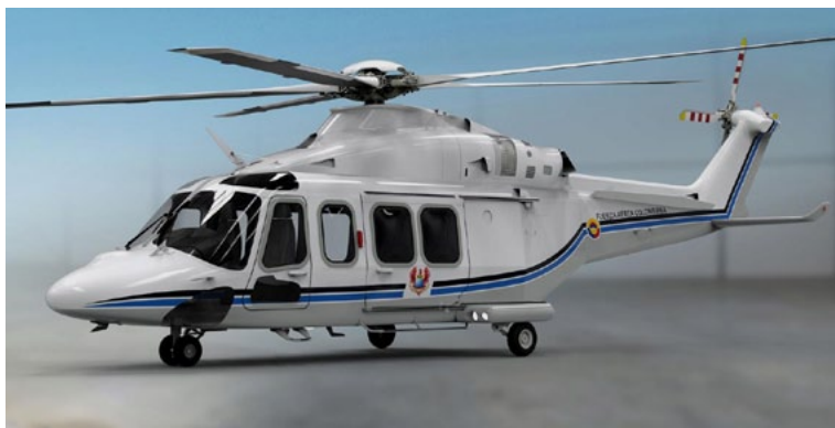
Columbia's new AW139 presidential helicopter

The Leonardo AW139 intermediate twin-engine helicopter will be the new presidential transport helicopter in the Republic of Colombia. The aircraft, in a special VVIP configuration, is expected to be delivered in spring this year and will be operated by the Colombian Air Force. The supply of this helicopter will make the Colombian Air Force the first military customer of the type in the country and will expand the existing AW139 fleet in Colombia. The model has already proven successful for civil transport operations supporting the oil & gas industry, with five units in service used by prime operator Helistar S.A.S. The Presidential AW139 will feature, among others, an eight-seat configuration in the largest cabin in its category, the highest safety standards, and include a self-defense suite, typically integrated into other helicopters in the Head of State/Government transport role.