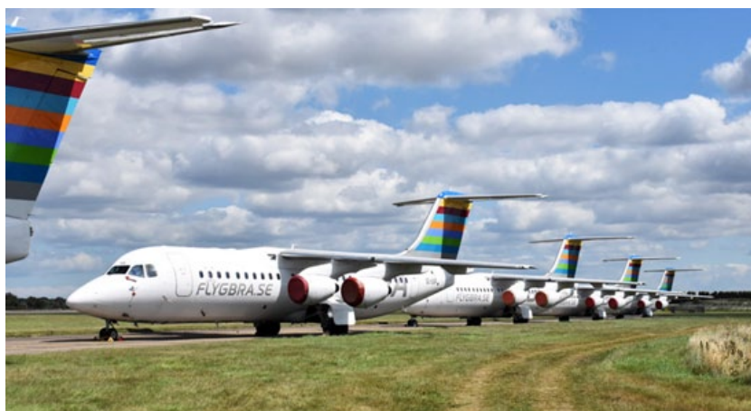
Photo: Skyworld Aviation kickstarted 2021 with the sale of two more Avro RJ100s on behalf of Braathens

Skyworld Aviation has kick-started 2021 with the sale of two further Avro RJ100s on behalf of Braathens, serial numbers E3244 and E3250. This follows the placement of two Avro RJ100s to CFS Aero at the end of 2020. Summit Air of Canada will take delivery of SE-DSR and SE-DSV in Norwich, U.K. during the next few weeks. This takes the total number of Avro's sold for Braathens to six, with other aircraft currently under offer. Summit Air has been delivering remote aviation solutions for over 20 years, with a diverse fleet comprised of ATR 72 Bulk Freighters, Avro RJs, Dash 8-100s, Twin Otters, Buffalos and Dornier 228s, primarily operating out of Yellowknife in Northern Canada. As well as providing scheduled services serving Northern Canada, charter and special purpose clients include government agencies, tour operators, and mining companies worldwide.