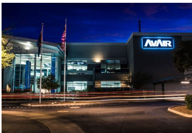
Photo: AvAir headquarters

support. With extensive component engineering, airline operating experience, and strong in-house repair capabilities, HAECO ITM offers customized, innovative and cost-effective component management solutions with guaranteed service level and high-quality component maintenance at competitive cost, ensuring customer fleet performance and technical dispatch reliability whilst providing cost visibility. With this transaction, AvAir will add over 2,000 rotatable components including IDG's, Starters and Avionics for Airbus A320. The entire stock will be added to AvAir's growing Dublin facility to support its A320 customers in the region.