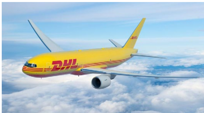
DHL Express orders additional eight Boeing 777 Freighters