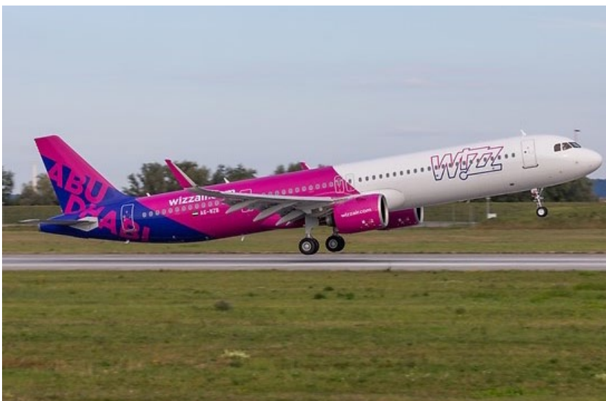
Wizz Air Abu Dhabi