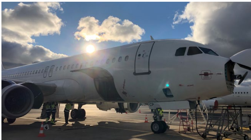
Photo: APOC Aviation acquires A320 airframe for part-out in Rothenburg, Germany

APOC Aviation is collaborating with Elbe Flugzeugwerke GmbH (EFW) and Switzerland-based Eco-FLY in the first part-out project to take place in Rothenburg (EDBR) airport in Germany. The A320 airframe (MSN 1823) was acquired by APOC from a leading US-based investment company and last operated by SmartLynx. EFW will undertake the part-out for APOC and, together with Eco-FLY, build best practice for fuselage disassembly to evaluate recycling concepts for aircraft on an industrial scale at the airport in Rothenburg to establish a blueprint for future programs. APOC's access to flexible and immediate funding, swiftly secured through private placement, facilitated this prime asset purchase. However, Jasper van den Boogaard, VP Aircraft Acquisition & Trading, says that stitching this complex deal together required commitment and great teamwork from all parties. "Despite the difficulties of travel, by staying airtight we were able to assemble the different strings that made closing agreements feasible in this highly challenging market. We're proud to engage EFW and acknowledge the investment and energy required to bring a sustainable industry to a region where there is a pool of talented technicians eager to embrace new skills."