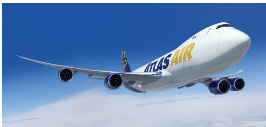
Atlas Air's order of four 747-8 freighters will complete Boeing's production of the 747-8 in 2022