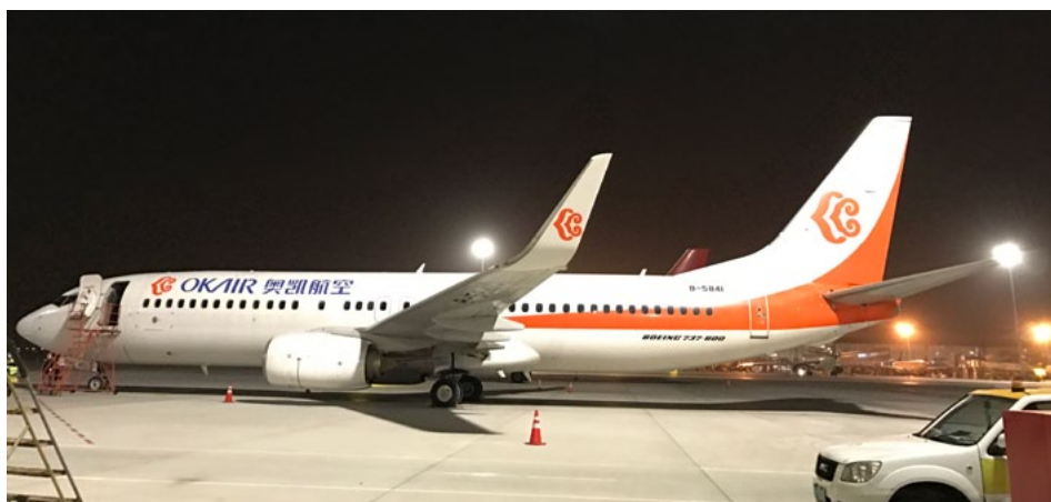
Vintage Boeing 737-800 aircraft