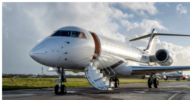
Photo: Planet 9 adds one Bombardier Global Express to its managed fleet

Planet 9, the Van Nuys, California-based private charter operator and aircraft management company, added a Bombardier Global Express BD-700 (N551SW) to its managed fleet at the end of December, the third aircraft to go onto its Part 135 Air Operator's Certificate since the pandemic took hold in March 2020. Two more aircraft – a Global Express and Dassault Falcon 7X – are currently being readied to join the managed fleet by the end of February. Both will be available for charter, boosting the Planet 9 family of owned and managed aircraft to 14. Planet 9, which has operations bases in Teterboro, New York, London, and Lisbon, has seen more clients turn to the safe cabin environment of its private aircraft to keep their families protected during the pandemic. Much of its flying over the recent holiday season has been to the Caribbean Islands, especially The Bahamas and Turks & Caicos – from both U.S. and European airports.