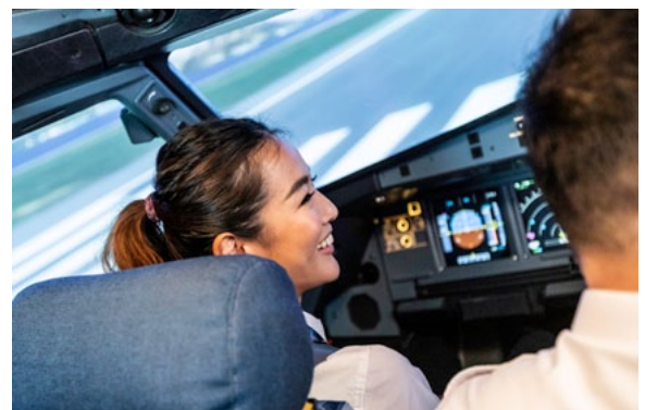
Training in a CAE full-flight simulator