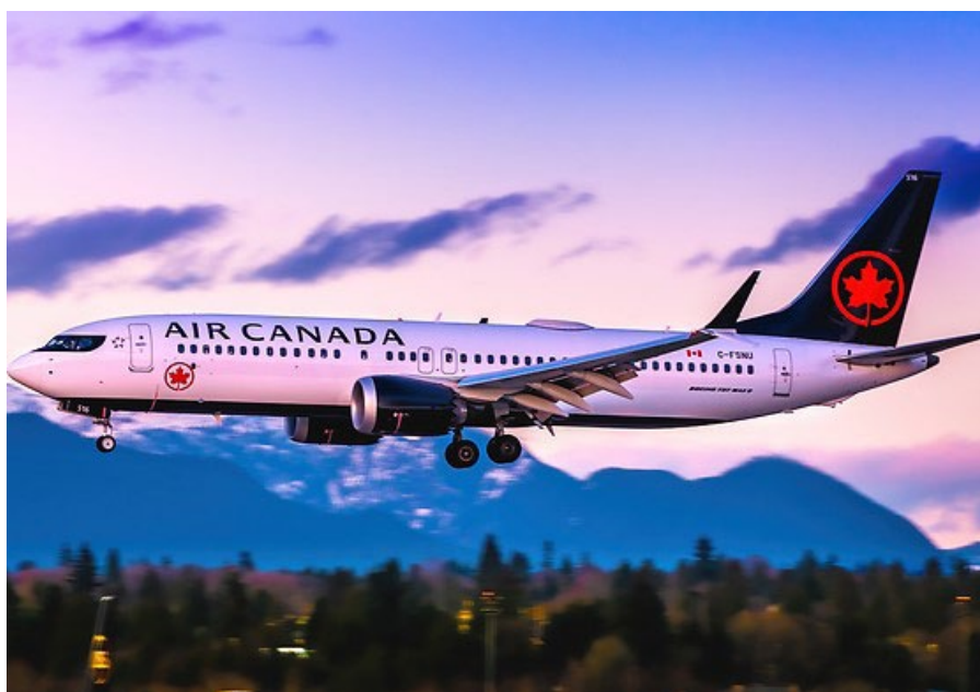
Air Canada Boeing 737-8 MAX