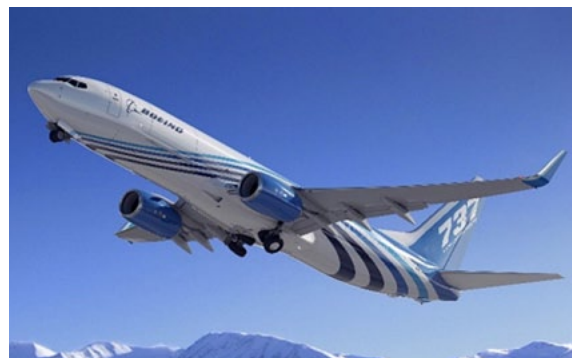
BBAM orders six firm 737-800 Boeing converted freighters and six options

Boeing and BBAM have announced that the lessor is expanding its 737-800 Boeing Converted Freighter fleet with six firm orders and six options. The agreement brings BBAM’s 737-800BCF orders and commitments to 15 and highlights the continued strength of the e-commerce and express cargo market. Based on the Next-Generation 737, the 737-800BCF is meeting customer demand for a newer-generation