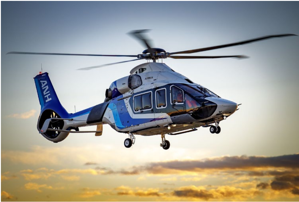
First flight of Nippon Helicopters H160 helicopter