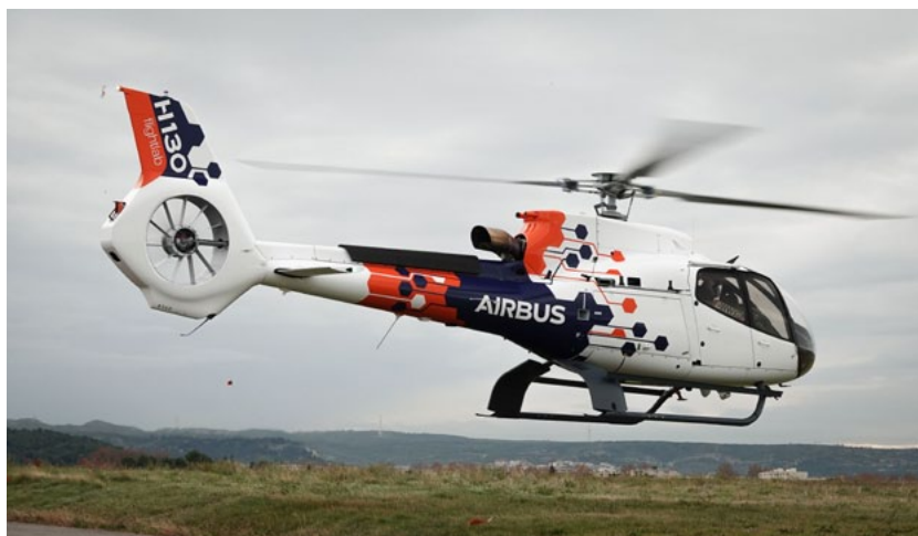
Airbus unveils its helicopter Flightlab, a platform-agnostic flying laboratory

Airbus Helicopters has started in-flight tests on board its Flightlab, a platform-agnostic flying laboratory exclusively dedicated to maturing new technologies. Airbus Helicopters' Flightlab provides an agile and efficient test bed to quickly test technologies that could later equip Airbus' current helicopter range, and even more disruptive ones for future fixed-wing aircraft or (e)VTOL platforms. Airbus Helicopters intends to pursue the testing of hybrid and electric propulsion technologies with its Flightlab demonstrator, as well as exploring autonomy, and other technologies aimed at reducing helicopter sound levels or improving maintenance and flight safety. Flight tests started last April when the demonstrator was used to measure helicopter sound levels in urban areas and to particularly study how buildings may affect people's perception. Tests this year will include an image-detection solution with cameras to enable low altitude navigation, the viability of a dedicated Health and Usage Monitoring System (HUMS) for light helicopters, and an Engine Back-up System, which will provide emergency electric power in the event of a turbine failure. Testing on the Flightlab will continue in 2022 in order to evaluate a new ergonomic design of intuitive pilot flight controls intended to further reduce pilot workload, which could be applicable to traditional helicopters as well as other VTOL formulae, such as UAM.