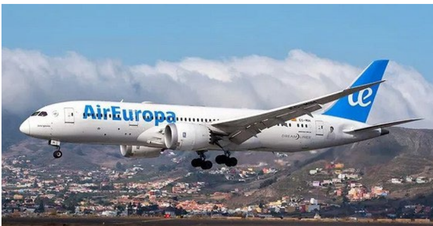
Mallorca-based Air Europa