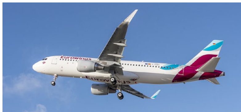
Photo: Eurowings Airbus A320

Eurowings and the ver.di trade union for cabin staff at Eurowings Deutschland , have agreed on a crisis package. The agreement with social partners and the crisis contribution of the cabin staff of Eurowings Germany is a necessary step to be able to overcome the severe crisis and secure the future of the company in the long term. Currently, Eurowings is assuming an upturn in tourism demand from summer 2021, which should lead to full employment in the Eurowings Germany cabin again for the first time. Eurowings will therefore shortly launch an application process to fill around 130 cabin jobs. This is an internal Lufthansa Group call for applications, which can be used to offer a new perspective to employees from the Lufthansa Group who are affected by job cuts. The exact details are the subject of current negotiations with ver.di. Employees who already fly for Eurowings Germany will initially be offered increases in working hours and internal transfers in advance of the hiring. In view of the volatile situation, Eurowings reserves the right to adjust the ramp-up of flight operations up or down over the course of the year. The exceptional situation dictates that flight capacities be planned as closely as possible to demand. With rapid market adjustments last year, Eurowings demonstrated how dynamically the company can adapt to fundamentally new situations.