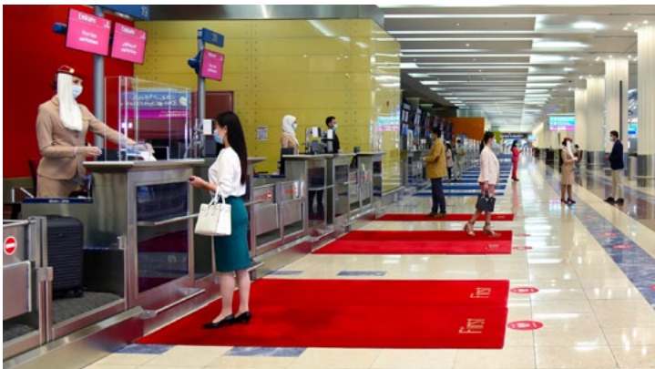
Photo: Emirates check-in desk

Emirates has partnered with the International Air Transport Association (IATA) to become one of the first airlines to trial the IATA Travel Pass – a mobile app to help passengers easily and securely manage their travel in line with any government requirements for COVID-19 testing or vaccine information. IATA Travel Pass enables Emirates passengers to create a 'digital passport' to verify that their pre-travel test or vaccination meets the requirements of the destination country. They will also be able to share the test and vaccination certificates with authorities and airlines to facilitate travel. The new app will also enable travelers to manage all travel documentation digitally and seamlessly throughout the travel experience. Prior to a full roll-out, Emirates will implement Phase 1 in Dubai for the validation of COVID-19 PCR tests before departure. In this initial phase, expected to begin in April, Emirates customers travelling from Dubai will be able to share their COVID-19 test status directly with the airline through