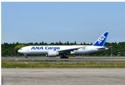
ANA opted to use the 777F for its maximum load capacity at roughly 100 tons