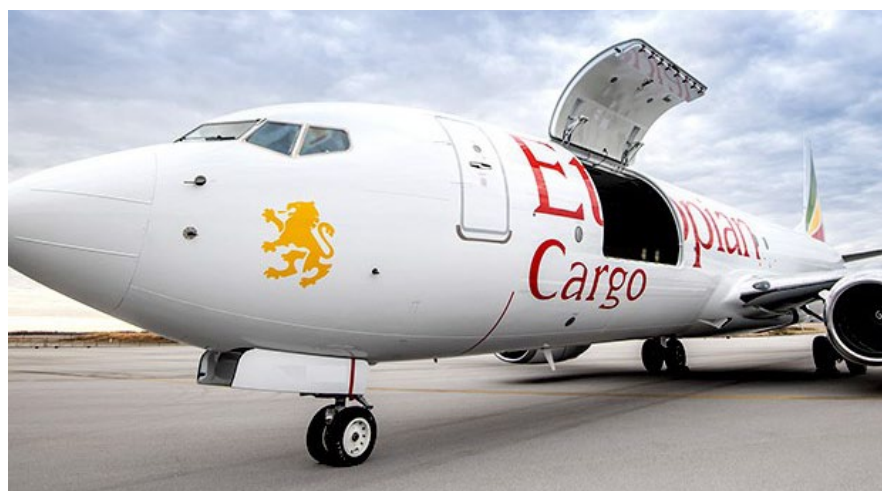
Ethiopian Airlines' first 737-800SF freighter conversion