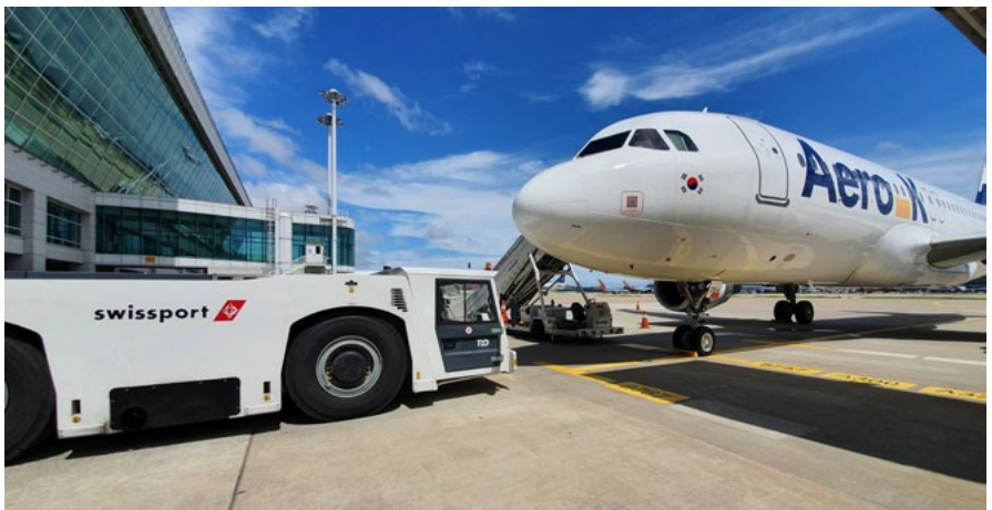
Photo: Swissport supports start-up Aero K in South Korea

Starting April 1, 2021, Swissport AIK , a joint venture between Swissport and Aero K Holdings , will provide airport ground services for Aero K , South Korea's newest low-cost carrier. From Cheongju International Airport (CJJ), Aero K will fly three-times daily with an Airbus A320 aircraft to Jeju International Airport (CJU), a popular island holiday destination off the southern coast of the Korean peninsula. Following a successful domestic launch, and once international travel regulations with regard to Covid-19 permit, Aero K intends to introduce international flights to destinations in China, Japan, Taiwan and Vietnam. Swissport in South Korea is providing airport ground services and air cargo handling for 27 airline customers with a workforce of some 850 qualified staff, among others, at South Korea's largest airport, Incheon International Airport.