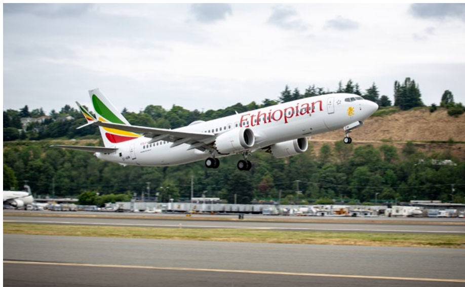
Cargo has moved onto some passenger aircraft.

SEKO Logistics has joined the Sustainable Air Freight Alliance (SAFA) to accelerate its global decarbonisation programme and help clients achieve their own sustainability goals. The Sustainable Air Freight Alliance (SAFA) is a buyer-supplier collaboration between shippers, freight forwarders and airlines to track and reduce carbon dioxide emissions from air freight and promote responsible freight transport.