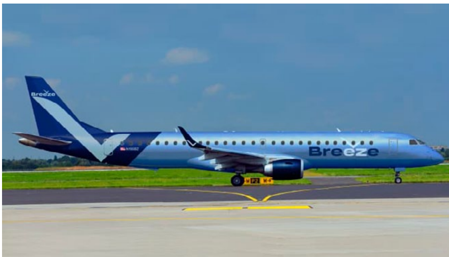
Start-up airline Breeze Airways will start operations with Embraer aircraft