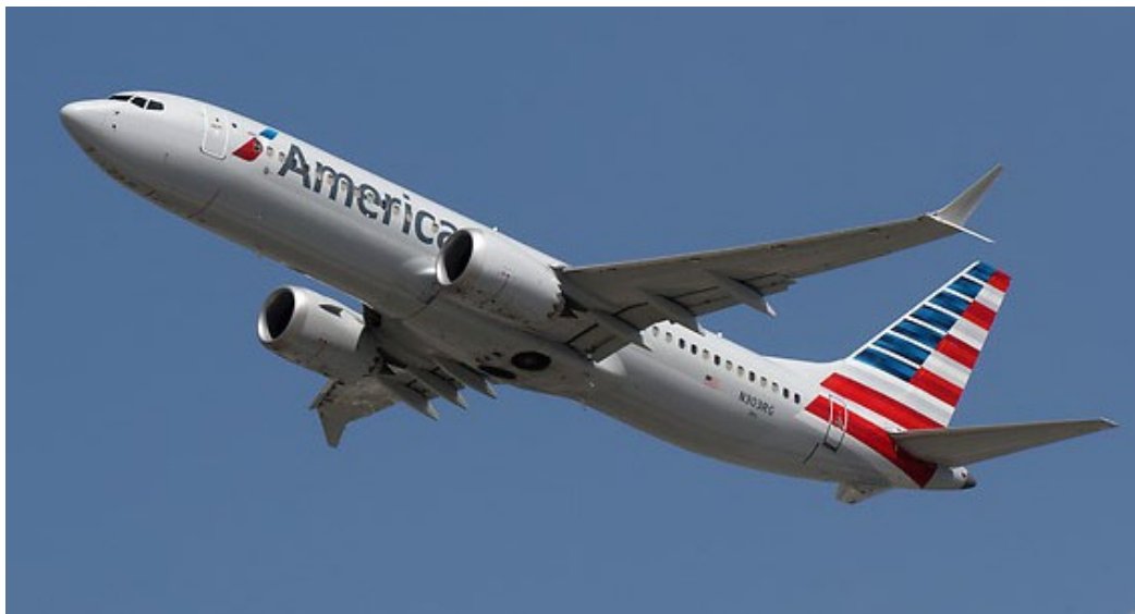
American Airlines Boeing 737 MAX