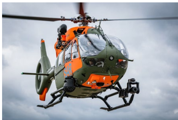
The German Armed Forces' SAR service took delivery of its seventh H145 helicopter

Airbus Helicopters has handed over the seventh and last H145 for the search and rescue (SAR) service of the Bundeswehr to the Federal Office of Bundeswehr Equipment, Information Technology and In-Service Support (BAAINBw) on time. The previously delivered helicopters are being used for training and field testing and are available 24/7 at the Niederstetten and Nörvenich air bases for rescue operations.