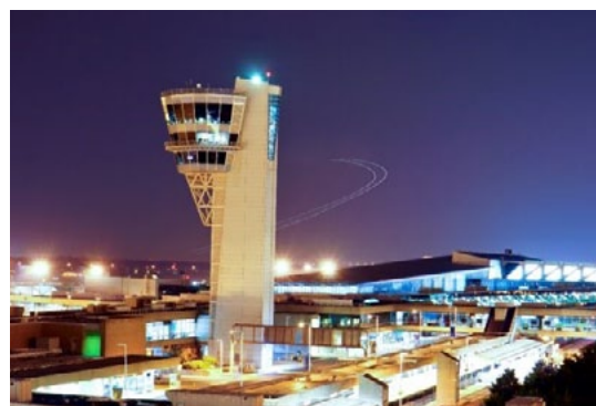
Air traffic control tower Cyprus