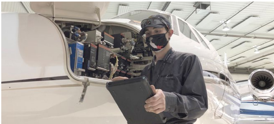
Photo: West Star Aviation implements Corridor Go via iPads to untether technicians and improve shop floor efficiency