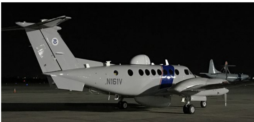
CBP Air and Marine Operations Multi-Role Enforcement Aircraft