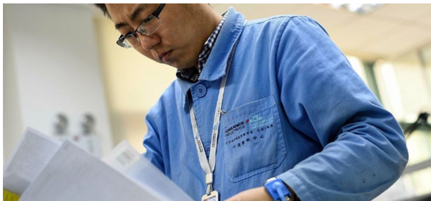
Photo: AFI KLM E&M Components China joins Liebherr's service network in China

Air France Industries KLM Engineering & Maintenance Components China and Liebherr-Aerospace & Transportation SAS and Liebherr (China) have signed a commercial agreement, which recognizes AFI KLM E&M Components China as the "Dedicated Partner & Repair Center" in charge of MRO services for the electronic controllers on board Airbus A320 and A330 programs. The controllers have been designed and manufactured by Liebherr. Under this agreement, AFI KLM E&M Components China joins Liebherr's service network in China to provide test, repair and overhaul the relevant Liebherr products, including during the OEM warranty period. Now the two parties can offer tailored solutions and reliable local repair services on Liebherr products for Airbus operators in China.