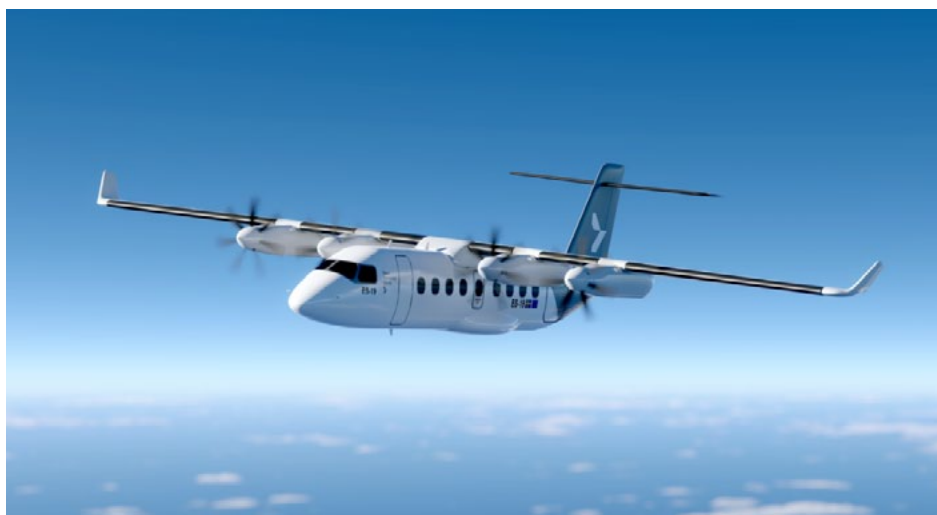
Photo: Heart Aerospace's Electric ES-19 aircraft