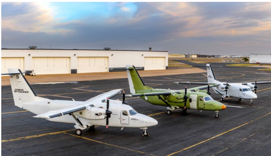
Cessna SkyCourier fleet