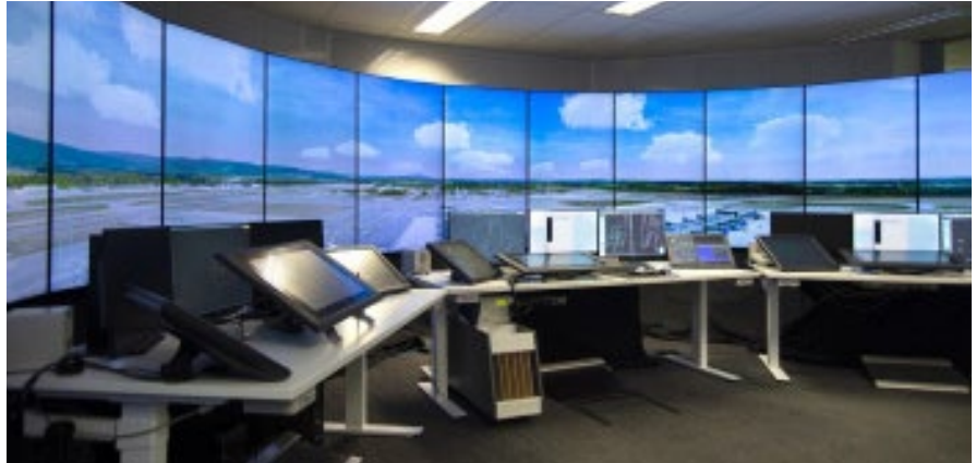
Avinor tower simulator site

United Airlines is kicking off summer vacation season with a robust May schedule that includes the addition of 26 new nonstop routes between Midwest cities such as Cleveland, Cincinnati and Milwaukee and popular vacation destinations such as Hilton Head, S.C.; Pensacola, Fla.; and Portland, Maine. The airline also plans to resume more than 20 domestic routes and will start a new service between Orange County, Calif., and Honolulu. Internationally, in May United will fly more than 100% of its pre-pandemic schedule to Latin America compared to what it operated in 2019, including more flights to Mexico, the Caribbean, Central America, and South America. The airline also plans to resume flights between Chicago and Tokyo Haneda, resume passenger flights between New York/Newark and Milan and Rome, and restart