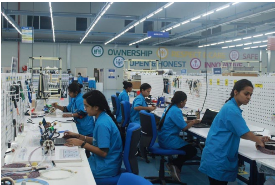
Pune wiring facility