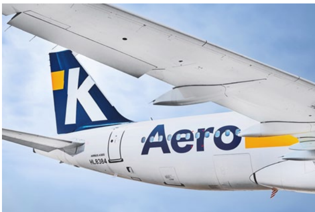
Aero K Airbus A320