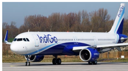
GECAS has arranged purchase/leaseback agreements with IndiGo for 14 Airbus Neos