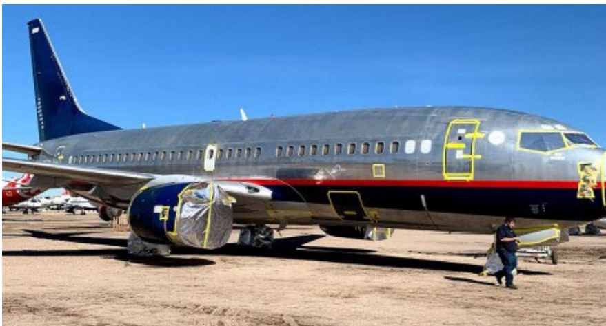
One of Aventure's former Aeromexico Boeing 737NGs, awaiting teardown