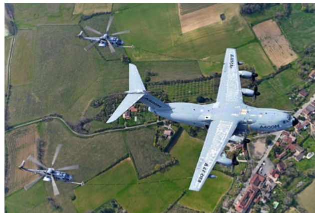
The A400M performs simultaneous refueling operations of two French Air Force H225M helicopter

The Airbus A400M new generation airlifter has successfully conducted a major helicopter air-to-air refueling certification campaign, completing the majority of its development and certification objectives. Airbus Defence and Space aims to achieve full helicopter air-to-air refueling certification later this year with the conclusion of all mandatory night operation tests. The flight tests, performed