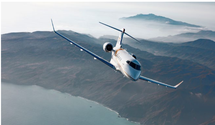
FAA and EASA have approved Viasat's Ka-band In-Flight Connectivity System for Bombardier Challenger 300-series aircraft

Bombardier and global communications company Viasat have announced regulatory approval for the installation and use of Viasat's Ka-band in-flight connectivity (IFC) business aviation system on in-service Challenger 300 and Challenger 350 aircraft, for their fastest available download speeds in the super-midsize segment. Supplemental Type Certificates (STC) have been successfully received from the U.S. Federal Aviation Administration (FAA), as well as from the European Union Aviation Safety Agency (EASA). Viasat first announced it would bring enhanced cabin connectivity to Bombardier Challenger 300 and Challenger 350 business jets in July 2020. Regulatory approval clears the way for operators of those aircraft to have Viasat's Ka-band Global Aero Terminal 5510 installed for a premier in-cabin internet experience over the most heavily travelled flight routes and regions. Installation of the Viasat system will be available at Bombardier's worldwide network of service centers.