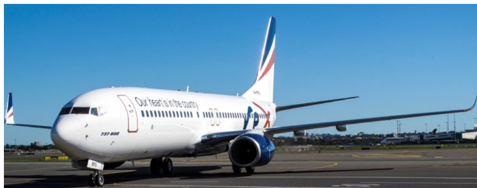
Rex's fleet continues to grow with delivery of the sixth Boeing 737-800NG

Australia's Rex Airlines has taken delivery of another Boeing 737-800NG, the sixth to join the airline's growing fleet of jet aircraft. The 737, with the registration VH-RYU, touched down in Sydney after emerging from the lessor's paint facility adorned in the distinctive Rex livery. It will soon enter service on the airline's domestic network which now spans Melbourne, Sydney, Adelaide, Gold Coast, and Canberra. Rex expects to take delivery of two more aircraft in July and hopes to grow its fleet of Boeing 737-800 NGs by the end of the year.