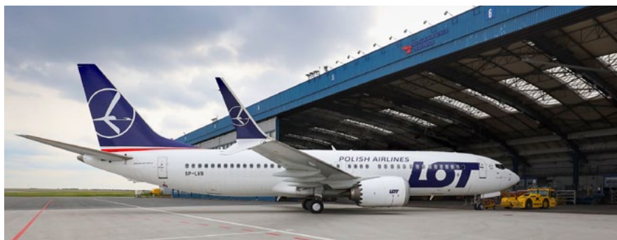
LOT B737 MAX aircraft at Prague Airport