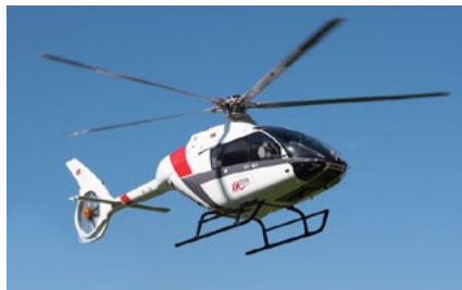
The SH09 from Kopter has been rebranded the AW09

One year after completing the acquisition of the Swiss company Kopter Group (Kopter), Leonardo has welcomed the SH09 single-engine helicopter as a full member of its product range by rebranding it as the AW09. This step synergizes the two identities of Leonardo and Kopter. The AW09 perfectly complements the existing product range of Leonardo, allowing the company to increase its share in the strategic single-engine market, which is one of the largest and most dynamic segments worldwide. Furthermore, the AW09 brings next-generation performance and demonstrates Leonardo's innovation leadership within the industry as the helicopter features the latest safety standards and most advanced technologies and this will pave the path for further advancements in vertical flight. The AW09 will continue to be developed by Kopter in Switzerland. The program progresses further with the contribution of joint Leonardo-Kopter teams. The third prototype (P3) has now logged in excess of 40 flight hours in Switzerland since mid-January in its new configuration. This includes enhancements in the main rotor head, gearbox, an extended rotor mast, and a new design of the flight controls, combined with the modern Garmin G3000H cockpit. The AW09 next prototype, PS4, is expected to fly this year, followed by the PS5.