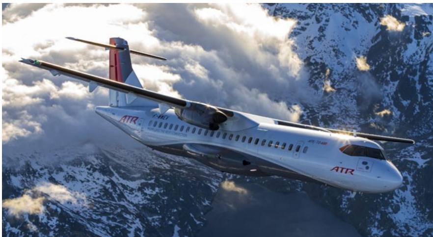
ATR 72-600 aircraft