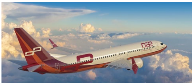
DAE has placed an order for 15 Boeing 737 MAX jets