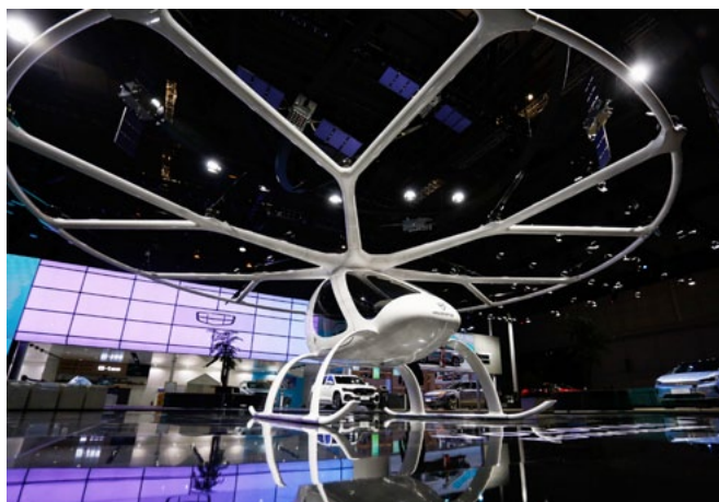
Volocopter's electric air taxi at the Shanghai International Automobile Industry Exhibition