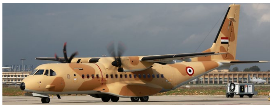
Egyptian Air Force C295 aircraft