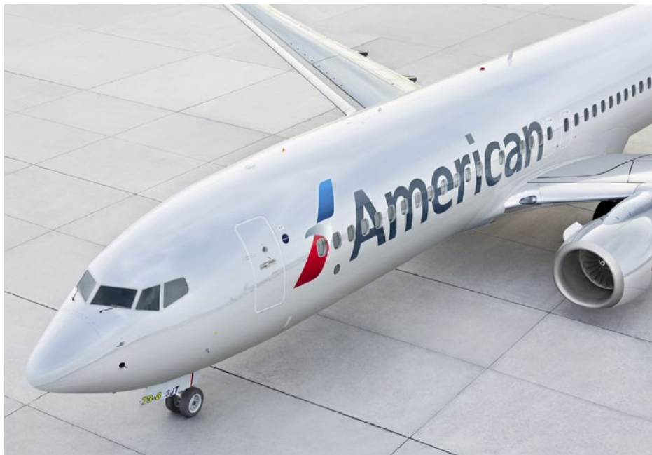
American reached agreements to defer some aircraft.

Kenya Airways (KQ) has signed an MoU with Congo Airways to collaborate, strengthen, and bolster aviation ties between Kenya and the Democratic Republic of Congo (DRC). KQ highlighted the importance of the strategic cooperation between the two national carriers and their role in enhancing trade exchange between the two countries and the importance of collaboration on expertise that benefit the aviation sector, especially as the aviation sector recovers from the devastating impact of COVID-19.