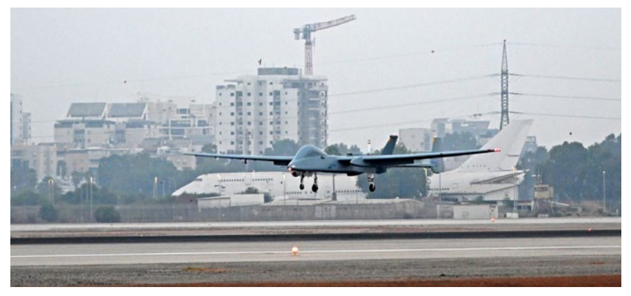
Heron unmanned aerial vehicle (UAV)