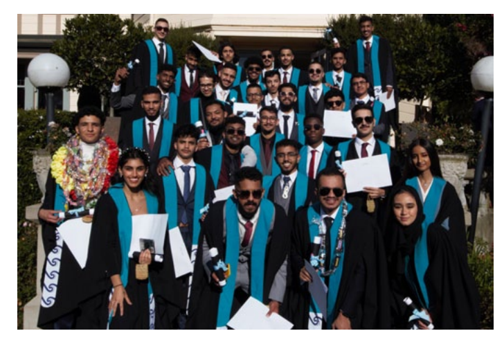
Graduation of the eighth cohort of GACA students from the Kingdom of Saudi Arabia

The eighth cohort of General Authority of Civil Aviation (GACA) students from the Kingdom of Saudi Arabia has graduated from air traffic control (ATC) training with Airways International (Airways), 11 years after the first group to arrive in New Zealand completed their training. GACA and Airways celebrated this milestone on Thursday June 3, as 34 students attended their graduation ceremony in Palmerston North following two years of study in New Zealand. Almost 200 students from Saudi Arabia have completed ATC training with Airways since the first cohort landed in New Zealand in 2009. The graduates included four female students - the first Saudi Arabian females to train as air traffic controllers outside their own country. Saudi Air Navigation Services (SANS) will employ the graduates on their return to Saudi Arabia and are prioritizing hiring women in the ATC profession, with the aim to extend female employment and empowerment. The organization is offering theoretical and practical ATC training to 80 women per year to prepare them for work in the ATC sector - the first cohort of female ATCs started work in Jeddah in March 2019.