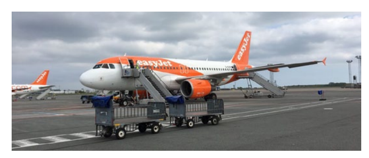
Copenhagen Flights Services renews partnership with easyJet for five more years

technology, with another nine major airports around the world already enjoying its benefits. SmartPath transmits digital data to the aircraft to aid in precision navigation and create more direct flight paths to and from airports. It can reduce flight times by optimizing the distance required to execute the approach and thus reduces the amount of fuel and emissions required to fly. In addition, because of the ability to have multiple precision approach paths with customizable glidepaths and accurate and repeatable flight tracks, it can reduce noise for residents along the approaches to SFO airport. It also reduces operating costs for airport operators, airlines, and air navigation service providers. Because one GBAS station covers all runways at an airport, it allows pilots to make more efficient approaches and landings.