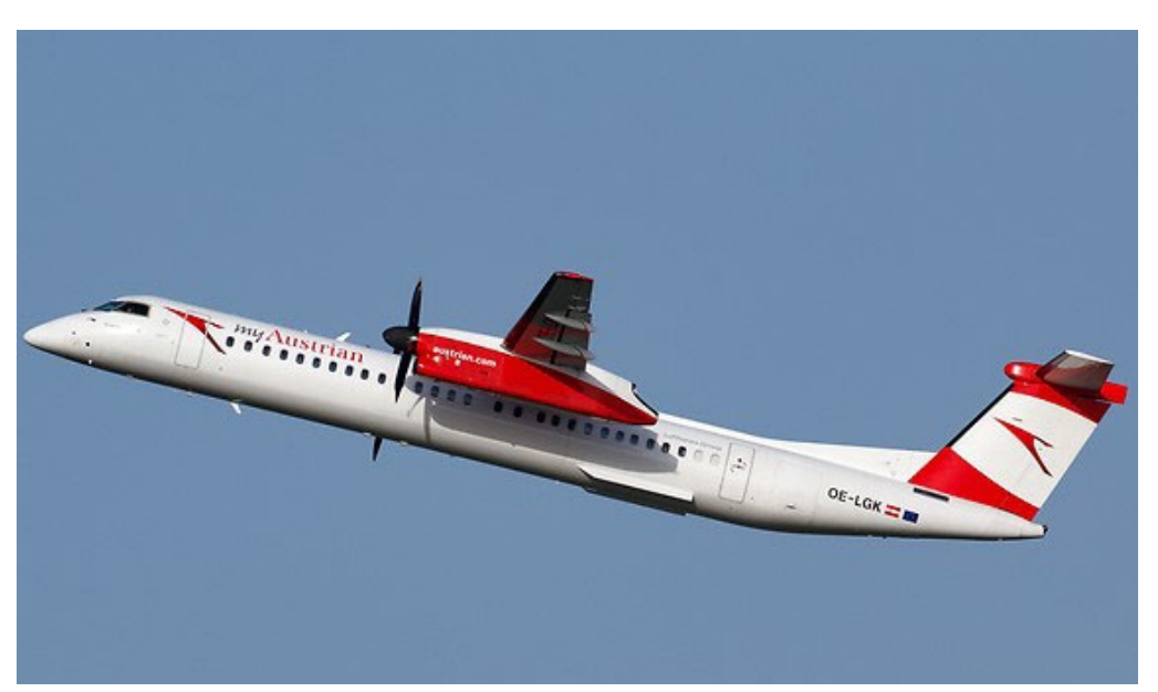
Austrian Airlines said goodbye to the last Dash-8 Q400 aircraft

On Monday May 31 Austrian Airlines flew its last turboprop passenger flight with a Dash 8-Q400 travelling from Innsbruck to Vienna and back. From here on, Austrian Airlines fleet of aircraft will comprise only Airbus, Boeing, and Embraer jets. The relationship with Dash-related aircraft began in 1985 when Tyrolean Airways to be acquired by Austrian Airways in 1998 - took delivery of its first Dash 8-100, having flown its predecessor, the 50-seat De Havilland Canada DHC-7, from 1980. The Dash aircraft proved particularly popular on tricky shortlanding runways, such as those at Innsbruck and Courchevel, and at the time of Tyrolean Airways takeover by Austrian Airlines, it was operating a combined fleet of 44 Dash 8-100s, -300s, and -400s.