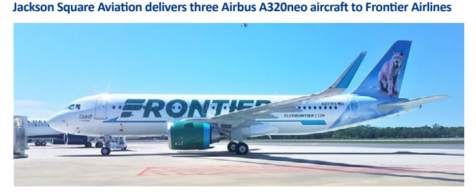
Photo: Jackson Square Aviation has completed the delivery of three Airbus A320neo aircraft to Frontier Airlines