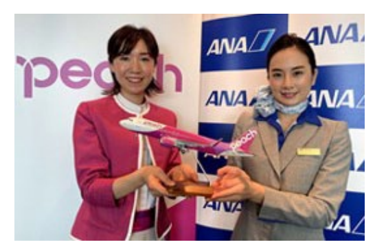
Photo: ANA and Peach Aviation will start offering codeshare in August

Pratt & Whitney has signed an agreement with Teledyne Controls, a data delivery solutions provider that uses innovative technology to collect, manage, and deliver aircraft data to more than 300 global airlines. This collaboration will enhance engine health management services offered to Pratt & Whitney powered aircraft, focused on Teledyne Control's global customers. Teledyne Control's data delivery solutions will expand the channels of customer data access for Pratt & Whitney and enhance the services offered through EngineWise® solutions. As the OEM, Pratt & Whitney is committed to driving maximum engine reliability and performance