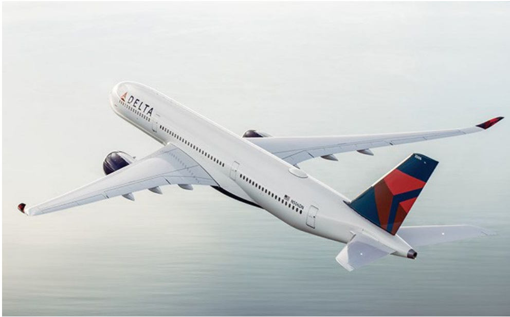
Delta Air Lines signs lease agreements for seven A350 aircraft with AerCap