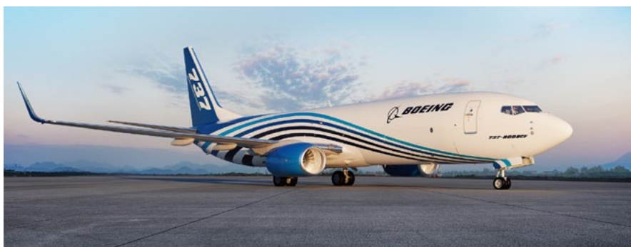
Boeing and BBAM signed an agreement for 12 additional firm orders for the 737-800BCF