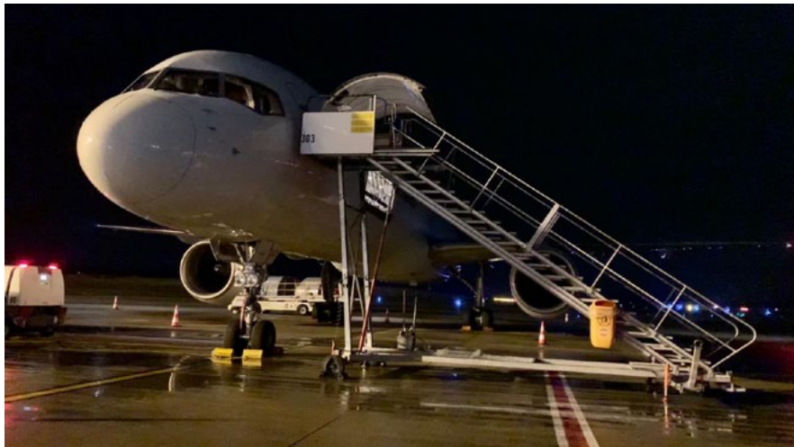
Photo: Direct Maintenance has opened a new line maintenance station in Germany at Cologne Bonn Airport

Direct Maintenance, a certified line maintenance service provider, part of Magnetic MRO, has opened its latest line maintenance station at Cologne-Bonn Airport (CGN), Germany. The new station began operations on July 1. The newly opened line-maintenance station, which is the fourth Direct Maintenance station in Germany alongside stations in Dusseldorf (DUS), Berlin (BER) and Hamburg (HAM) Airport, will cover line maintenance services for B747s, B757s, B767s and MD-11 type aircraft, including bespoke home-base line maintenance concepts in support of a logistic turnkey fleet operation. In the coming period Direct Maintenance will also provide line maintenance for a wide range of Airbus (A320/A330/A350/A380), Boeing (B737/B787) and Embraer (Embraer 170/190) aircraft types at CGN.