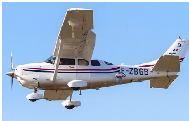
Cessna 206 aircraft

Southeast Aerospace, a leading Aerospace solutions company, has received the Federal Aviation Administration (FAA) Supplemental Type Certificate (STC), number SA01055DE, for the installation of its sensor mount in the Cessna 206 aircraft. Designed by Southeast Aerospace for the Cessna 206 aircraft, the sensor mount simplifies