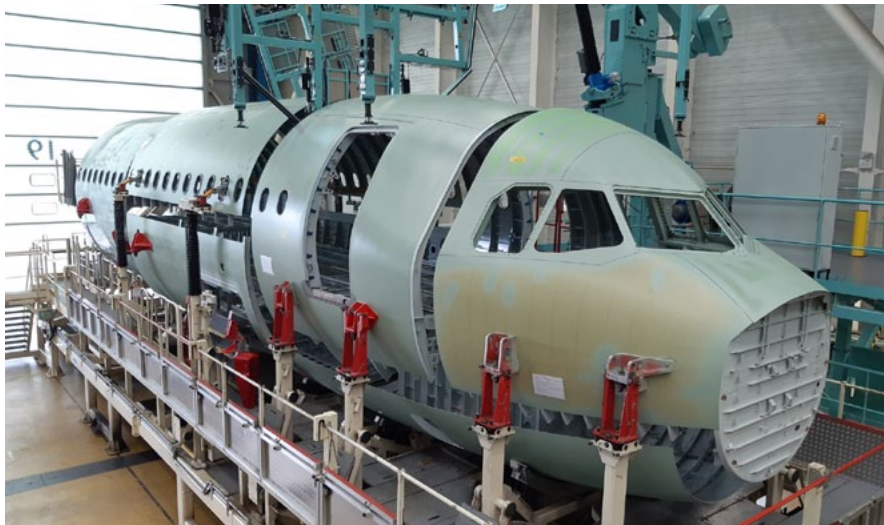
The nose and front fuselage assembly for the first A321XLR has started in France