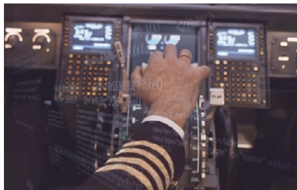
Photo: SITA has acquired Paris-based start-up Safety Line

SITA, the global IT provider for the air transport industry, has announced the acquisition of Safety Line S.A.S., the Paris-based start-up specializing in digital solutions for aviation safety and efficiency. This acquisition will strengthen SITA's Digital Day of Operations portfolio, helping airlines drive more efficiencies and fuel savings around the aircraft while taking immediate and sustainable steps to reduce their carbon footprint. With air transport accounting for about 3% of the worldwide carbon emissions, there is growing pressure on airlines to reduce their overall emissions. At the same time, the COVID-19 pandemic requires airlines to make their aircraft operations leaner, in particular reducing costly fuel burn. Safety Line has successfully applied predictive analytics to deliver significant improvements to aircraft operations, strongly complementing SITA's existing portfolio. With this acquisition, SITA will accelerate the development of sustainable solutions that can be integrated with its existing suite of airline and airport solutions.