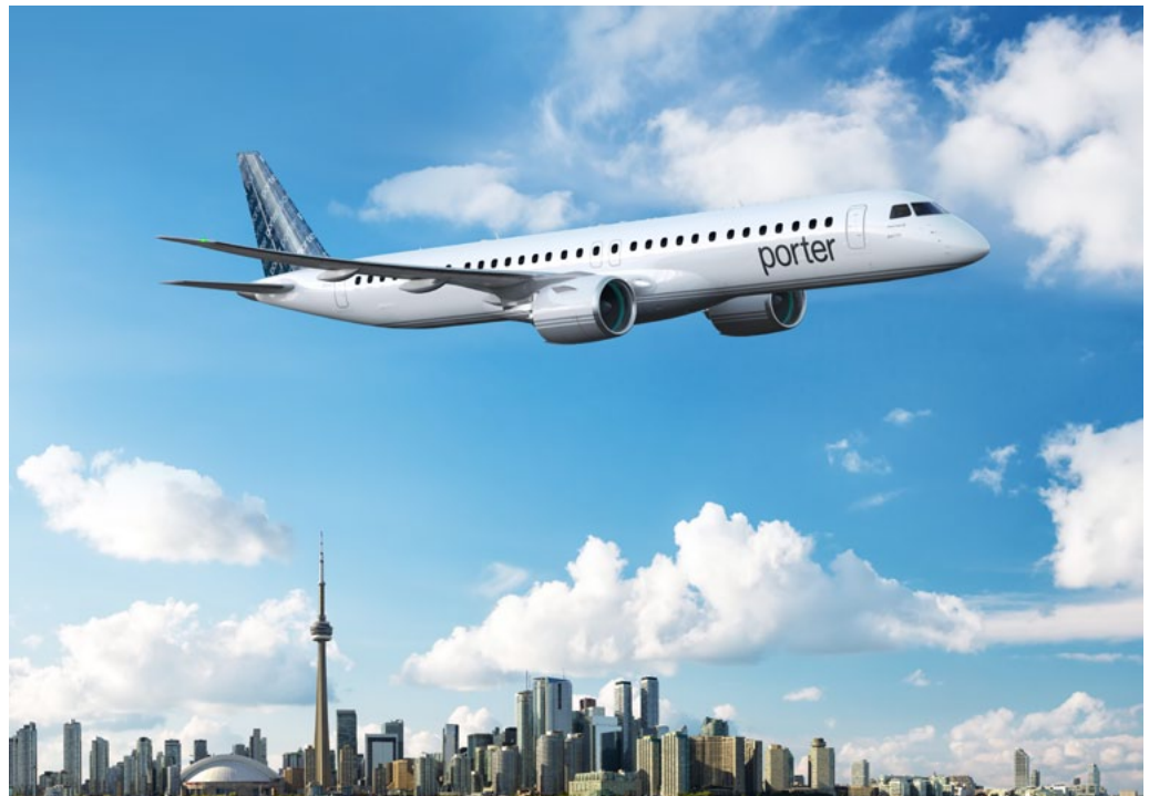
Canadian carrier Porter Airlines has placed a firm order for 30 E195-E2 jets

In a bid to disrupt the Canadian aviation landscape, Canadian carrier Porter Airlines has placed a firm order for 30 E195-E2 jets from Brazilian planemaker Embraer. In addition, the carrier has taken an option for a further 50 aircraft. With all options exercised, the deal is valued at US$5.82 billion at list price and Porter Airlines will be the North America launch customer for the new E195-E2 jet. Currently, Porter Airlines operates an all-turboprop fleet of 29 Bombardier Q400s (also known as the De Havilland Canada DHC-8 or Dash 8), headquartered in Billy Bishop Toronto City Airport and commenced operations in 2006. The regional carrier serves 23 destinations through regularly scheduled flights between Toronto and locations in Canada and the United States, though this will change dramatically with the acquisition of the E195-E2 jets. With delivery due to commence in the latter half of 2022, Porter