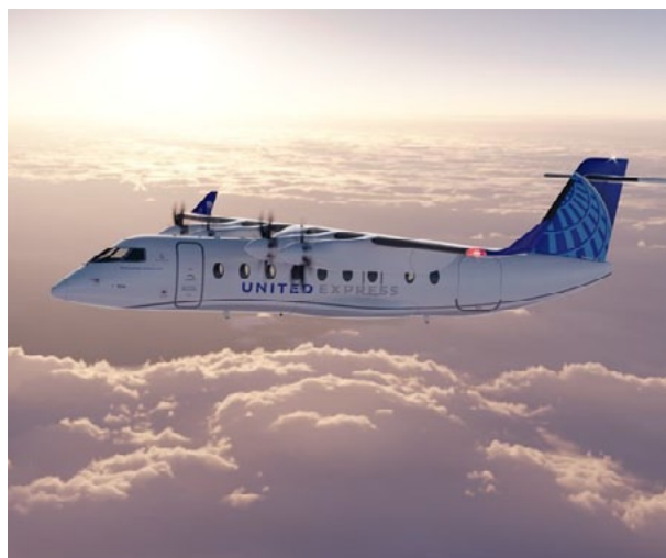
Photo: United Airlines together with Mesa Airlines have ordered 200 ES-19 aircraft from Heart Aerospace

United Airlines Ventures (UAV), along with Breakthrough Energy Ventures (BEV) and Mesa Airlines, have invested in electric aircraft start-up Heart Aerospace. Heart Aerospace, located at S ve Airport in Gothenburg, Sweden, is developing the ES-19, a 19-seat electric aircraft that, before the end of this decade, has the potential to fly customers up to 250 miles. In addition to UAV's investment, United Airlines has conditionally agreed to purchase 100 ES-19 aircraft once the aircraft meets United's