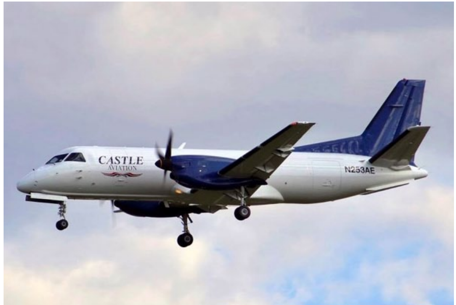
Castle Aviation is set to soar to new heights with WinAir