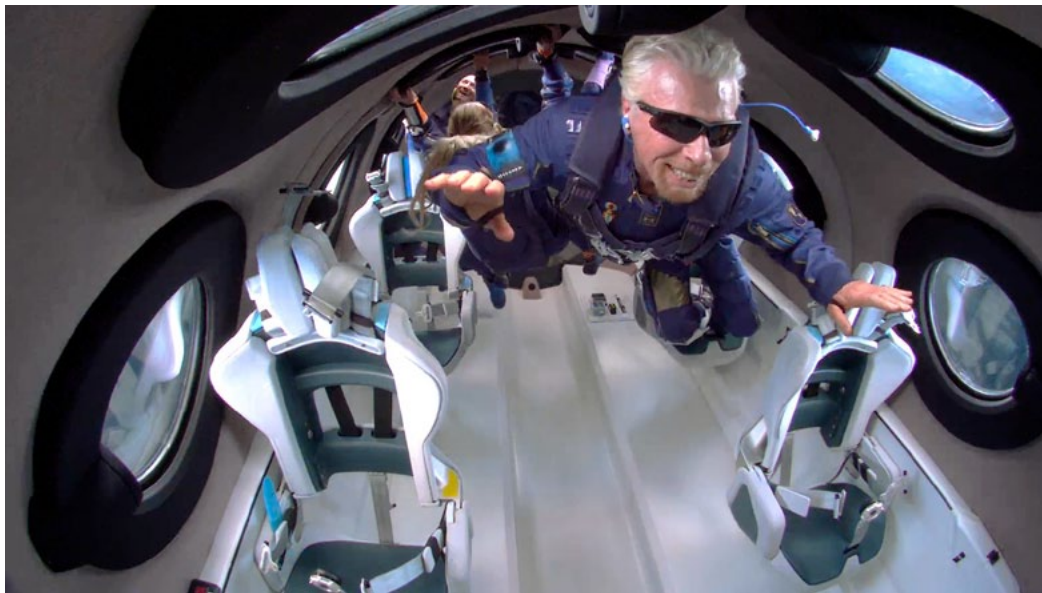
Sir Richard Branson experiencing weightlessness onboard SpaceShipTwo

Over recent years a sense of competitiveness has been building between three of the world's most successful entrepreneurs and the commercialization of sub-orbital space flight. While Elon Musk has already successfully commercialized his company SpaceX having launched multiple payloads into space, it was Jeff Bezos who, until this Sunday, was the front-runner for being the first of the three who would travel into space with his company Blue Origin. However, at 8.30 a.m. MT on Sunday July 11, Sir Richard Branson took off from Spaceport in Truth or Consequences, New Mexico, onboard SpaceShipTwo with three Virgin Galactic employees