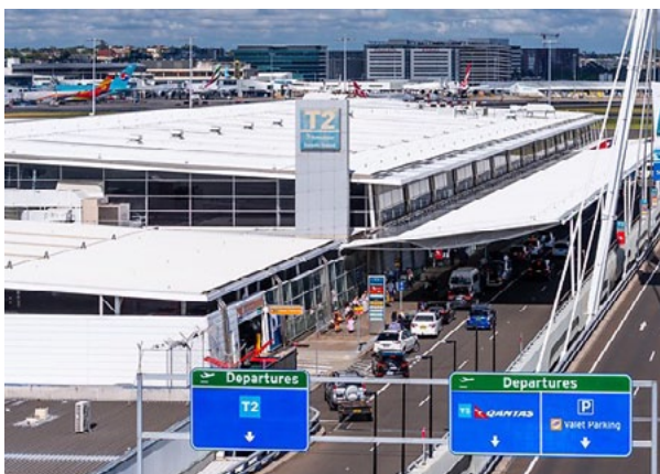
Sydney Kingsford Smith Airport, Terminal 2