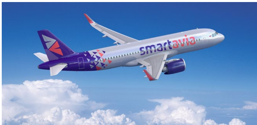
LHT will support Smartavia's latest fleet of Airbus A320neo aircraft