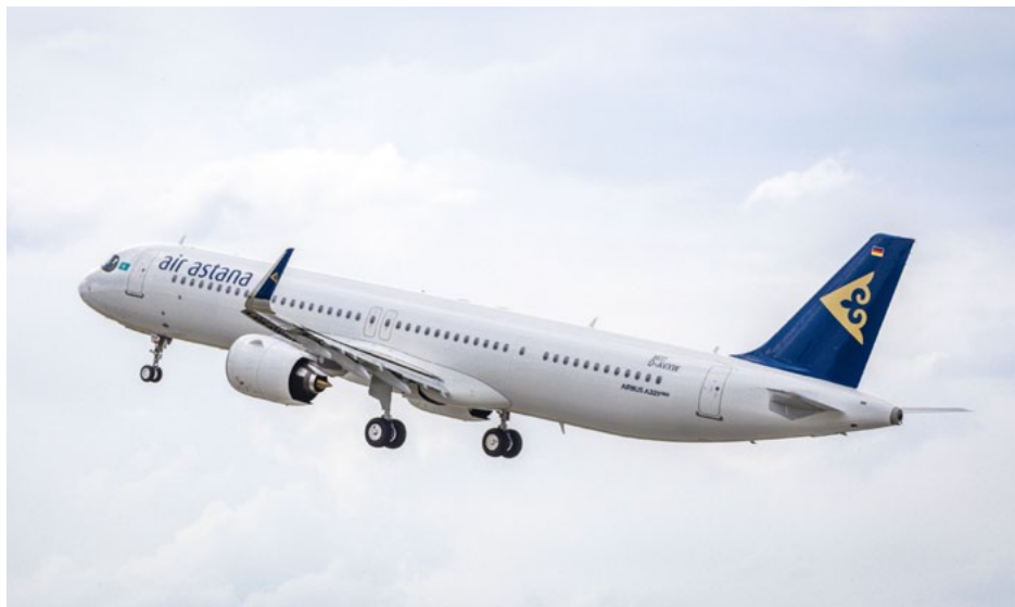
Air Astana Group has registered a half year net profit of US$4.9 million.

Qatar Airways Cargo announced the further roll out of third-party eBooking platform WebCargo by Freightos across the United States of America, effective 19 July 2021. Forwarders in the USA will be able to conduct eBookings with access to live rates and available capacity on the WebCargo platform. This will further improve their booking experience with the airline, resulting in higher efficiencies and instant responses for confirmation.