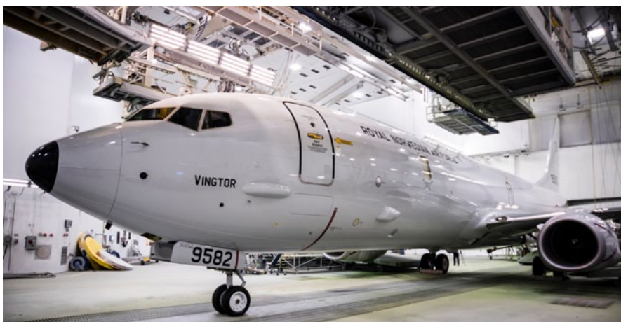
First Norwegian P-8 aircraft paint roll-out