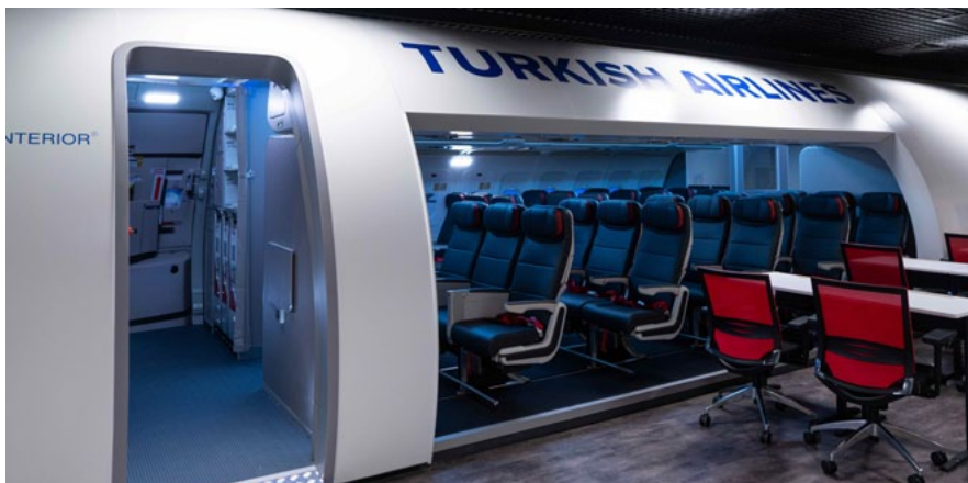
Cabin simulator for Turkish Airlines