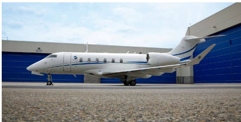
Sundt Air has added a third brand-new Challenger 350 to its fleet