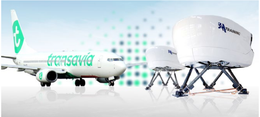
Photo: BAA Training will open a new training center for Transavia's pilot training needs

BAA Training , a part of Avia Solutions Group , and Transavia Airlines , a part of Air France-KLM Group , have signed a term sheet contract that sets out the conditions based on which BAA Training will open a new training center dedicated to Transavia's pilot training needs. The new aviation training center situated near Paris Orly Airport (ORY) in France and containing six simulator bays will be operated by BAA Training itself as enforced by an exclusive partnership agreement the parties will conclude shortly. The new BAA Training France training center will be ready to accept the first state-of-the-art simulator in the fourth quarter of 2022. The brand-new training facility will incorporate four simulators dedicated to Transavia France's needs. It is planned to install the following types of full-flight simulators: Boeing 737NG, Boeing 737 MAX, and Airbus A320neo. Additionally, a door and over-wing exit trainer, two FTD Level 2 devices, and other training equipment are being considered.