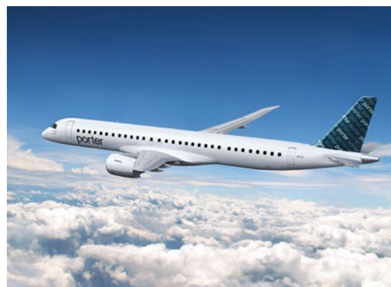
Porter E195-E2 jet

After unveiling plans for a major expansion in North America with a firm order for 30 E195-E2 jets, with purchase rights for a further 50 aircraft, Porter Airlines has signed a major aftermarket support package contract with Embraer. The Total Support Program (TSP) agreement includes airframe heavy maintenance checks, technical solutions, and access to the pool program, which includes component exchanges and repair services for hundreds of reparable items for Porter's fleet of E195-E2 commercial aircraft, for up to 20 years. Currently, the Pool Program supports more than 50 airlines worldwide. The Pool Program services will be provided by Embraer Aircraft Customer Services (EACS) in Fort Lauderdale, Florida, while the heavy maintenance services will be performed by Embraer Aircraft Maintenance Services (EAMS) in Nashville, Tennessee. In the coming months, Embraer will work with Porter to provide services related to the aircraft entry into service (EIS) process, which includes technical training, spare parts recommendations, and provisioning services. Porter's first delivery and entry into service is scheduled to start in the second half of 2022. The E195-E2 accommodates between 120 and 146 passengers and configuration plans for Porter's E2s will be revealed in due course.