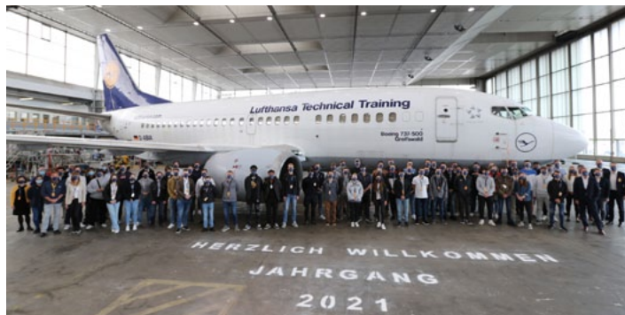
126 young people will start an apprenticeship at the Lufthansa Technik Group