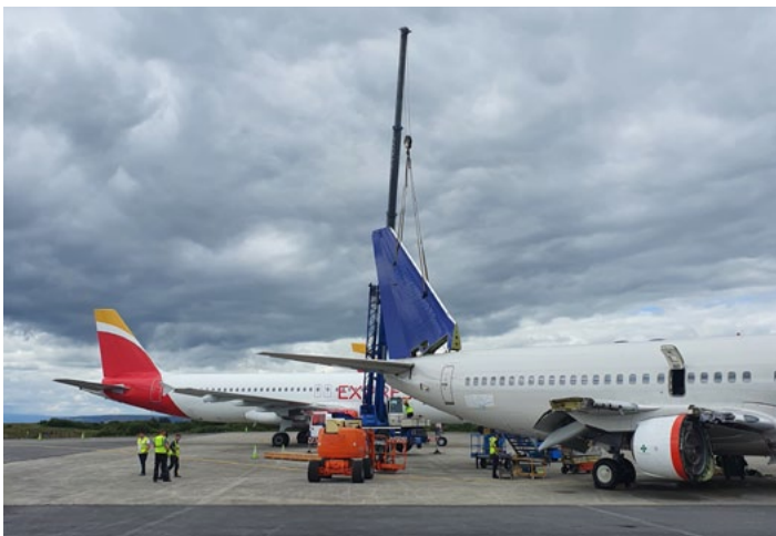
EirTrade will take on the disassembly market as first AFRA accredited facility in Ireland

EirTrade Aviation, the aviation technical asset services and trading company, has been awarded an AFRA (Aircraft Fleet Recycling Association) accreditation. The accreditation will see the company taking on the disassembly market as the first AFRA-accredited facility in Ireland and will serve to reassure its clients of the regular review and regulation of all processes. EirTrade provides disassembly services for all Airbus, Boeing, Embraer, Bombardier and ATR types. To date EirTrade has disassembled regional and commercial aircraft of all sizes from ATR-72 to A380 aircraft. The AFRA Best Management Practices (BMP) guide for disassembly is the leading standard for dismantling aircraft in a safe, efficient, and environmentally friendly manner. Established in 2006, AFRA is a membership-based global collaboration to elevate industry performance and increase commercial value for end-of-service aircraft. AFRA represents companies from across the globe and throughout the supply chain – from manufacturers to material recyclers. Through the collective experience of its members, AFRA's BMP Guide has significantly improved the management of end-of-life aircraft in terms of environmental and sustainable performance.