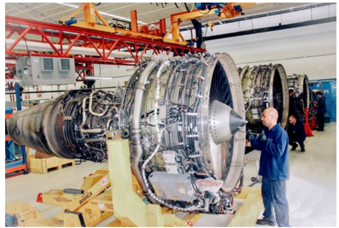
Photo: AvAir will manage more than 20,000-line items from IAI's core business lines

AvAir, an industry-leading inventory solutions provider for the aviation aftermarket, has completed an agreement with Israel Aerospace Industries' (IAI) Aviation Group to provide asset management solutions for more than 20,000 line items. IAI's Aviation Group is a global leader, with more than 50 years' experience in all aspects of the aircraft industry, having all the required capabilities in house at one centralized location. With total commitment to quality and an extensive portfolio, IAI maintains the highest expertise in a broad range of capabilities, from aeronautic design and engineering, through flight testing, modification, and certification. IAI is one of few companies with proven in-house FAR 25 certification capabilities. With this transaction, AvAir will manage more than 20,000 line items including internal parts and accessories from IAI's core business lines, CFM56-3, CFM56-5B, CFM56-7B, V2500-A5 and PW4000 engines, along with airframe components for the A320 and Boeing-family aircraft.