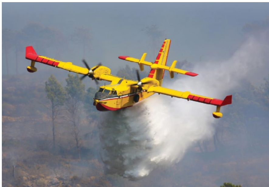
Canadair CL415 aircraft