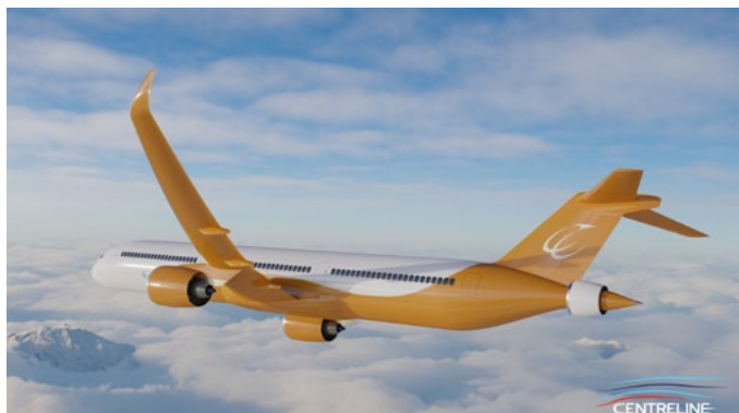
CENTRELINE turbo-electrically driven fuselage wake-filling aircraft