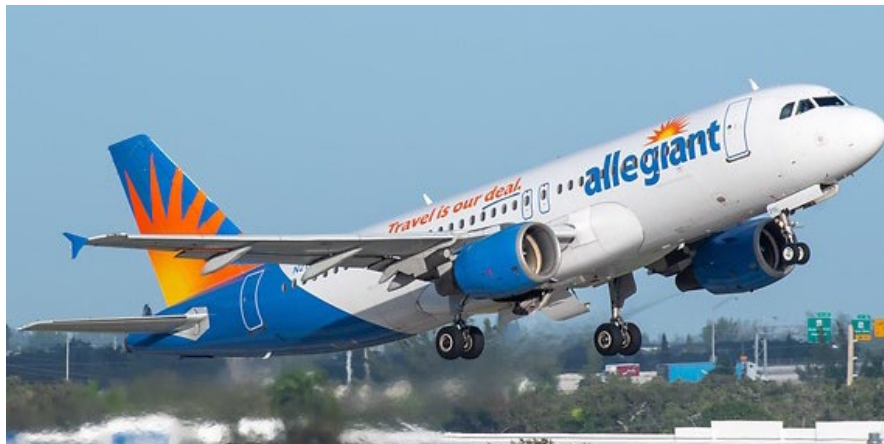
Allegiant will receive ten A320-200 aircraft from ALC