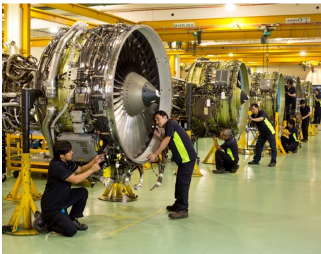
Photo: ST Engineering will provide CFM56-7B engine MRO services to Alaska Airlines at the Group's engine MRO facilities in Singapore

ST Engineering Group has secured two CFM56-7B engine Maintenance, Repair and Overhaul (MRO) contracts. The first is an exclusive five-year contract from Alaska Airlines. Under the agreement, which is an extension of an existing contract that expires at the end of this year, ST Engineering will provide engine heavy maintenance to the airline's fleet of 14 Boeing 737-700 and 12 Boeing 737-900 aircraft. These services will be provided starting from 2022 at the Group's engine MRO facilities in Singapore. The second contract is also for engine heavy maintenance services, which has been awarded by an Asian airline. Under the agreement, ST Engineering will service CFM56-7B engines that will be re-delivered over a 12-month period from mid-2022 to mid-2023. These services will be provided at the Group's engine MRO facilities in Xiamen, China.