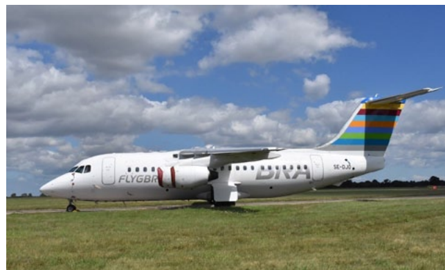
Avro RJ85 aircraft

Skyworld Aviation has arranged the sale of two Avro RJ85s to spares and components specialist Executive Jet Support (EJS) in the U.K. The two RJs were part of a ten-Avro RJ fleet previously operated by Braathens Regional. SE-DJO (serial number E2226) and SE-DJN (serial number E2231) are currently located at Norwich Airport in the U.K. where they will remain under a care and maintenance program for the time being. Executive Jet Support is a leader in providing commercial aircraft, engines and airframe components on sale, exchange, or loan basis across all major commercial and executive aircraft manufacturers. Skyworld Aviation has already completed the sale of two Avro RJ100's for EJS last year, as well as multiple previous ERJ and ATR aircraft / components transactions.