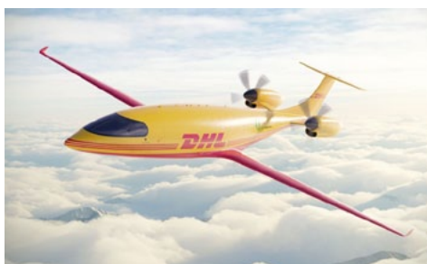
Alice can be flown by a single pilot and will carry 1,200 kilograms (2,600 lbs)