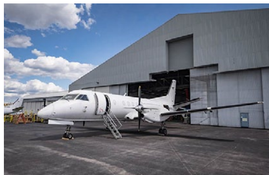
Saab 340B cargo configuration

C&L Aerospace, part of the C&L Aviation Group, has signed a contract for the sale of six Saab 340 aircraft to Legends Airways. C&L is converting all six aircraft for freighter operations. The first two aircraft have been delivered, with the remaining four being delivered by the end of 2021. C&L is also supporting Legends with parts and technical expertise. The Saab 340 is a versatile aircraft in either passenger or cargo configuration. That, combined with the aircraft's superior performance in its class, makes it a popular aircraft for operators around the world. Legends Airway is an FAA Part-135 on-demand air carrier currently operating in the U.S., Canada, Mexico, and the Caribbean. Legends Airways also owns an FAA Part-141/Part-61 flight school. This unique combination provides an advantage over most Part-135 operators, allowing Legends to train safe, responsible, and professional pilots, and maintain a pipeline of skilled and competent First Officers into its air carrier operation.