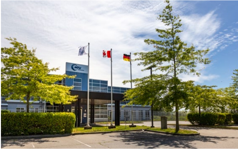
MTU Canada's new facility in Boundary Bay, Delta, BC