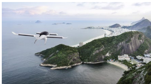
Azul will buy 220 of the 7-seater Lilium electrical vertical take-off and landing (eVTOL) jets

Munich, Germany-headquartered Lilium has announced it is entering into a strategic alliance with Brazilian airline Azul to create an exclusive eVTOL network in Brazil. Azul will buy 220 of the 7-seater Lilium electrical vertical take-off and landing (eVTOL) jets for up to US$1 billion. It is anticipated that the network will become operational in 2025. Currently, Brazil has a 100 million domestic air passenger market as well as substantial civilian helicopter and business aviation markets. Azul will operate and maintain the Lilium Jet fleet, while Lilium will provide an aircraft health monitoring platform, replacement batteries, and other custom spare parts. Azul will also support Lilium with the necessary regulatory approval processes in Brazil for certification of the Lilium Jet and any other required regulatory approvals. Daniel Wiegand, Co-Founder and CEO of Lilium said: "Azul has brought convenient and affordable air travel to underserved markets across the Americas and this makes them an ideal partner for Lilium. We're excited to work with Azul's seasoned team to deploy a co-branded eVTOL