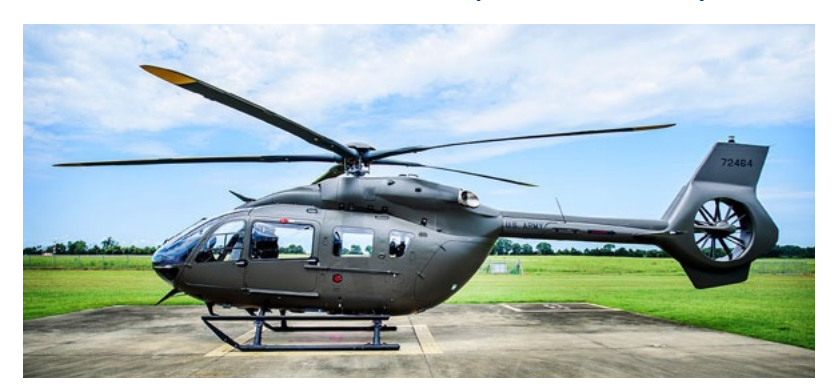
Airbus Helicopters delivers first UH-72B, to the U.S. Army National Guard