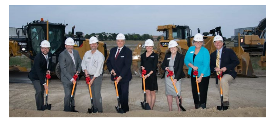
Groundbreaking at Rocky Mountain Metropolitan Airport