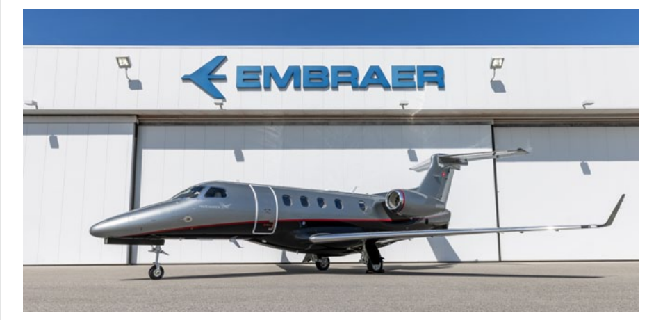
Phenom 300E Business Jet