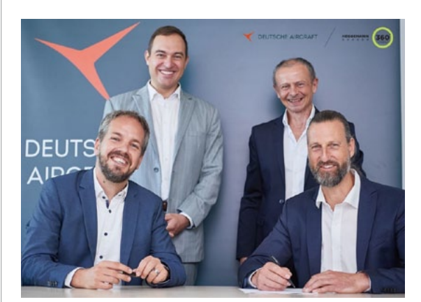
Partnership signing with HEGGEMANN