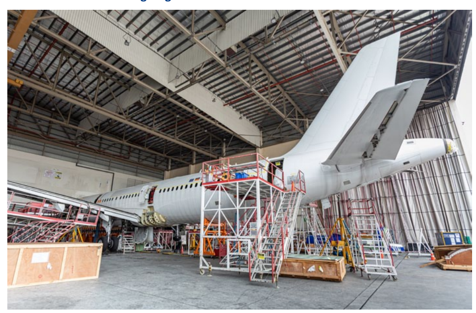
Airbus A321P2F undergoing cargo conversion