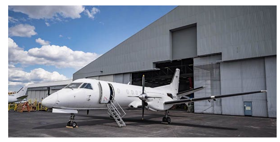
Saab 340B