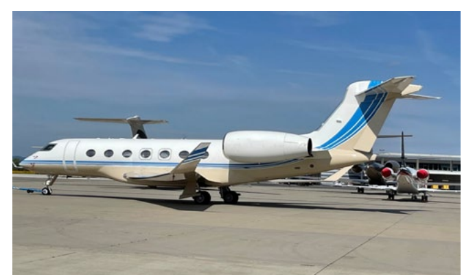
Gulfstream G500 and 600 Series