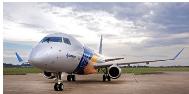
Photo: Embraer E175 aircraft

The Brazilian Development Bank (BNDES) has approved financing to export 24 Embraer E175 commercial jets to SkyWest Airlines, one of the largest regional aviation companies, based in Utah, U.S.A. The deal strengthens Brazil's industry at a time when it is still feeling the effects of the COVID-19 pandemic and boosts the presence of high-tech Brazilian products in the world's largest and most competitive aviation market. The deliveries began in August and will continue until April 2022. The financing of over US$500 million (more than R$ 2.6 billion), is in line with operations carried out by export credit agencies in countries with cutting-edge aeronautical industries. The aeronautical sector is considered strategic by nations due to key aspects such as advanced technology, continuous innovation, and highly skilled workers. Export credit agencies operate to complement the private credit market, doing so more intensely in times of crisis, which is clear in the history between the BNDES and Embraer.