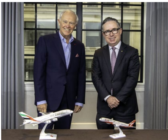
Photo: from left to right: Emirates President Tim Clark and Qantas Group CEO Alan Joyce

Qantas and Emirates have announced they will extend their cornerstone partnership for another five years, meaning customers and frequent flyers of both airlines will have access to an expansive joint network, and millions of reward seats to travel across Australia, New Zealand, Europe, and the U.K. The agreement was signed by Emirates President Tim Clark and Qantas Group CEO Alan Joyce at the International Air Transport Association Annual General Meeting in Boston. The airlines have existing approvals from regulators to operate a joint business until