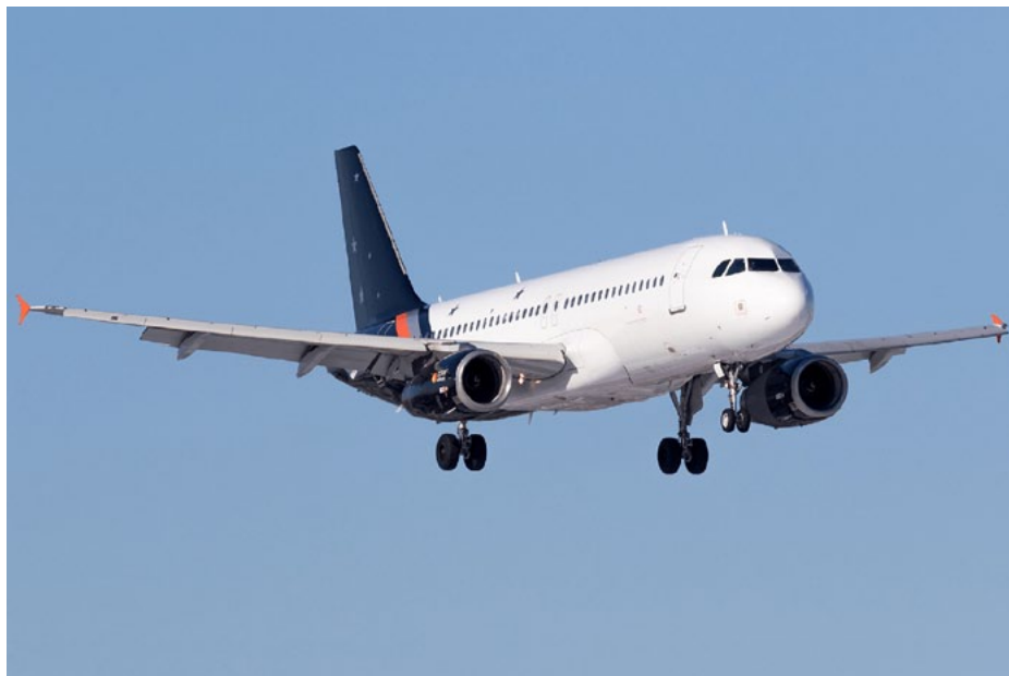
Types like the A320 are offering compatible crew availability.

Qantas has confirmed it will operate its flagship direct route from Australia to London via Darwin when international flights resume next month with the reopening of Australia's border. The national carrier has reached an agreement with the Northern Territory Government and Darwin Airport to temporarily reroute its flights from Melbourne and Sydney through Darwin.