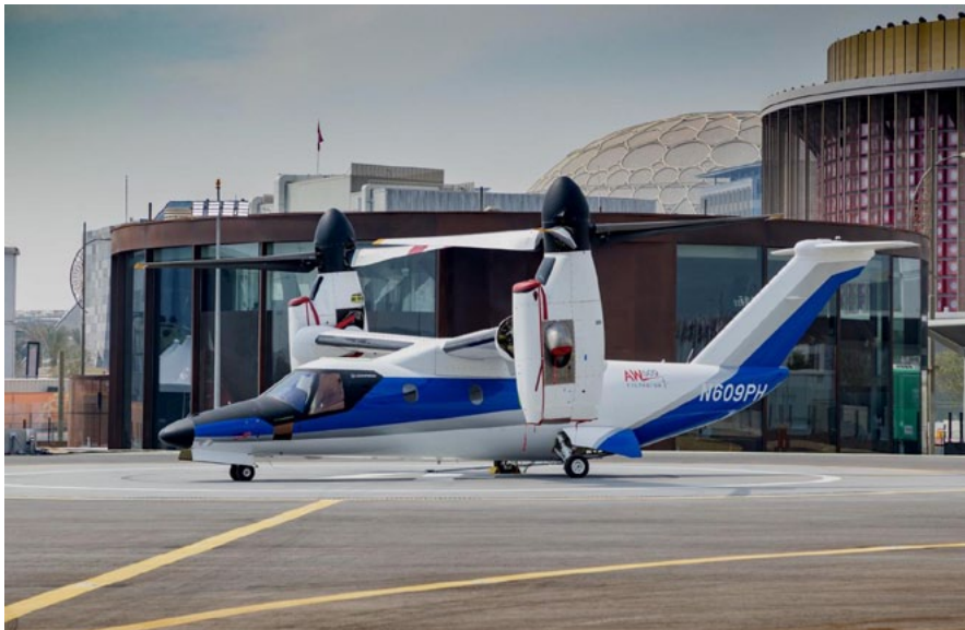
Dubai Expo 2020, Leonardo 3 AW609