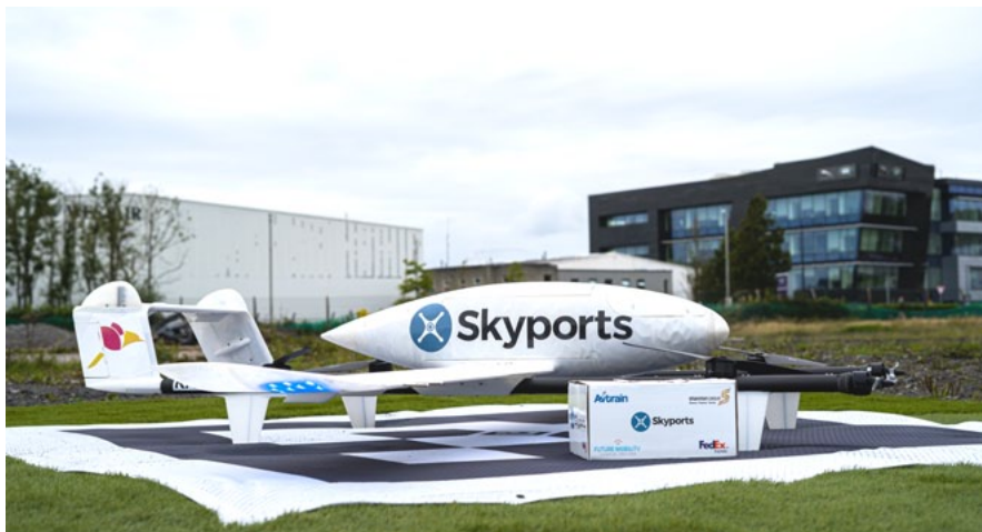
Testing last-mile drone delivery of goods between Shannon Airport to Foynes Port

March 2023. Qantas and Emirates will seek re-authorization from relevant regulators, including the Australian Competition and Consumer Commission, to continue the core elements of the partnership including coordination of pricing, schedules, sales, and tourism marketing on approved routes until 2028. The deal includes an option to renew for another five years beyond that. Together, both airlines are making millions of reward seats available for frequent flyers to access more than 100 destinations using their Qantas Points or Skywards Miles, which many have been stockpiling throughout the pandemic.