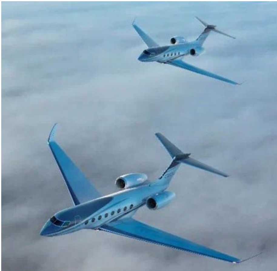
Photo: Gulfstream Aerospace has introduced two new business jets, the G800 and the G400

Gulfstream Aerospace, a wholly owned subsidiary of General Dynamics, has introduced two all-new aircraft, further expanding its ultra-modern, high-technology family of aircraft: the Gulfstream G800, the longest-range aircraft in Gulfstream's history, and the Gulfstream G400, the first new entrant to the large-cabin class in more than a decade. The G800 offers customers the longest range in the Gulfstream fleet with its 8,000-nautical-mile/14,816-kilometer range at Mach 0.85 and 7,000-nm/12,964-km range at Mach 0.90. Powered by high-thrust Rolls-Royce Pearl 700 engines and the Gulfstream-designed wing and winglet introduced on the Gulfstream G700, the G800 also features enhanced fuel efficiency and more city-pair capabilities. The all-new G400 offers a combination of long-range, high-speed performance; cabin comfort; and environmental efficiency. The G400 ramps up environmental performance by reducing fuel consumption, emissions, and noise through its use of Gulfstream's aerodynamic clean-wing design and advanced Pratt & Whitney PW812GA engines. The aircraft will fly 4,200 nm/7,778 km at its long-range cruise speed of Mach 0.85. Three floorplans are offered, with options for seating up to nine, 11 or 12 passengers, and the G400 provides the signature Gulfstream Cabin Experience and ten Gulfstream panoramic oval windows.