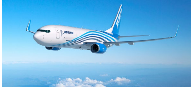
Photo: Genesis has ordered two 737-800 Boeing Converted Freighters