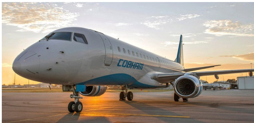
Photo: TrueNoord and Cobham Aviation Services have signed a six-year lease agreement for one Embraer E190

Cobham Aviation Services Australia has signed a six-year operating lease agreement with True Noord, the specialist regional aircraft lessor. The Embraer E190 (MSN 1900087) will be integrated into Cobham's fleet for immediate charter operation. Funding for the aircraft is underwritten by TrueNoord's existing revolving warehouse facility with Citibank, Société Générale and Royal Bank of Canada. CMS acted as legal counsel for TrueNoord with Alaris advising Cobham. The E190 has transitioned from TrueNoord's previous lessee Mandarin Airlines of Taiwan. It was temporarily stored in the Philippines before flying to Perth via Indonesia.