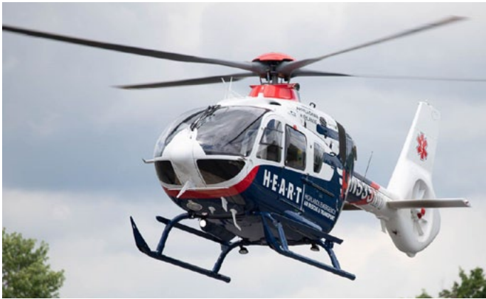
GMR will add a total of 21 Airbus helicopters from the H125, H130 and H135 families to its growing air medical fleet, with options for up to an additional 23 helicopters

Airbus has received a further firm order from Global Medical Response (GMR) for 21 helicopters from its H125, H130, and H135 families, with an option for a further 23 aircraft. GMR is one of the largest operators of Airbus helicopters and in the last 18 months alone took delivery of 15 of them as part of its Airbus fleet expansion program which currently runs at 133 aircraft. GMR delivers care through multiple operating brands, including Air Evac Lifeteam, Guardian Flight, Med-Trans Corp., and REACH Air Medical Services which, combined, transported more than 125,000 patients in 2020. "We fly a variety of Airbus products, but the main thing they have in common – and the most important thing we look for in our critical care transport solutions – is reliability," said Rob Hamilton, president of the GMR Alliances Group. "Our Airbus fleet allows us to respond quickly and transport critical patients with the appropriate level of care to give them the absolute best chance of survival. With the addition of these new aircraft, our fleet grows stronger and more capable to save lives when it matters most."