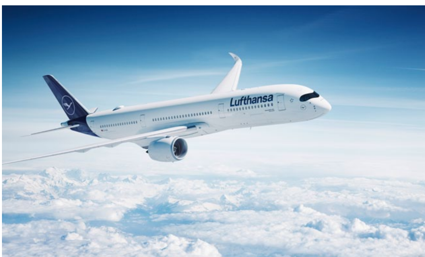
Photo: Lufthansa Airbus A350 aircraft

The Lufthansa Group is accelerating the modernization of its long-haul fleet. The Group has signed leases for four state-of-the-art and fuel-efficient Airbus A350-900 aircraft with lessors Avolon, SMBC Aviation Capital, and Goshawk. As a result, the Group's A350 fleet will grow to 21 aircraft at the beginning of 2022. The Airbus A350-900s are scheduled to enter service with Lufthansa's core brand from the first half of 2022, strengthening the airline's premium offering. The twin-engine Airbus A350-900 aircraft consume only around 2.5 liters of kerosene per passenger per 100 kilometers flown. That is around 30% less than its predecessors, with a correspondingly positive impact on the carbon footprint. The aircraft will primarily replace four-engine long-haul aircraft from the Airbus A340 family. By the middle of the decade, the proportion of four-engine aircraft in the long-haul fleet is expected to fall to below 15%. Before the crisis, the share was around 50%. The new, fuel-efficient aircraft will reduce operating costs by around 15% compared with the types it will replace. As part of its comprehensive, long-term fleet modernization program, the Lufthansa Group will take delivery of a total of further 177 short-, medium- and long-haul aircraft this decade.