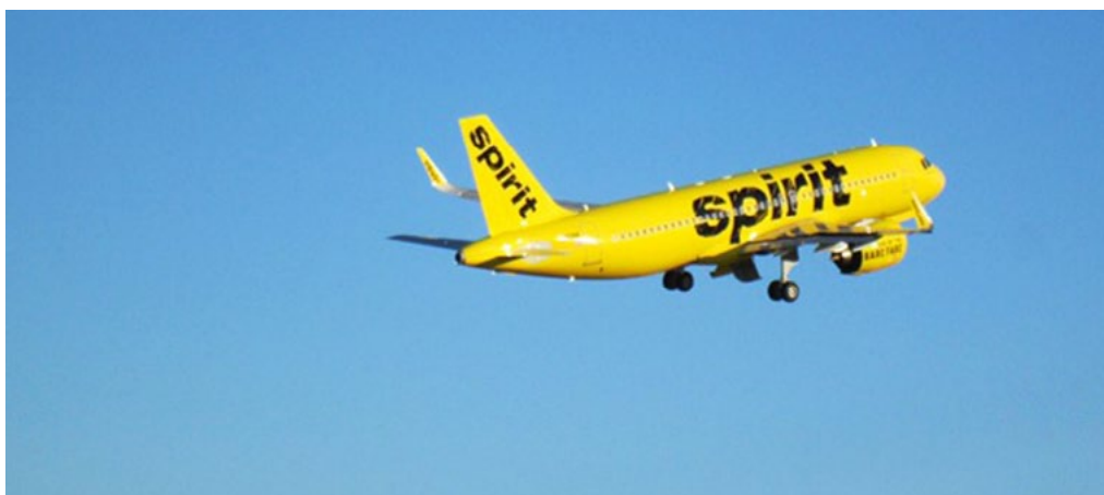
Spirit Airlines has signed lease agreements for 20 Airbus A320neo aircraft with lessor