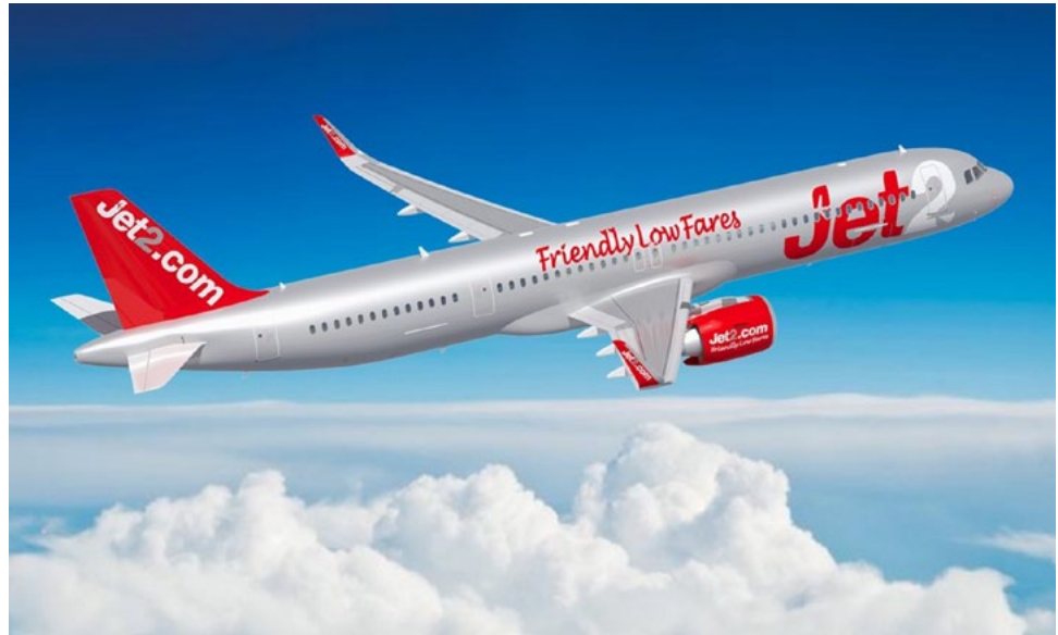
Jet2 has placed an order for 15 additional A321neos

Jet2.com has placed a further order for 15 A321neos following its initial order for 36 aircraft placed in August 2021. This takes the total order by the Leeds, United Kingdom-based airline to 51 A321neos. The two orders reflect Jet2.com's ambitious fleet expansion and renewal plans. Engine selection will be made at a later date. The aircraft will be configured for 232 seats with an airspace cabin featuring innovative lighting, new seating products, and 60% larger overhead baggage bins for added personal storage. The A320neo-family incorporates the latest technologies, including new-generation engines and sharklets, delivering a 20% reduction in fuel consumption per seat. With an additional range of up to 500 nautical miles/900 km, or two tons of extra payload, the A321neo will deliver Jet2.com with additional revenue potential.