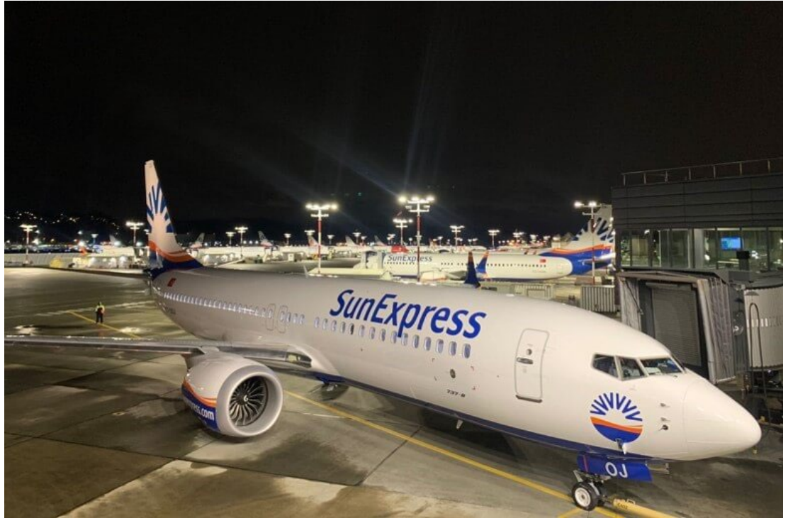
Photo: Jackson Square Aviation announces financing of four Boeing 737 family aircraft to SunExpress Airlines