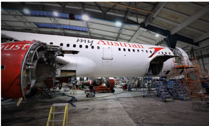
Austrian Airlines aircraft in CSAT hangar