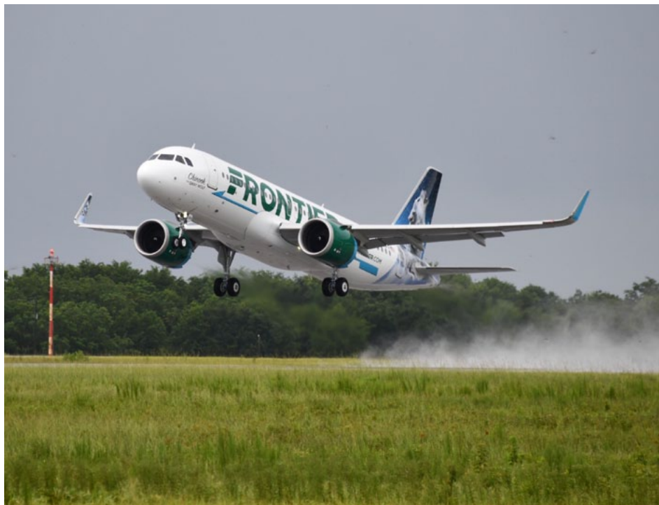
The airline aims to triple in size by 2029.

Ethiopian Airlines announced that it has received IATA's Centre of Excellence for Independent Validators in Pharmaceutical Logistics (CEIV Pharma) certification as an airline and ground handler. The airline states that it is the first airline in Africa to do so. The IATA CEIV certification comes at an opportune time for Ethiopian Cargo and Logistics as they continue to play key global role in the transportation of life saving COVID-19 vaccines around the world and particularly in Africa.