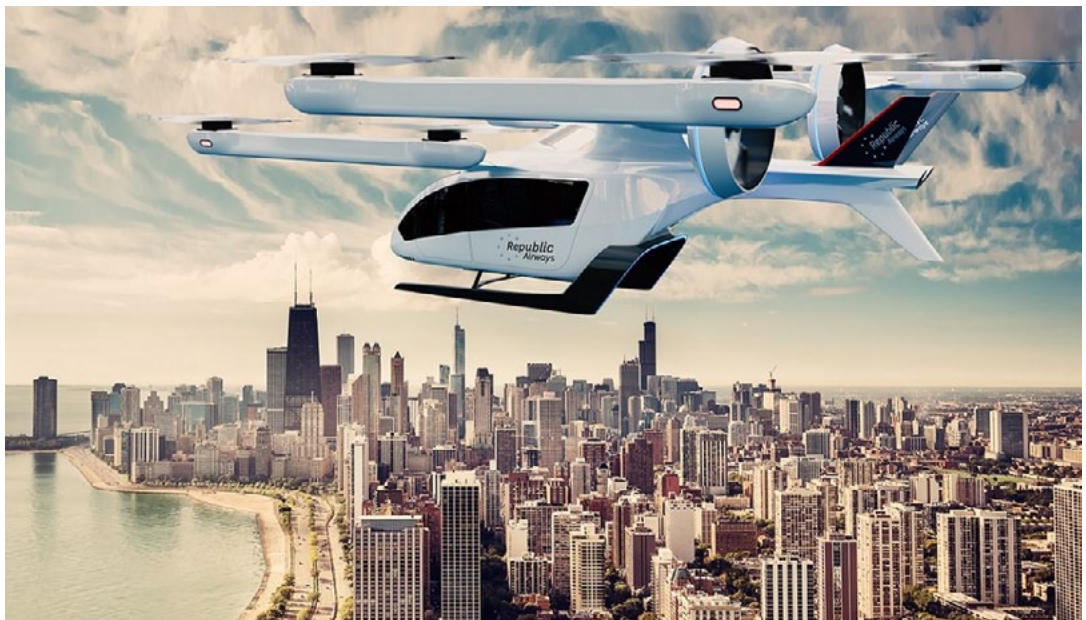
Eve Air Mobility and Republic Airways announce partnership to develop regional operator network of the future

Eve Air Mobility, an Embraer company, and Republic Airways Holdings have signed a Memorandum of Understanding and Letter of Intent to purchase up to 200 of Eve’s electric vertical take-off and landing aircraft (eVTOL) to explore additional opportunities within its subsidiaries, such as the LIFT Academy, that are focused on workforce development initiatives and the future of air travel. The strategic relationship will focus on developing a deployment network throughout the Central and East Coast markets of the United States, with an initial focus on the Boston, New York and Washington, D.C. markets. In preparation for the first Urban Air Mobility (UAM) flights with Eve’s aircraft, the companies have agreed to establish a working group that will study the requirements of future AOCs (Airline Operating Certificates) where Eve’s aircraft can be deployed in specific markets and missions. This same working group will also examine the feasibility of additional services from other types of urban air vehicles, which could further expand access into new markets.