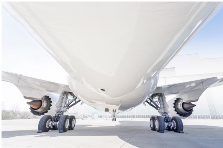
Photo: Jet Aviation has redelivered a Boeing-787 VVIP