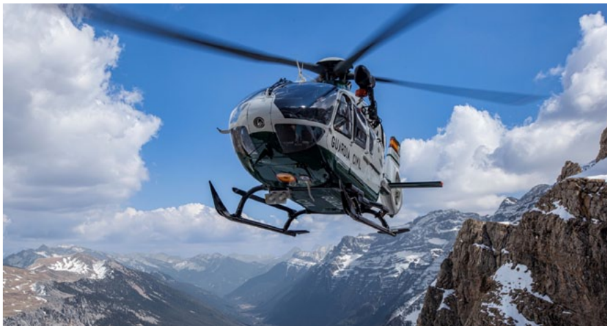
18 of the new H135 helicopters will be operated by the Spanish National Police and the Guardia Civil

The Spanish Ministries of Defence and Interior have ordered 36 Airbus H135 helicopters. The Ministry of Defence will receive 18 helicopters to be operated by the air force and the navy while the Ministry of Interior will also take delivery of 18 helicopters to be operated by the National Police and the Guardia Civil. Deliveries will start next year. The Spanish Army already operates a fleet of 16 H135 helicopters. With this acquisition, these will be the Spanish Air Force's first H135s and the Spanish Navy's first Airbus Helicopters product. As was the case for the H135s acquired some time ago by the army, the new aircraft for the air force and navy will replace older helicopter models currently used for advanced pilot training. The standardisation of training fleets across the three armed forces will create synergies and lead to the implementation of new and more efficient training and support activities.