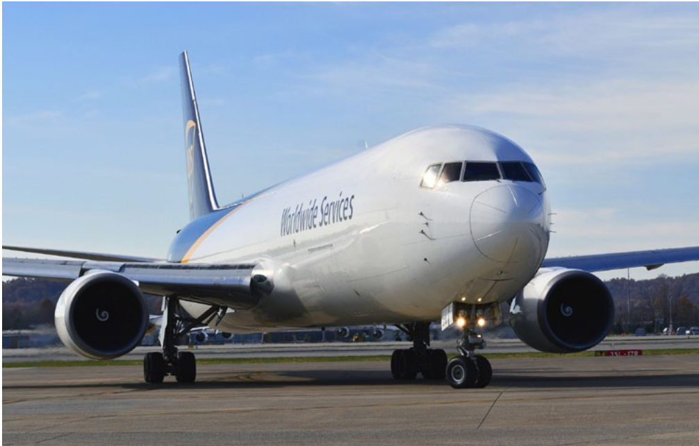
UPS has ordered 19 Boeing 767 Freighters