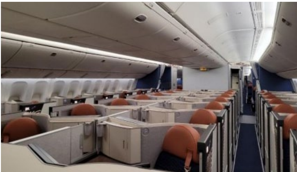
Aeroflot's new business-class