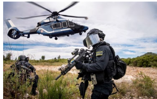
France's Gendarmerie Nationale will get ten H160 helicopters

France is the first country to order the H160 for law enforcement missions. The H160s for the Gendarmerie Nationale will be equipped with a Safran Euroflir 410 electro-optical system, winching and fast roping capabilities. The air force command centre of the Gendarmerie Nationale and Airbus Helicopters are also working closely together to develop a tailored mission management system. The French Gendarmerie Nationale already operates a wide fleet of Airbus helicopters from the H125, H135 and H145 families. On top of its improved performances and advanced mission systems, the H160 will bring a new troop transport capability for the French Ministry of Interior's security forces, mainly tactical units, such as the Gendarmerie Nationale's intervention group (GIGN). The first H160s will be delivered before the Olympic Games that will take place in Paris in 2024.