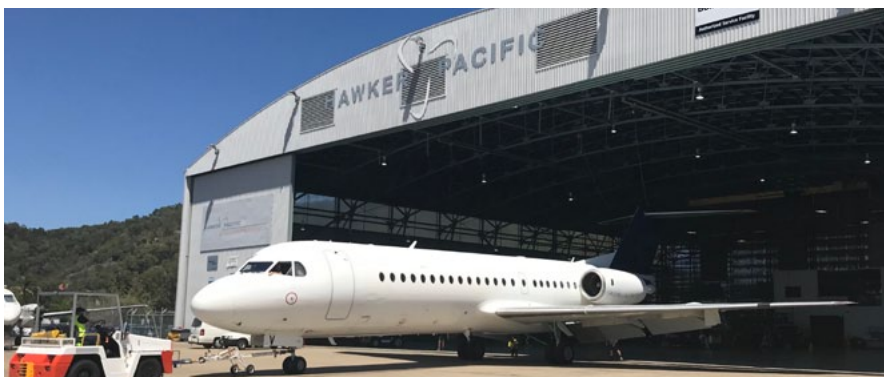
Cairns MRO facility