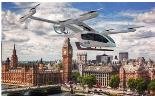
Eve and Falco announce partnership to develop a global operator network with a potential order for 200 eVTOLs