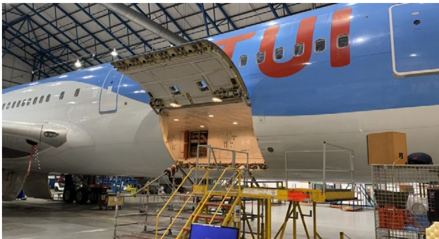
44 aircraft have now been through Caerdav's St. Athan base since the two companies began working together in 2019