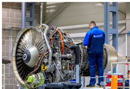
Photo: FL Technics partners with SETAERO to deliver tailor-made solutions for aircraft parts and material

A new partnership agreement was signed between FL Technics, a global independent MRO service provider and SETAERO, a leading organization providing repair services for aircraft parts and composites. The scope of the agreement covers advanced maintenance and repair services integrated with a vast network of FL Technics' asset trading and management, forming a unique portfolio of tailor-made solutions to repair, supply and maintain airframes, flight surfaces and nacelles. All these components can be scaled and specialized based on clients' aircraft type, fleet size and geography of operations worldwide. This is a unique business case strengthening positions of both companies in the market and creating new opportunities to meet the ever-shifting needs of clients across the globe. Teams behind the milestone boast vast expertise in managing aircraft components and materials, to provide tailored services to the customers. Thus, as of the start of cooperation, the two companies will leverage owned and shared expertise as well as resources to deliver specialized off-the-shelf solutions and products for airlines and operators.