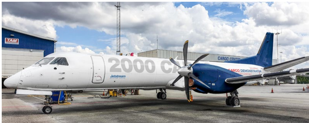
A visual impression of the Saab2000 once its converted to cargo.

Qatar Airways is boosting its service to Nigeria with the launch of four weekly flights to Kano on 02 March 2022, and three weekly flights to Port Harcourt on 03 March 2022, both operating via the Nigerian capital, Abuja. The airline currently operates two daily flights to Lagos and four times a week to Abuja, which will expand to a daily service in March. Kano and Port Harcourt will be operated by B787s and are the seventh and eighth new African gateways launched by the carrier since the start of the pandemic.