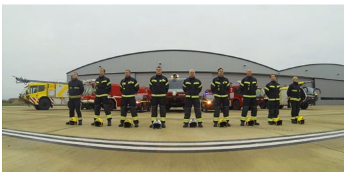
Photo: London Oxford Airport upgrades Fire and Rescue Service to full-time Category 6

London Oxford Airport has commenced the New Year with a significant upgrade of its Rescue and Fire Fighting Services (RFFS) to Category 6. The enhanced status follows the introduction of replacement fire tenders, allowing