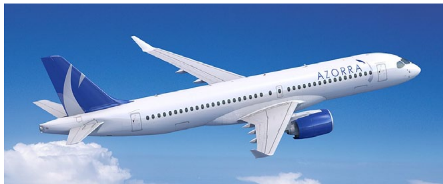
US-based Azorra has placed an order for 22 A220-family aircraft