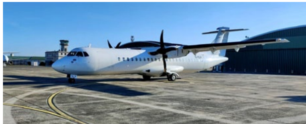
Photo: TrueNoord leases ATR72- Amelia International

In a new re-marketing transaction, TrueNoord, the specialist regional aircraft lessor, has entered into a new four-year operating lease agreement with Amelia International, part of the Regourd Aviation