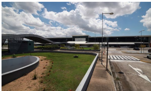
Photo: Manaus International Airport Brazil