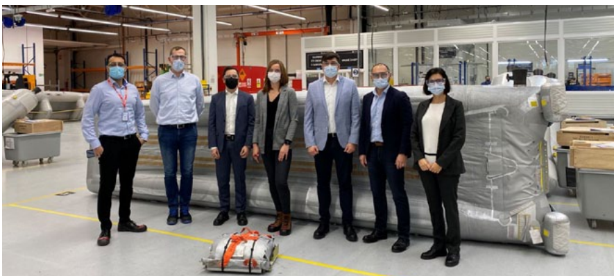
Spairliners and Collins Aerospace Wroclaw agree to new evacuation slide repair contract