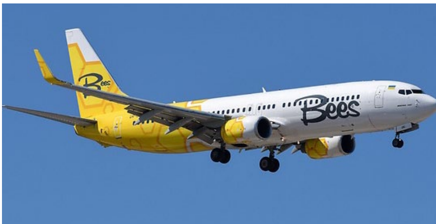
Bees Airline Boeing 737-800 aircraft