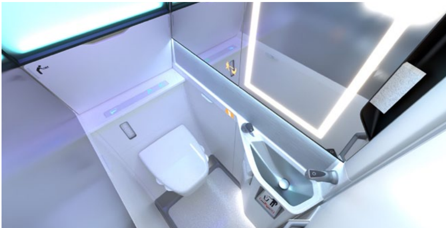
Photo: Collins Aerospace will provide next-generation lavatories for the Boeing 737 aircraft

Boeing has selected Collins Aerospace to be the long-term provider of next-generation lavatories for the Boeing 737 family of aircraft. The new lavatory incorporates a modular design and customization opportunities for trim, finish and lighting and includes touchless functionality, the latest micro-LED lighting technology and a centralized computing system to optimize the passenger experience, improve airline operability and help pave the way for future technology integration. The next-generation lavatory is expected to be available on new Boeing 737 airplanes beginning in 2025, with installation available in 12 separate airplane locations and several different lavatory variations to choose from, including an accessible lavatory for passengers of all mobilities.