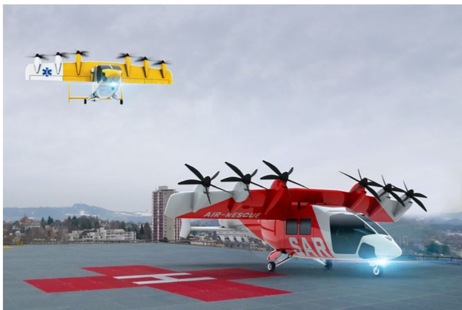
The Dufour Aerospace Aero3 is well suited for roles such as Air Ambulance or Search and Rescue