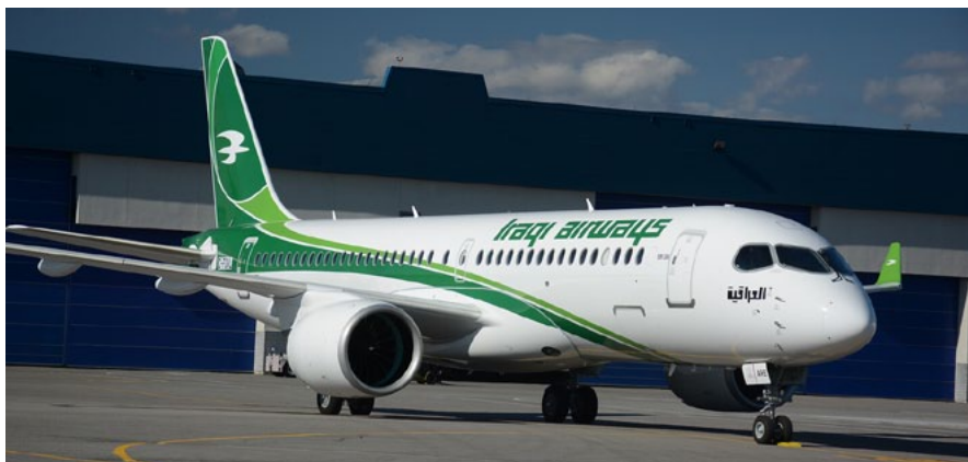
Iraqi Airways becomes one of the first airlines to operate the A220 in the Middle East region