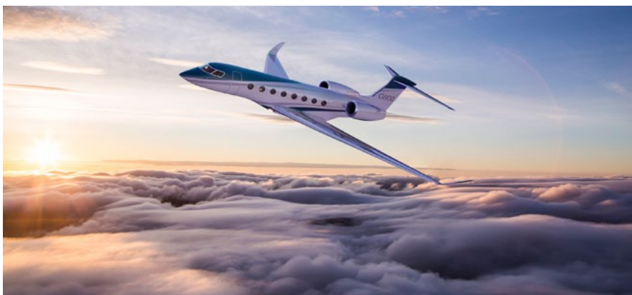
The Gulfstream G800 business jet