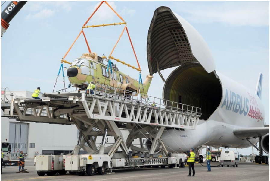
Beluga transport test-load