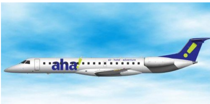
Embraer ERJ 145 jet in aha! livery