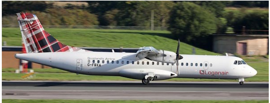
Loganair ATR 72-600 aircraft