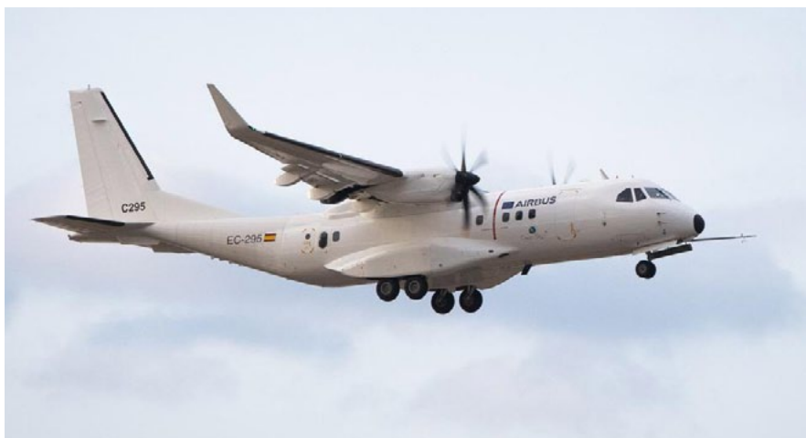
First flight of C295 Clean Sky 2