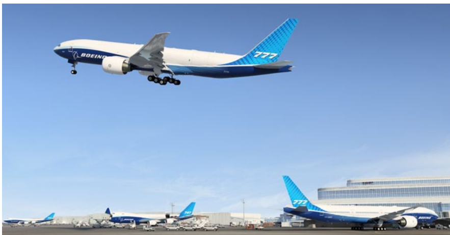
Boeing 777F in flight