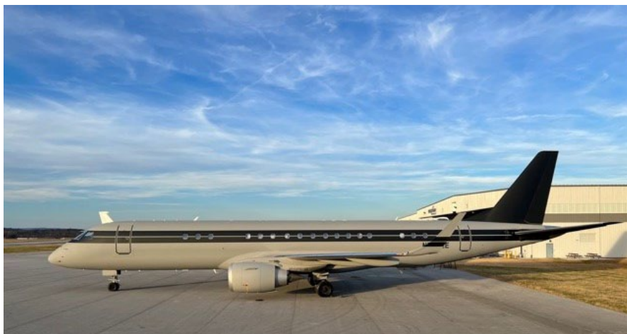
The finished paint job on an Embraer Lineage