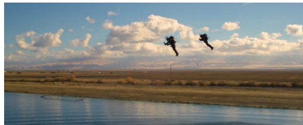
Training for the JB12 JetPacks will take place over water when off-tether