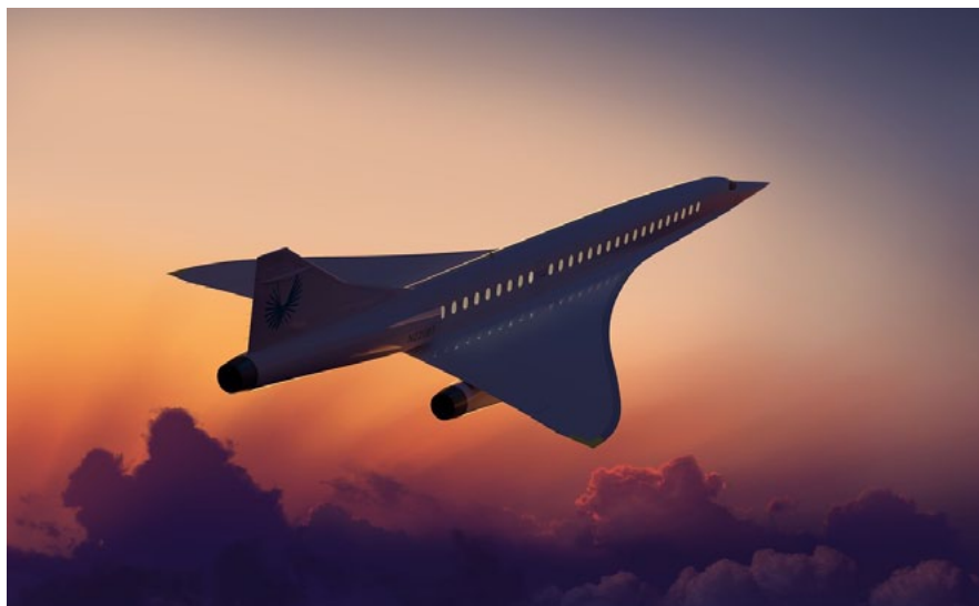
Photo: Boom Supersonic Overture