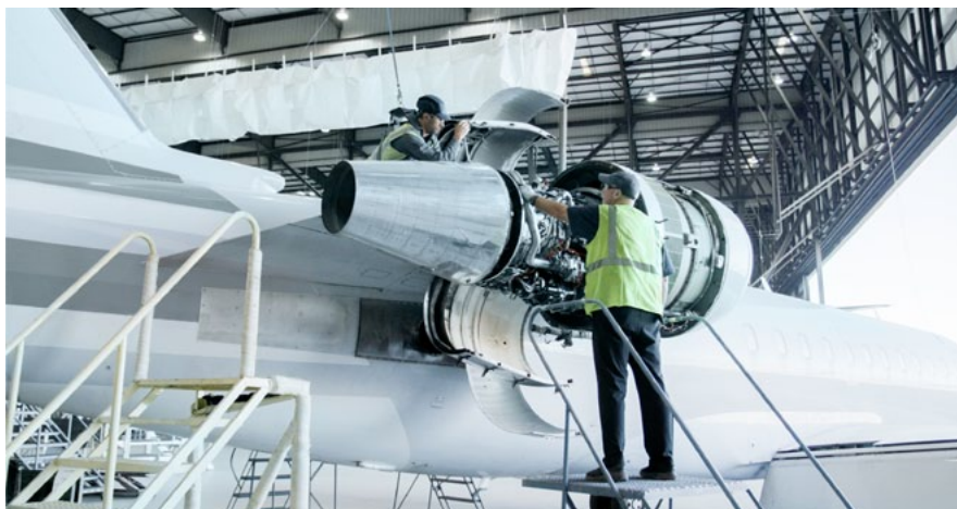
Photo: MHIRJ's new facility in Macon, Georgia

MHI RJ Aviation Group (MHIRJ) is expanding its Maintenance, Repair and Overhaul network with the opening of a new facility in Macon, Georgia. The new facility will be located at the Middle Georgia Regional Airport and is part of MHIRJ's growing footprint in North America servicing the CRJ Series fleet. The lease has been signed for two additional lines of maintenance, with the potential to grow that number to four, which would bring the total up to 40 lines of maintenance within the MHIRJ network. The new facility will add around 200 jobs in the local community at full capacity, for which MHIRJ will kickstart hiring efforts immediately. MHIRJ now has facilities in Macon Georgia, Bridgeport, West Virginia and Tucson, Arizona.