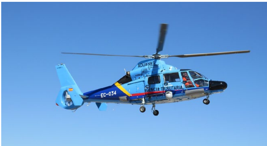
Photo: Airbus delivered the last Dauphin helicopter to the Spanish Customs Service

Airbus has delivered its last Dauphin helicopter, an AS365 N3, to the Spanish Customs Service. This helicopter will reinforce the Customs Surveillance Service's capacity to combat drug trafficking in the Strait of Gibraltar, the Alboran Sea and in Galicia. The helicopter was customised at Airbus Helicopters' facilities in Albacete and comes equipped with mission equipment such as an electro-optical system, radar, tactical communications system and search light, since most of the patrol flights take place at night. Thanks to its long-range fuel tanks, the Spanish Customs' Dauphin can fly up to three hours and 30 minutes and reach a fast cruise speed of 145 kts – an essential asset when it comes to reaching the vessels of drug traffickers. The Spanish Customs' three Dauphins perform maritime patrol missions to track, chase, and intercept high-speed smuggling boats typically transporting contraband. In 2021, the Dauphin helicopters contributed to the seizure of more than 200 tons of illegal drugs in Spain, working with the Custom Service's 45 vessels and land units.