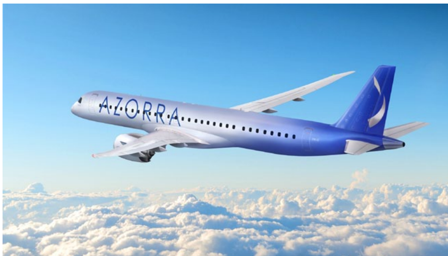
Azorra E195 E2 aircraft