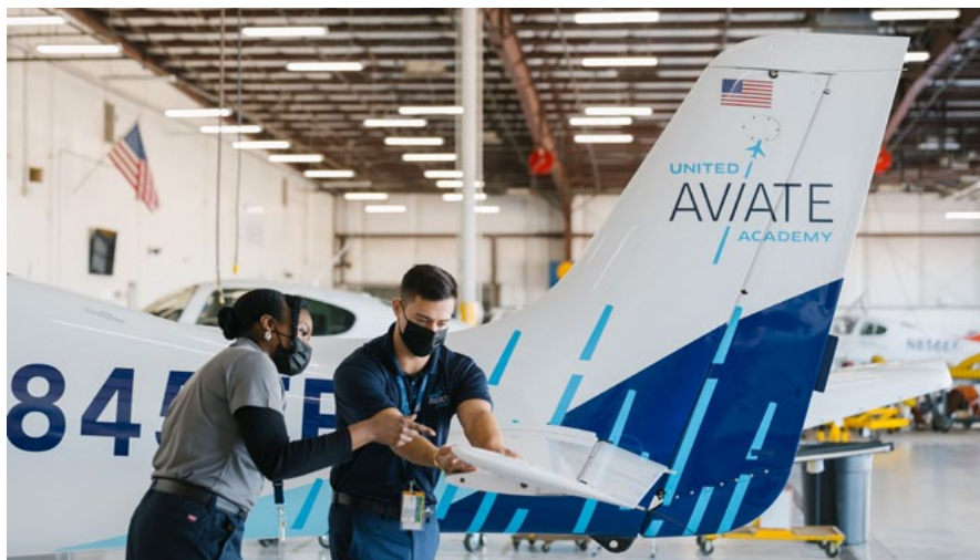
United Aviate Academy has been officially opened on January 27