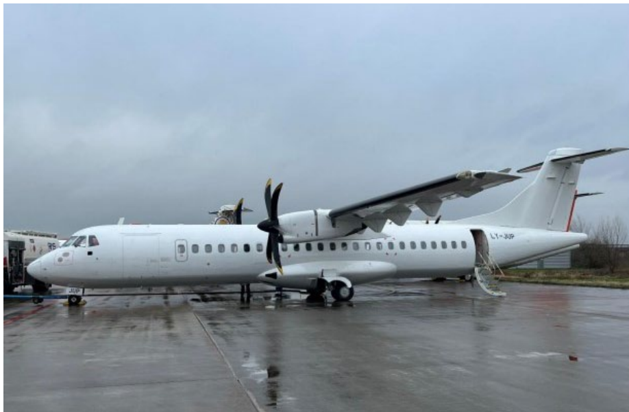
Photo: Jump Air has received its Type A commercial license on January 24

On January 24, 2022, European ACMI/charter airline Jump Air received its Type A commercial licence and has officially started its commercial operations. The airline, with its headquarters in Vilnius, Lithuania, has received its Air Operator Certificate (AOC) No.LT.AOC.037 from Lithuania's civil aviation regulator (Transporto Kompetencijų Agentūra – TKA) on December 31, 2021. Type A commercial licence was the last start-up document the airline had to obtain in order to begin commercial operations. Jump Air is now fully staffed, crewed and licenced for commercial air operations and currently operates one ATR 72-500 aircraft that is momentarily parked at Orio al Serio International Airport in Italy. Jump Air plans to grow its fleet by two to three more ATR 72 units by the end of 2022, including an ATR 72 type freighter variant. The airline targets Europe, Middle East, Africa, Asia and Asia Pacific as potential markets for charter and long-term wet-lease operations.