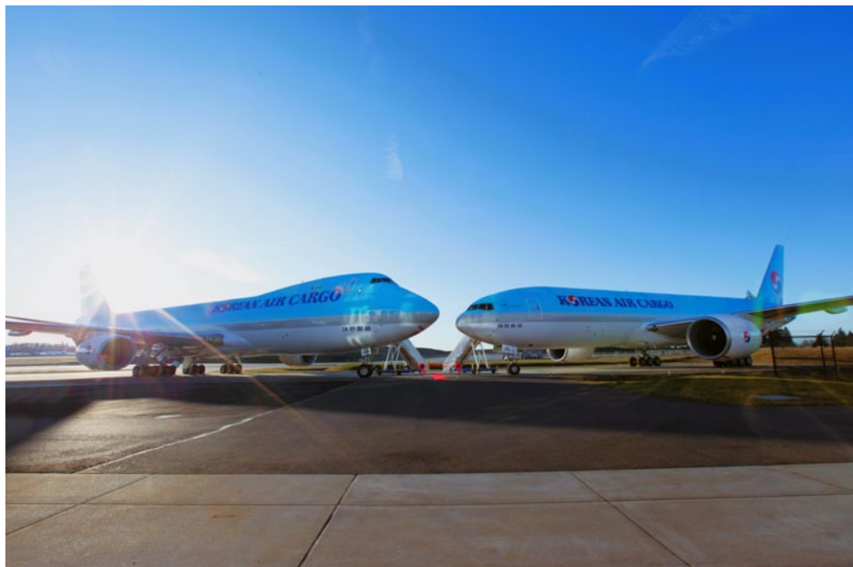
Cargo was a bright spot for the region.

Emirates has signed a new agreement with Amadeus, extending their partnership to offer the travel trade community more flexibility, choice, and future capabilities. The new agreement will also see Emirates' NDC content integrated into the Amadeus Travel Platform, with NDC content being made available to travel sellers over the course of 2022.