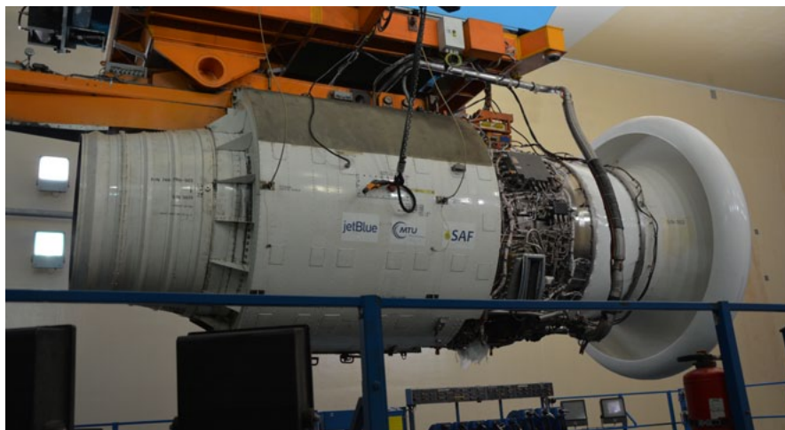
Tests have started on data-gathering on sustainable aviation fuels with JetBlue's V2500 engine

MTU Maintenance has partnered with JetBlue Airways for the testing and data-gathering on sustainable aviation fuels (SAFs) with the airline's V2500 engines following on from shop visits in Hannover, Germany. Conducted in a controlled ground environment, test runs will initially be performed with a 10% SAF fuel blend and can be expanded to up to 50%, the current regulatory limit, if required. This SAF is sustainably derived from waste fats, oils and greases and has up to an 80% lifecycle greenhouse gas emission reduction per gallon when compared to the conventional jet fuel it replaces. "We are delighted to be MTU Maintenance's launch customer in this pioneering and sustainable initiative," says Sara Bogdan, JetBlue Director of Sustainability and Environmental Social Governance. "Our goal is to achieve net-zero carbon emissions by 2040 and implementing sustainable initiatives along the supply chain and gathering the necessary data to ensure these initiatives are safe, practical and meaningful, is a key part of this work." JetBlue currently has an exclusive thirteen-year contract with MTU Maintenance for its V2500 pre-select fleet.