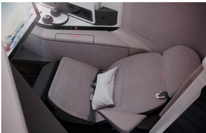
Photo: Unum business-class seat

ation and military aircraft, as well as the safety restraints used by space flight operators such as SpaceX, Blue Origin and Virgin Galactic. The newly launched Unum Aircraft Seating designs and produces lie flat business-class seats for commercial airliners. Based in Weybridge, UK, Unum adheres to the quality assurance measures and compliance with the Civil Aviation Authority.