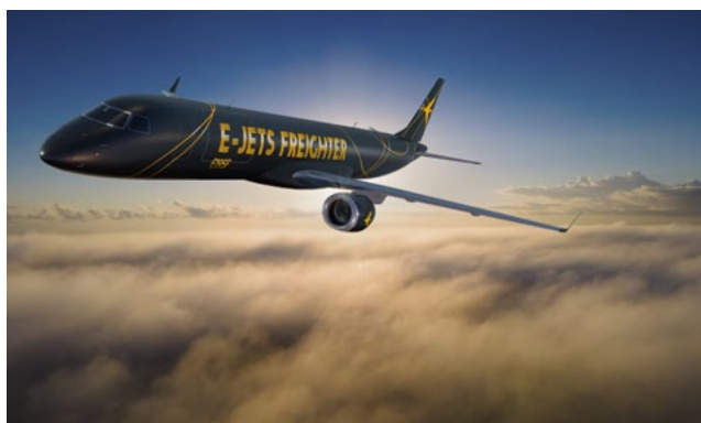
Embraer takes aim at the air freight market with the launch of E190F and E195F P2F conversions

Brazil's Embraer has announced the launch of its E190F and E195F Passenger to Freight (P2F) conversions with a mid-size jet that, capacity wise, fills a gap between turboprops and narrow-body jet freighter aircraft. The first of its converted aircraft, which is available to any pre-owned E-190 and E-195 jets, should be in service by 2024. With the changing demands of e-commerce that not only require rapid deliveries but also decentralised operations, right-sized jets can provide the necessary cargo economics and unbeatable flexibility. "Perfectly positioned to fill the gap in the freighter market between turboprops and larger narrow-body jets, our P2F E-Jet conversion hits the market as the demand for airfreight continues to take off and as e-commerce and trade in general undergoes a global structural transformation," said Arjan Meijer, President and CEO Embraer Commercial Aviation. Those earlier E-Jets that entered service around ten-plus years ago are now coming out of long-term leases and commencing their replacement cycle, which will continue over the next decade. The full cargo conversion will extend the life of the most mature E-Jets by a further 10 to 15 years, as an efficient, more