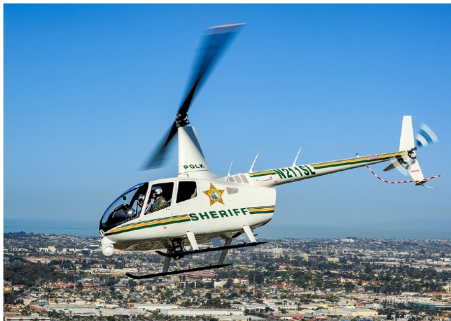
Florida's Polk County Sheriff's Office has ordered two additional R66 Police Helicopters