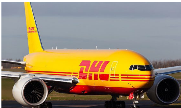
DHL Express Boeing 777F