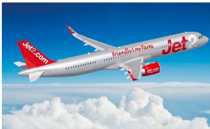
Jet2 Airbus A321neo in-flight