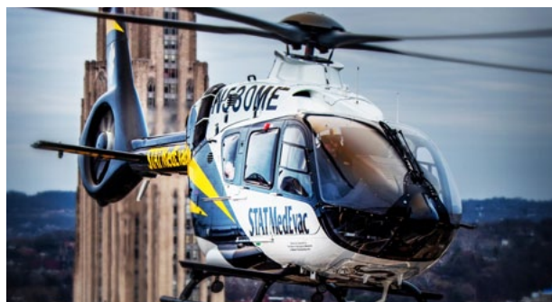
STAT MedEvac Airbus H135 helicopter

STAT MedEvac (STAT) has committed to ordering ten new H135 helicopters as part of a fleet renewal initiative for its air medical operations. STAT's total Airbus fleet, a mix of H135 and H145-family aircraft, operates out of 18 bases. STAT MedEvac has flown Airbus helicopters since commencing operations in 1985 and has a longstanding history with the H135 family – it was the first air ambulance programme in North America to operate the EC135 in 1997, the first single-pilot IFR programme with an EC135 in US. Helicopter Emergency Medical Services (HEMS), the launch customer of the latest H135 variant in North America and the launch customer of the Helionix-equipped version in 2019. The Pennsylvania-based critical care transport provider is the clinical arm for the Center for Emergency Medicine of Western Pennsylvania and is also the largest single branded, non-profit medical transport system in the Eastern United States.