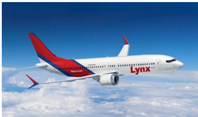
Lynx Air has contracted TCI for the design and manufacturing of its cabin interior products

Lynx Air (Lynx), Canada's newest ultra-affordable airline, has entered an agreement with TCI Cabin Interior (TCI) for the design and manufacturing of its cabin interior products. The airline, headquartered in Calgary, AB, will use the galleys and monuments produced by TCI in its fleet of 40 Boeing 737 MAX 8 aircraft.