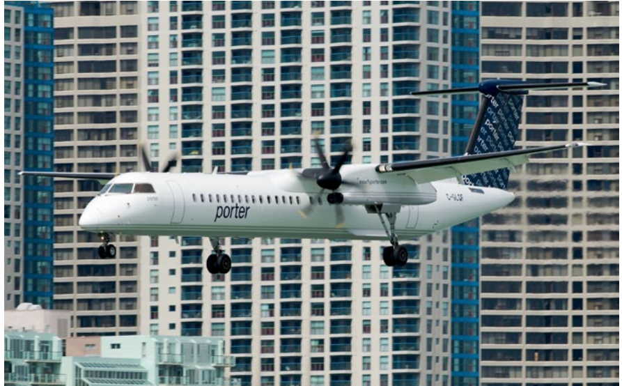
Porter Airlines Dash 8-400 aircraft