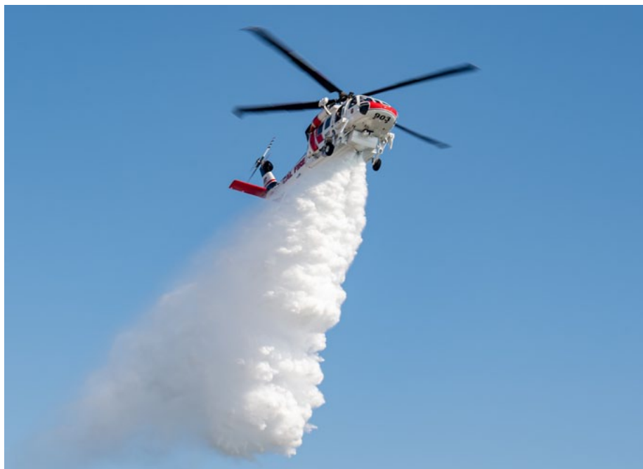
A FIREHAWK aircraft operated by CAL FIRE demonstrates the high pressure and concentration of water released from its 1,000-gallon tank for effective wildfire fighting