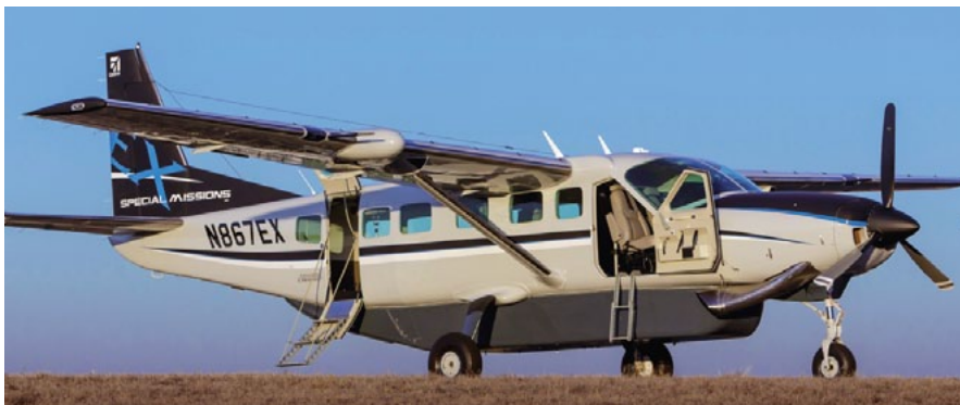
Cessna Special Mission Caravan