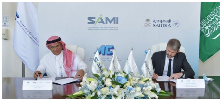
Signing of the new partnership agreement between AACC and Safran Landing Systems

Saudi Aircraft Accessories and Components Company (AACC), a subsidiary of Saudi Arabian Military Industries (SAMI), has announced the signing of a four-year partnership agreement with Safran Landing Systems to expand its maintenance, repair and overhaul (MRO) capabilities to offer commercial aircraft and military rotary landing gear overhaul services in the Kingdom of Saudi Arabia. As one of the largest MRO service providers in the Middle East, AACC currently offers landing gear MRO services for F-15, C-130 and Typhoon military fixed-wing aircraft. Thanks to this partnership with Safran Landing Systems, AACC will significantly enhance its MRO capabilities in the Gulf region. In addition to contributing to the MRO development in the Kingdom, the strategic partnership will lead to the creation of new quality jobs for Saudis and the transfer of new skills and knowledge, as well as generating additional business in France and the United Kingdom. This contract will also benefit from Landing Life™, the support and services offer, which covers all Safran Landing Systems' after-sales business and aims.