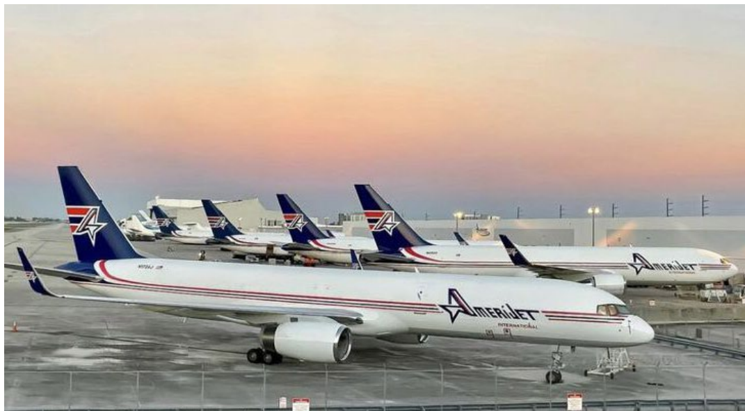
The 757s will bring the fleet operated by Amerijet to 20 freighters.

UK regional airline, Loganair, has announced that it will add a fuel surcharge on to new ticket sales as it responds to increasing worldwide fuel prices. The airline has also clearly laid out the steps for the fuel charge's removal as and when global oil prices fall. If the price of Brent crude oil falls below $110 per barrel for six consecutive weeks, the surcharge will be halved, the airline stated.