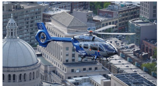
Boston MedFlight is the region's primary provider of critical care and medical transport

Boston MedFlight has signed an order for its first five-bladed H145 helicopter as part of a fleet renewal and expansion project to support an increased need for critical care transportation in New England. Boston MedFlight is the region's primary provider of critical care and medical transport, caring for more than 5,600 patients annually, including the most critically ill and injured infants, children and adults. A 501(c)(3) non-profit organisation, Boston MedFlight provides more than US$7 million (£5.4 million) each year in free and unreimbursed care to patients in need who have little or no insurance. Its current Airbus fleet of five H145 helicopters serve as mobile ICUs, staffed by a critical care nurse and critical care paramedic. The purchase of the new five-bladed H145 is part of an ongoing fleet renewal and expansion programme to meet increased demand for critical care transport in the Boston area, where they have been saving lives for nearly 40 years. Boston MedFlight also plans to retrofit its current fleet to the five-bladed variant in the next year.