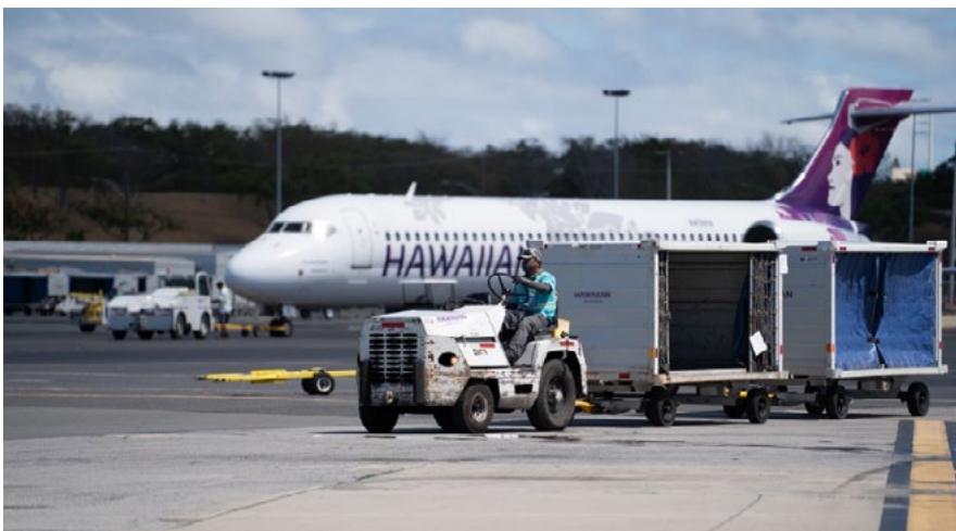
Photo: Hawaiian Airlines is recruiting for more than 600 positions