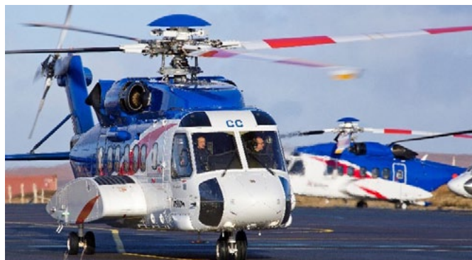
The S-92 helicopter powered by GE's CT7-8A engine

GE and Bristow Group have signed ten-year TrueChoice Flight Hour agreements for Bristow's CT7-8A powered Sikorsky S-92 fleet and its CT7-2E1 powered Leonardo AW189 fleet. This consolidates the multiple TrueChoice agreements held by Bristow Group following its June 2020