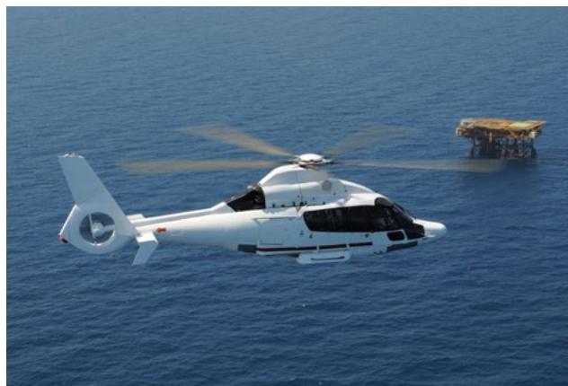
Airbus H155 helicopter

Romanian Oil & Gas operator Vega Offshore has chosen Rusada's ENVISION software to manage its airworthiness and maintenance operations and is now fully live on the system. Vega Offshore has a fleet of Airbus H155 Helicopters to provide services to the offshore Oil & Gas industry. From its bases in Constanta, Romania it operates passenger and cargo flights for producers, as well as medevac