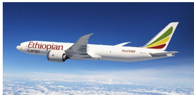
Ethiopian Airlines has signed an MOU with Boeing to purchase five 777-8 Freighters

Ethiopian Airlines has signed a memorandum of Understanding with Boeing, confirming its intent to purchase five of the industry's latest, fuel-efficient freighters, the Boeing 777-8. The order will enable the African airline to deal with increasing global cargo demand from its Addis Ababa hub and to facilitate future, long-term sustainable growth. The Boeing 777-8 was only launched in January of this year and has already received 34 firm orders. While the plane may carry virtually the same payload as the 777X family of jets, it operates at 30% better fuel efficiency, emissions and operating costs. At present, Ethiopian Airlines operates nine 777 Freighters, connecting Africa with more than 40 cargo centres throughout Asia, Europe, the Middle East and Americas. Additionally, the company's fleet includes three 737-800 Boeing Converted Freighters and a combined commercial fleet of more than 80 Boeing jets including 737s, 767s, 787s and 777s.