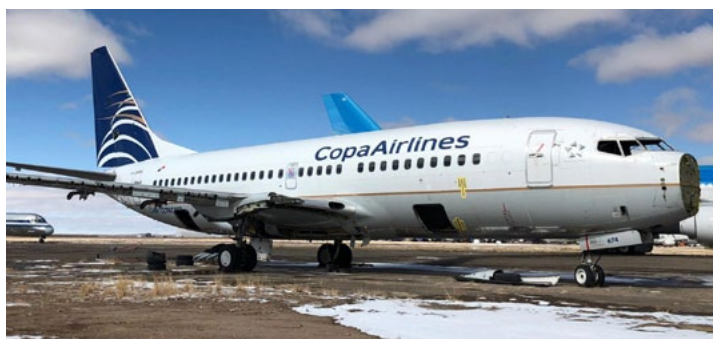
Photo: Aventure's second Copa Airlines Boeing 737NG at Roswell, New Mexico