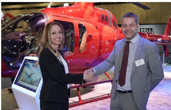
Safran and Bell to collaborate on sustainable aviation fuel initiative for Bell 505 helicopters

Safran Helicopter Engines and Bell Textron have announced a collaboration initiative to explore technical performance and economic impacts of sustainable aviation fuel (SAF) on the Arrius 2R-powered Bell 505 helicopter. A single, dedicated Bell 505 aircraft will conduct flights solely with the use of blended SAF. Both Bell and Safran Helicopter Engines will evaluate engine and aircraft performance data to better