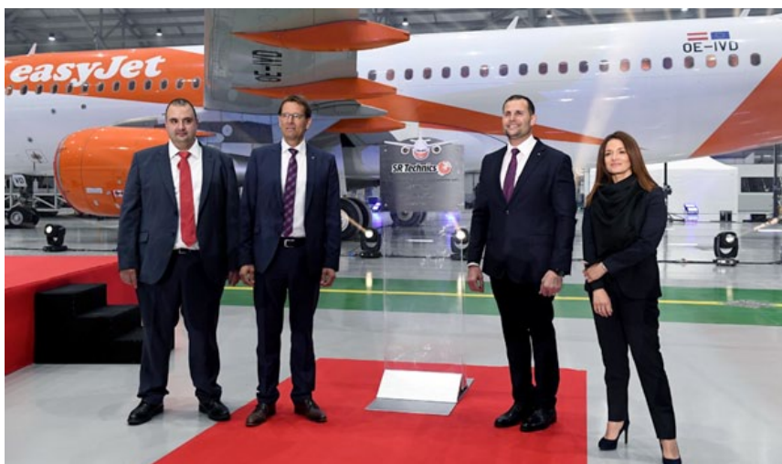
Official opening of SR Technic's new six-bay hangar in Malta

MRO service provider SR Technics has announced the opening of a new six-bay hangar including significant back-shop facilities for its Centre of Excellence (CoE) for aircraft maintenance in Malta. This project will enable SR Technics to continuously provide high-quality aircraft maintenance and cabin modification services, now for up to six narrow-body aircraft of the B737 and A320 families simultaneously. Besides offering new opportunities to customers located within the EMEA region in a very central hub for the aviation industry, SR Technics Malta will eventually employ around 500 highly trained professionals. The SR Technics Centre of Excellence for narrow-body aircraft maintenance in Malta has been offering efficient high-performance maintenance services since 2010 which are based on safety, quality and reliability. The attractive platform combines proven quality and technical excellence with advantageous commercial terms.