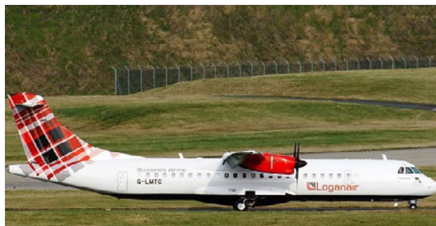
Loganair ATR 72-600 aircraft

Nordic Aviation Capital (NAC) has delivered one ATR 72-600 aircraft, MSN 1237, to Loganair on lease. The 72-seat ATR, which will be registered G-LMTD and named Clan Duncan in service with Loganair, will become the airline's tenth ATR and forms part of its continuing fleet renewal programme. Loganair is the one of the largest regional airlines in the UK, operating 43 aircraft on a network covering over 40 destinations in the UK and Europe. In addition to its scheduled services, the airline operates contract services for several large companies across the distribution and oil & gas sectors together with charters for a wide range of sports teams.