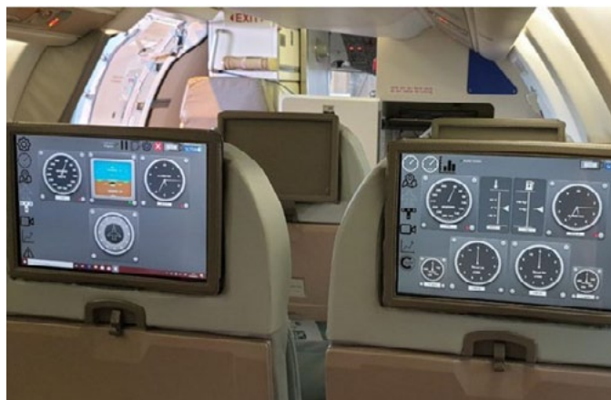
Interior of NFLC's Saab 340B aircraft

A project to facilitate the training of the next generation of aerospace engineers in the UK's only 'flying classroom' is fully operational thanks to the technical expertise of aircraft interior specialist, Starling Aerospace. Working in partnership with Cranfield University's National Flying Laboratory Centre (NFLC), Starling has completed a six-month programme of modification and re-certification of all 35 seats in the NFLC's Saab 340B aircraft, which is the latest educational asset to join the university's fleet. The project required a bespoke solution for the fitment of computer tablets and other equipment to each seat-back of the flying classroom. Starling was responsible for the complete design, fabrication, modification, re-certification and installation process, which provides aerospace engineering students from over 20 universities and Cranfield to gain invaluable flight test experience as part of their research studies. Operating from Cranfield's Global Research Airport in Bedfordshire, the Saab 340B is unique in the UK in its role to create new research capabilities, including projects which test the development of advanced aerospace technologies and flight operations.