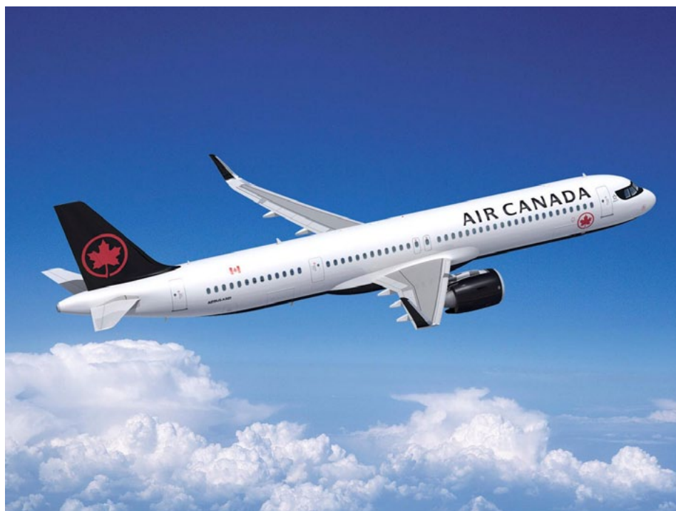
Air Canada will replace older and less fuel-efficient aircraft with the newly ordered A321XLR