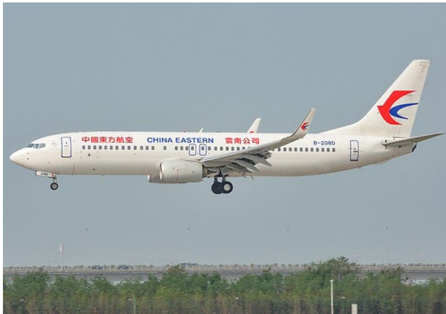
China Eastern Airlines Boeing 737-800