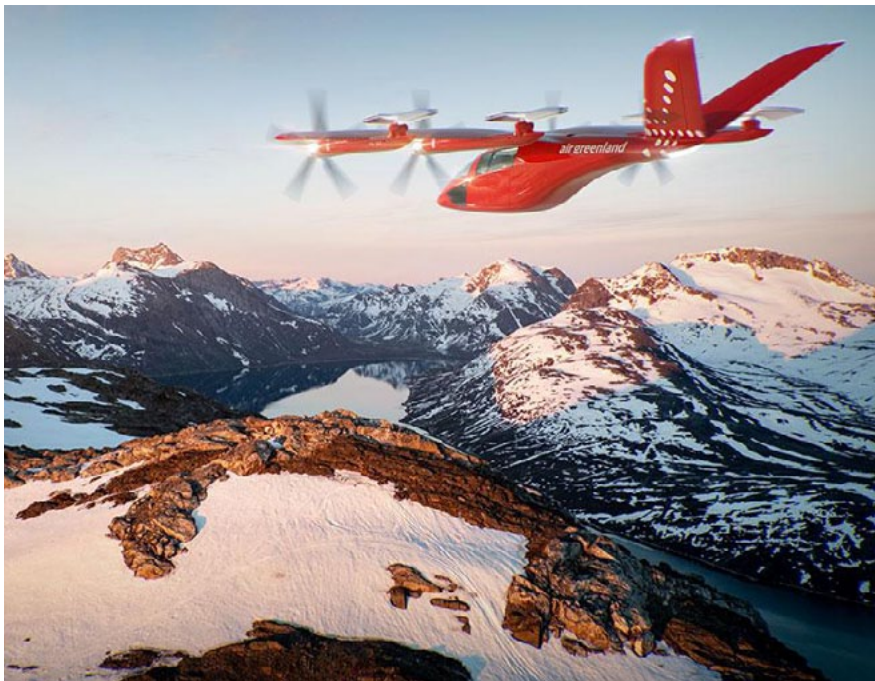
Air Greenland is the first European airline to join Avolon's eVTOL programme, starting its decarbonisation journey where it matters the most

Avolon, the international aircraft leasing company, has announced that it has partnered with Air Greenland, the flag-carrier for Greenland, to bring zero-emissions travel to the region and to help tackle the issue of climate change. Avolon and Air Greenland will partner to form a Working Group to assess the opportunity to commercialise zero-emissions air travel in the region. The Working Group will also collaborate to identify local infrastructure and certification requirements for eVTOL aircraft. As part of the agreement, Air Greenland will commit to purchasing or leasing a fleet of VX4 eVTOL aircraft, manufactured by Vertical Aerospace (Vertical), from Avolon. Upon its introduction, the VX4 will be the most advanced and the safest eVTOL in the market and will be built to EASA safety certification standards – the most stringent global requirements and at the same level as commercial aircraft. The VX4 will be near silent when in flight and will have zero operating emissions, transporting four passengers and one pilot distances of over 100 miles at up to 200 miles per hour. The size of Air Greenland's VX4 fleet will be defined at the conclusion of the Working Group's assessment of the scale of the market opportunity.