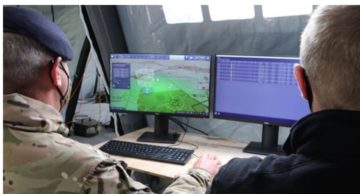
SkyKeeper Battlespace Management System demonstration