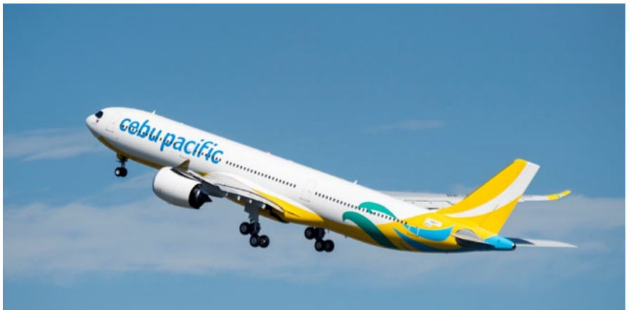
Cebu Pacific Airbus A330neo

bp is to supply DHL Express with sustainable aviation fuel (SAF) until 2026 as part of a new strategic collaboration with the global logistics company. The bp agreement is one of two deals comprising the largest sustainable aviation fuel (SAF) deals in aviation to date, with a combined volume of more than 800 million litres of SAF. The other supplier, entering in to separate agreement with DHL and making up the total volume, is Neste. In its Sustainability Roadmap, Deutsche Post DHL Group has committed to using 30% of SAF blending for all air transport by 2030. bp will provide SAF produced from waste oils. Such SAF from waste and residues can provide greenhouse gas emission reductions of up to 80% over its lifecycle compared with the conventional jet fuel it replaces, thereby reducing DHL's carbon footprint. DHL Express transports more than 480 million urgent documents and packages annually across its global network of 220 countries and territories.