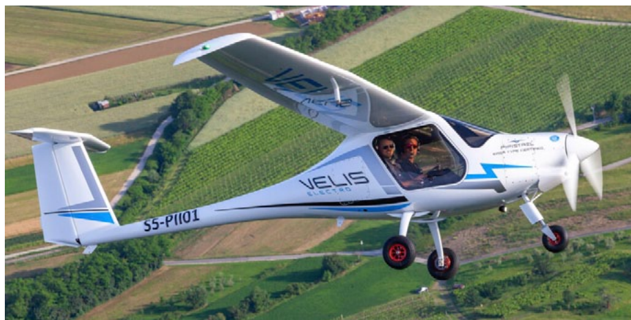
Photo: Pipistrel Velis Electro

Textron Inc. the multi-industry company behind brand names such as Bell, Cessna and Beechcraft, headquartered in Wichita, Kansas, has agreed to purchase Slovenia- and Italy-based Pipistrel, the manufacturer of small light aircraft and the Pipistrel Velis Electro, the world's first and currently only, electric aircraft to receive full type-certification from the European Union Aviation Safety Agency (EASA). The acquisition will provide Pipistrel with access to superior resources, together with a global network for sales and support, enabling it to accelerate its development and certification of electric and hybrid electric aircraft. With the acquisition, Textron will now create a new enterprise, Textron eAviation, devoted to the development of sustainable aircraft, including those by Pipistrel. Pipistrel was launched in 1989 and since then has sold over 2,500 light aircraft, while the company's history in the sustainable sector of the industry dates back to 2000, subsequent to which it has made several electric aircraft introductions, as well as having both hybrid and electric propulsion models under development. The sale of Pipistrel to Textron includes Pipistrel d.o.o., Pipistrel Vertical Solutions d.o.o and Pipistrel Italia S.r.l.