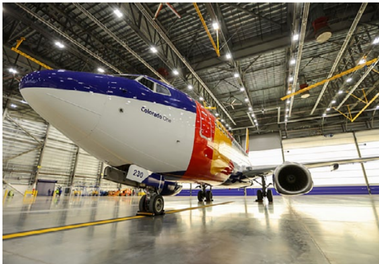
Colorado One parked inside Southwest Airlines' Technical Operations hangar in Denver, Colo.

Southwest Airlines has completed a major infrastructure investment to support its long-term vision for its Denver operation with the opening of a new Technical Operations complex at Denver International Airport (DEN). The nearly three-year, US$100 million, 130,000 ft 2 project includes a large aircraft maintenance hangar and room for offices, training and warehousing to support the carrier's Technical Operations team and represents Southwest's continued commitment to Denver by bringing more job opportunities to the community. The new hangar adds an important location within Southwest's network to support scheduled, overnight maintenance of its fleet of nearly 730 Boeing 737 aircraft. The facility includes a space inside the hangar for three Boeing 737s and room for eight additional 737s outdoors and serves as the new home for Southwest's more than 100 Denver-based Technical Operations employees. The Technical Operations team will begin moving into the facility in the coming weeks. The hangar joins six other Southwest Airlines aircraft maintenance hangars located throughout the country including Atlanta, Chicago (Midway), Dallas (Love Field), Houston (Hobby), Orlando, and Phoenix.