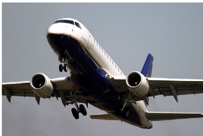
Liebherr has developed and produced the landing gear system for the Embraer E-Jet E1

Anticipating the sustained recovery of regional jets in China, Liebherr-Aerospace and HAECO have extended their initial landing gear service agreement to offer state-of-the-art landing gear MRO services to Chinese Embraer E-Jet E1 operators. While Chinese operators progressively resume to full-flight operations, Liebherr-Aerospace has optimised its landing gear maintenance offer through a service agreement in China with HAECO Landing Gear Services. This unique relationship combines Liebherr-Aerospace's OEM expertise as the design and production company responsible for the Embraer E-Jet E1 landing gear system with HAECO Landing Gear Services, an MRO partner with vast expertise on landing gear maintenance services and with a facility in Xiamen, ideally located halfway between Hong Kong and Shanghai. Facing a stable MRO demand in the region, the OEM support to local operators who need to improve their supply chain performance became critical after aircraft grounding due to the pandemic. However, thanks to the successful cooperation of Liebherr with HAECO Landing Gear Services, the development of OEM slot capacity in China remains a distinct advantage when servicing events need to be rescheduled, which will lead to cost-efficient and shorter turn-around time.