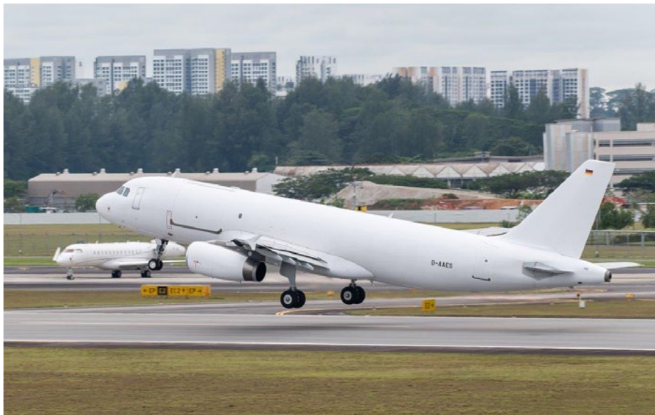
The prototype A320P2F taking off for one of its final test flights