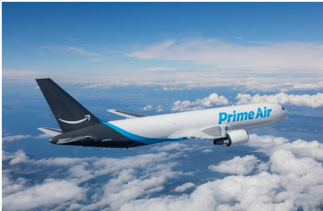
The CF6-80C2 engines powering the 767 has seen values go up.

IAG Cargo has announced it has restarted the London Heathrow to Sydney route for the first time since early 2020, as Australia re-opens its borders to vaccinated passengers all over the world. From 27 th March, IAG Cargo will be able to export and import vital goods on a daily rotation. The route will utilise a B787-9 aircraft with the capacity to transport up to 13 tonnes of cargo. The UK and Australian government signed a new UK-Australian trade deal in December 2021. It removes tariffs on UK exports and is designed to unlock billions of pounds worth of additional trade.