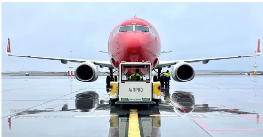
Photo: Norwegian will hire more than 150 air crew that will be based at Helsinki Airport

As part of the preparations for the summer season, Norwegian has started recruitment of more than 150 air crew that will be based at Helsinki Airport HEL . Approximately 100 cabin crew and 50 pilots will be ready to operate 27 of Europe's most popular destinations that the company will service from Helsinki Airport during the summer season. The newly hired crew start working on a rolling basis over the coming months – March, April and May – as they undergo the necessary training before they can welcome the passengers onboard as part of their active duty. The 150 will be the first air crew with Norwegian based in Helsinki since April 2020 when the pandemic hit the global aviation industry. Norwegian received almost 2000 applications for the open positions. Since June 2021 and the first lifting of travel restrictions, the rate of employment has been up at Norwegian, and the company has reopened bases in Copenhagen, Stockholm, Bergen, Stavanger and Trondheim.