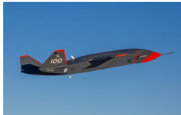
The newly named "MQ-28A Ghost Bat" during the second test flight series at Woomera Range Complex in South Australia