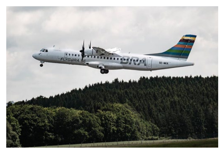
The world's first successful all SAF-fuelled flight of a commercial aircraft, an ATR 72-600 prototype

The results of a successful collaboration between regional aircraft manufacturer ATR, sustainable aviation fuel (SAF) supplier Neste, and the Swedish carrier Braathens Regional Airlines have culminated in the world's first successful all SAF-fuelled flight of a commercial aircraft, an ATR 72-600 prototype. It is estimated that SAF reduces greenhouse gas emissions by up to 80% during its life cycle. The ATR 72-600 twin turboprop is powered by Pratt & Whitney PWC 127F engines and according to ATR, the aircraft already emits 40% less CO2 per trip than equivalent regional jets operating on standard aviation fuel. The aircraft had performed successful ground and flight tests earlier in the year with one engine fuelled by SAF. It is hoped that the collaboration between the firms will see the certification process for 100% sustainable aviation fuel (SAF) completed by 2025. As a drop-in fuel, it can be used in existing aircraft engines and is compatible with current airport fuel infrastructure. Jonathan Wood, Neste's Vice President Europe, Renewable Aviation commented: "Test flights like this show it is possible to safely fly on 100% SAF and help accelerate the adoption of SAF in aviation." Per G Braathen, Chairman of Braathens Regional Airlines stated "As a leading Swedish domestic airline our sustainability focus