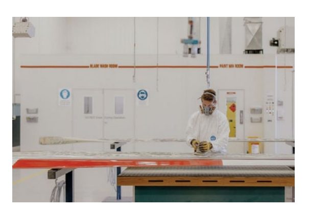
RBI Hawker has been awarded ISO 9001 and ISO 45001 certifications

RBI Hawker has been awarded ISO 9001 and ISO 45001 certifications for its quality management and occupational health and safety management systems, respectively. Since commencing operations in Australia in 2021, the company continues to build on its capabilities to better meet customer needs. ISO 9001 is the international standard that specifies requirements for a quality management system and is used to demonstrate the ability to consistently provide products and services that meet customer and regulatory requirements. This certification is complemented by ISO 45001 which is the world's first international standard dealing with health and safety at work. It gives guidance to enable organisations to provide safe and healthy work-places by preventing work-related injury and ill health, as well as by proactively improving its OH&S performance. RBI Hawker (Middle East) has been providing maintenance support to both commercial and military helicopter operators in the Middle East, Africa, Asia, Eastern Europe and wider regions since 2005. Both RBI Hawker locations are authorised Bell CSF and Leonardo service centres with an extensive OEM-approved standard and expanded repair portfolio.