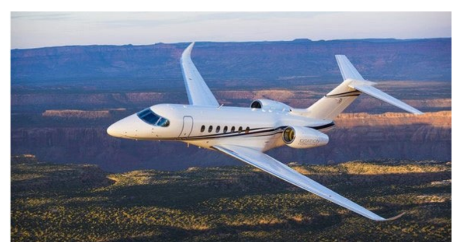
The Cessna Citation Longitude is powered by HTF7000 engines