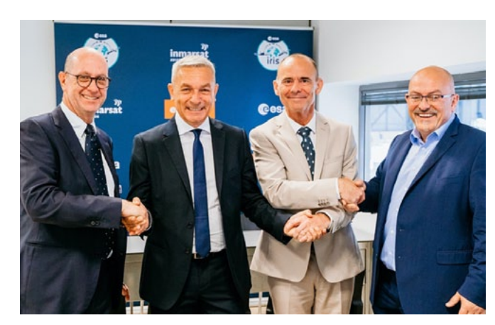
easyJet is the first airline partner for Iris, a ground-breaking air traffic management programme

Collins Aerospace is leveraging the synergies of its recent acquisition of FlightAware by announcing at the World ATM Congress the availability of new aircraft tracking and alerting features for its Uncrewed Aircraft System (UAS) digital platform, WebUASSM. By integrating FlightAware FirehoseSM, the most comprehensive global flight tracking and ADS-B flight status data feed, WebUAS is now able to provide Air Navigation Service Providers (ANSP) and UAS operators an even higherfidelity picture of active flight operations within airspace they are monitoring. Autonomous and remotely piloted flights are currently unable to commercially operate beyond visual line of sight (BVLOS) because of gaps in air traffic management (ATM) technologies and infrastructure systems. Collins is helping to bridge these gaps with the integration of aircraft telemetry data and primary radar feeds and the ability to stream real-time aircraft tracking data from 195