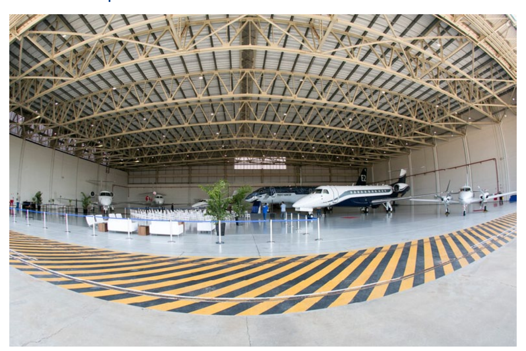
Official inauguration of Embraer's Sorocaba Service Center expansion

Embraer has inaugurated new hangars at the Sorocaba Service Center, in the São Paulo countryside, doubling its useful area from 20,000 m<sup>2</sup> to 40,000 m<sup>2</sup>. The unit, which completed eight years of operation in March 2022, now has four hangars, three of which are dedicated to maintenance, repair and component overhaul (MRO) services and one to support fixed-base operator (FBO) operations. "There is consistent growth in the executive aviation segment in Brazil and we see great opportunities for the service sector in the coming years, aligned with our growth plans for both the Services and Support business unit and Embraer itself," said Johann Bordais, President, and CEO of Embraer Services & Support. "This investment reaffirms Embraer's commitment to serving its customers more comprehensively and with even better support." Embraer