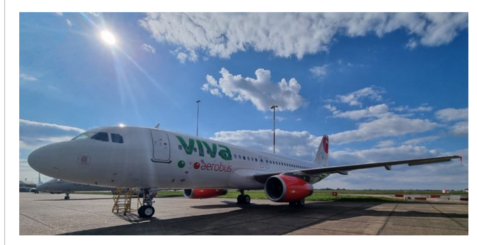
Photo: Goshawk completes delivery of the second A320 aircraft to Viva Aerobus

Dublin-based aircraft lessor Goshawk has announced the delivery of one Airbus A320 aircraft to Viva Aerobus. Viva Aerobus operates point-to-point services from Monterrey, Guadalajara and Mexico City to destinations across Mexico, the U.S.A. and Cuba. The aircraft was successfully delivered on June 15 and represents the second aircraft delivery by Goshawk to Viva Aerobus, following the first last November. This additional delivery highlights the ongoing successful relationship established between the two parties.