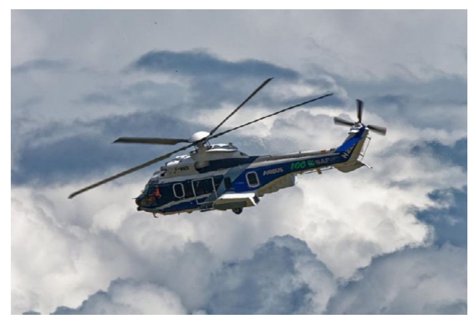
An Airbus H225 has performed the first ever helicopter flight with 100% sustainable aviation fuel (SAF)

An Airbus H225 has performed the first ever helicopter flight with 100% sustainable aviation fuel (SAF) powering both Safran's Makila 2 engines. This flight, which follows the flight of an H225 with one SAF-powered Makila 2 engine in November 2021, is part of the flight campaign aimed at understanding the impact of SAF use on the helicopter's systems. Tests are expected to continue on other types of helicopter with different fuel and engine architectures with a view to certify the use of 100% SAF by 2030. "This flight with SAF powering the twin engines of the H225 is an important milestone for the helicopter industry. It marks a new stage in our journey to certify the use of 100% SAF in our helicopters, a fact that would mean a reduction of up to 90% in CO2 emissions alone," said Stefan Thome, Executive Vice President, Engineering and Chief Technical Officer, Airbus Helicopters.