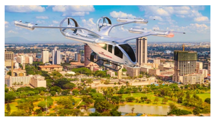
Fahari Aviation has signed a Letter of Intent (LoI) for up to 40 electric vertical take-off and

A subsidiary of Eve Holding (Eve) and Kenya Airways' subsidiary, Fahari Aviation, signed a Letter of Intent (LoI) in March for up to 40 electric vertical take-off and landing (eVTOL) vehicles. The agreement includes joint studies through a working group to develop and scale the UAM