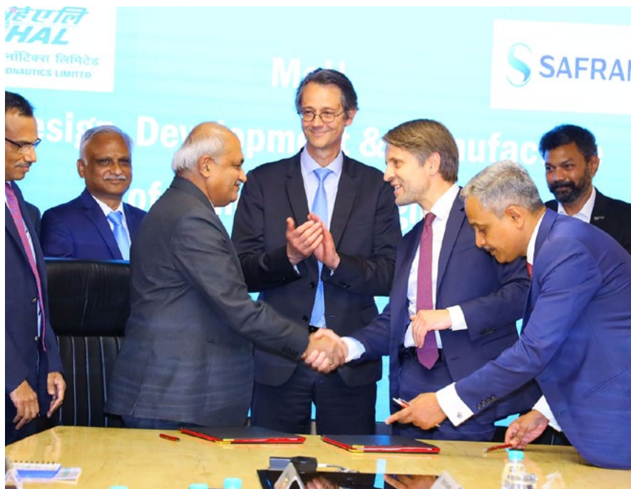
Signing of the MoU between Safran and HAL regarding a joint venture to develop new helicopter engines

Safran Helicopter Engines and Hindustan Aeronautics Limited (HAL) have signed an agreement to create a new joint venture intended to develop helicopter engines. Through a Memorandum of Understanding (MoU), signed by both companies, Safran and HAL will extend their long-lasting partnership by establishing a new aero-engine company in India. It will be dedicated to the development, production, sales and support of helicopter engines and one of its main objectives will be to meet the requirements of HAL and India’s Ministry of Defence (MoD) future helicopters, including the future 13-ton IMRH (Indian Multi Role Helicopter). This MoU demonstrates once again the commitment of both Safran Helicopter Engines and HAL to the Indian Government’s vision of “Atmanirbhar Bharat” or achieving self-reliance – particularly in defence technologies. Safran Helicopter Engines and HAL already have multiple partnerships, including the Shakti engine, which powers HAL-produced helicopters, including the Dhruv, Rudra and the Light Combat Helicopter (LCH). The Ardiden 1U variant also powers the new Light Utility Helicopter (LUH). More than 500 Shakti engines have already been produced through an HE-MRO joint venture in Goa, Safran Helicopter Engines and HAL will also provide MRO (Maintenance, Repair and Overhaul) services for TM333 and Shakti engines in service with Indian Armed Forces. It will be operational by the end of 2023.