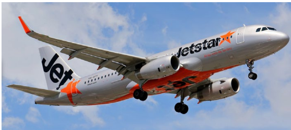
Jetstar Japan has taken delivery of one Airbus A320 aircraft