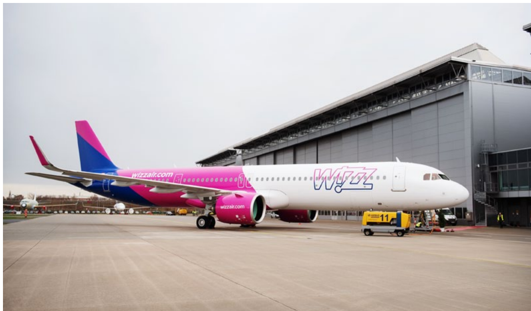
Wizz Air took delivery of an additional A321 Neo.

In its June results, Cathay Pacific reported that the airline resumed its full freighter schedule in June with increased flights to the Americas and Europe. This was complemented by the belly capacity provided by the increased passenger flights as well as more than 600 pairs of regional cargo-only passenger flights. In total, the airline operated about 56% of its pre-pandemic cargo flight capacity last month.