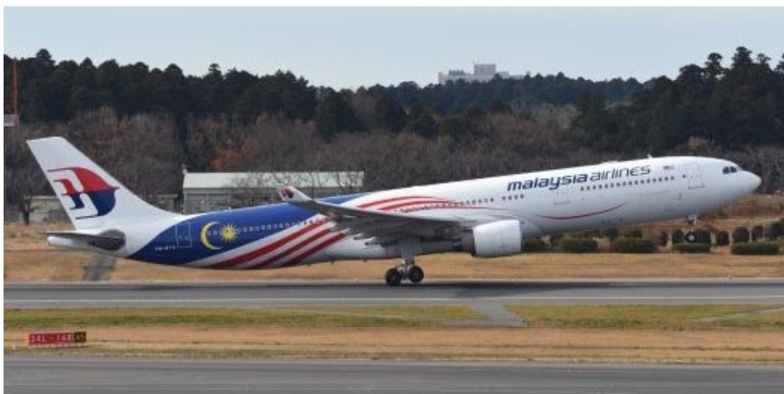
Malaysia Airlines will leverage SITA Connect, to meet the airline's needs in and outside airports