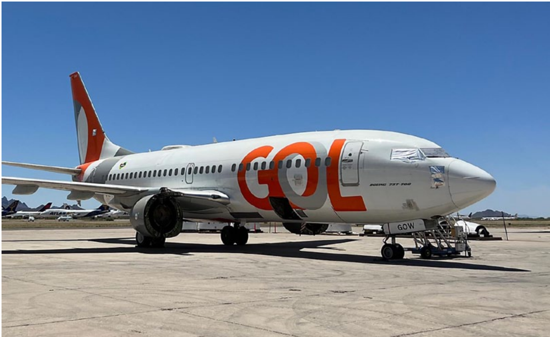
Photo: Aventure's recently retired GOL Airlines 737NG in Marana, Arizona, U.S.A.