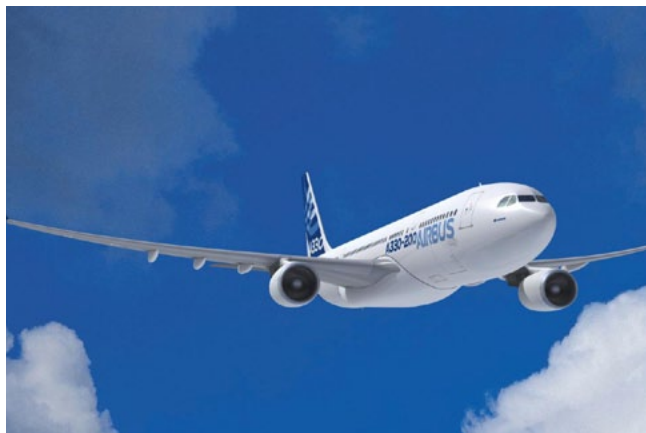
AFG Aviation Ireland has completed the acquisition of one Airbus A330-200 aircraft

On July 11, 2022, AFG Aviation Ireland Limited, a wholly owned subsidiary of Aircraft Finance Germany, completed the acquisition of one Airbus A330-200 aircraft bearing MSN 926, from a subsidiary of French shipping giant CMA CGM S.A. The aircraft will shortly be ferried to Teruel Airport (Spain) for storage while it awaits conversion with Elbe Flugzeugwerke