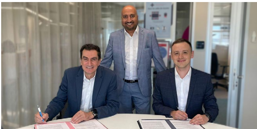
Photo: BAA Training and Air France agreement signing