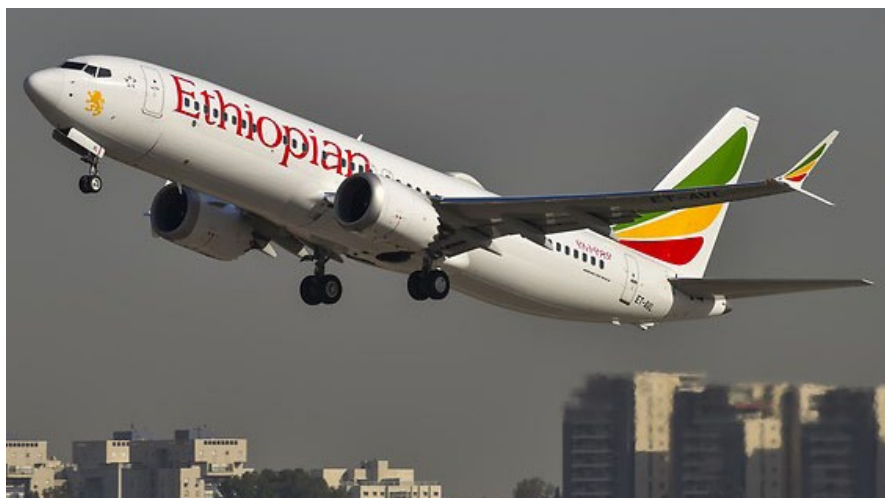
Ethiopian Airlines Boeing 737 MAX