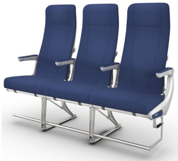
Photo: Recaro BL3710 economy-class seats