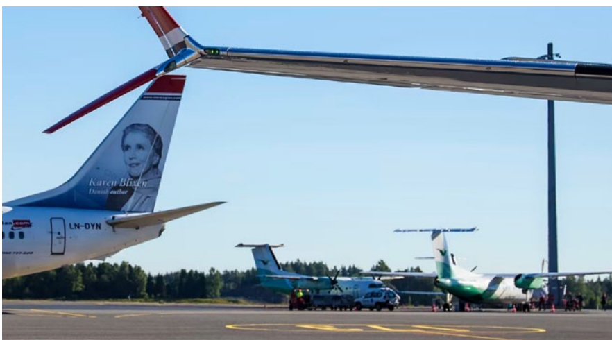
The two Norwegian airlines, Widerøe and Norwegian, have signed a cooperation agreement

Air Canada and Emirates have announced the signing of a strategic partnership agreement that will create more options for customers when travelling on the carriers' networks while also enhancing the customer experience throughout the journey. Air Canada and Emirates intend to establish a codeshare relationship later in 2022 that will offer enhanced consumer travel choices for Air Canada customers to travel to the United Arab Emirates and to destinations beyond Dubai. Emirates customers will also enjoy an enhanced travel experience when travelling to Toronto or to key destinations across the Air Canada network. Customers will have the ability to book connecting travel between both airlines' networks with the ease of a single ticket, seamless connectivity at the carriers' respective global hubs and baggage transfers to their final destinations.