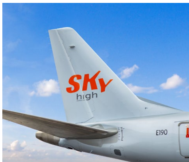
Photo: Embraer has signed a services agreement with Sky High Aviation

Embraer has signed a services agreement with Sky High Aviation Services Dominicana, S.A. (Sky High Aviation), from the Dominican Republic, to support the airline’s E190 jets newly acquired. The contract provides access to the Pool Program, which includes component exchanges and repair services for more than 340 reparable parts plus interchangeable parts for Sky High Aviation’s Embraer aircraft. “This service agree-