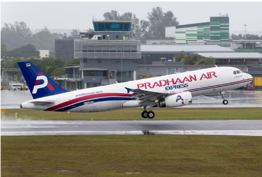
Photo: ST Engineering and EFW have delivered the first A320P2F to launch customer Vaayu Group