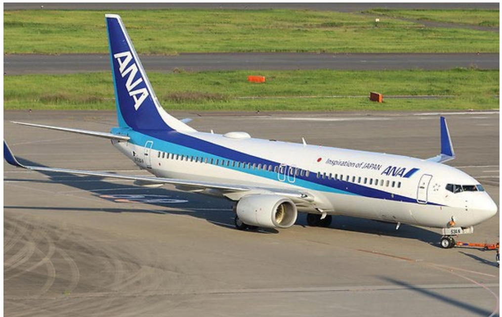
ANA has reached an agreement with Boeing for advanced passenger and cargo aircraft

ANA HOLDINGS (ANA HD) has reached an agreement with Boeing to convert two orders for the Boeing 777-9 aircraft to Boeing 777-8F cargo aircraft and finalised its existing purchase agreement for 30 Boeing 737-8 aircraft. The announcement reflects ANA HD's plan to further expand its cargo business through securing large freighters and to replace the domestic fleet's smaller planes with more fuel-efficient aircraft that will serve as the foundation for future growth. ANA HD decided to convert two of the 20 Boeing 777-9 aircraft that had been initially announced on March 27, 2014, with Boeing 777-8F cargo aircraft. The aircraft will be introduced into service on/after fiscal year 2028. The Boeing 777-8F is a state-of-the-art freighter that has the largest cargo capacity of any twin-engine aircraft and has reduced CO2 emissions and operational costs that uses less fuel per tonne. The ANA Group finalised its agreement for the purchase of Boeing 737-8 aircraft (20 confirmed and 10 optional), which was previously announced on January 29, 2019. The introduction of the aircraft is scheduled to begin in fiscal year 2025.