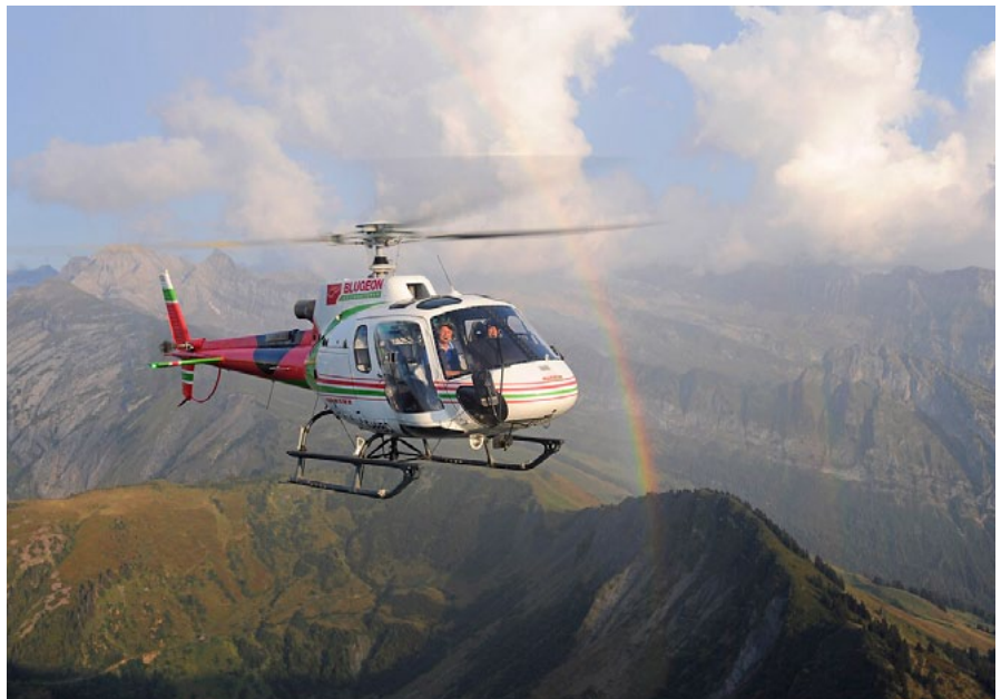
Photo: Airbus Helicopters' 7,000th Ecureuil helicopter was delivered to Blugeon

Airbus Helicopters has delivered its 7,000 th helicopter from the Ecureuil family. The light single-engine H125, which was assembled in Marignane, France, was handed over to Blugeon Hélicoptères, a French company specialised in sling work at high altitudes. This new H125 will join Blugeon's existing fleet of five H125 helicopters located at three different bases in the French Alps and a fourth one in the Pyrenees. Each of them flies an average of 600 hours per year performing passenger transport, power line surveillance, filmmaking, preventive avalanche maintenance, mountain rescue and large-scale hoisting. "Since the first Ecureuil took to the skies in 1974, this family of aircraft forever changed the light helicopter market and the way aerial work is performed," said Axel Aloccio, Head of the Light Helicopters programme at Airbus Helicopters. "Designed to be a simple, practical and competitive aircraft, the secret of its success lies in its excellent performance and its incredible ability to adapt to operators' needs. It is precisely thanks to the confidence of operators like Blugeon that we are celebrating the milestone of the 7,000 th delivery today."