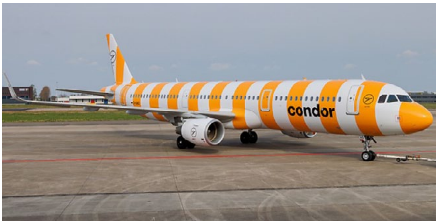
Condor will lease 19 new Airbus aircraft from ALC