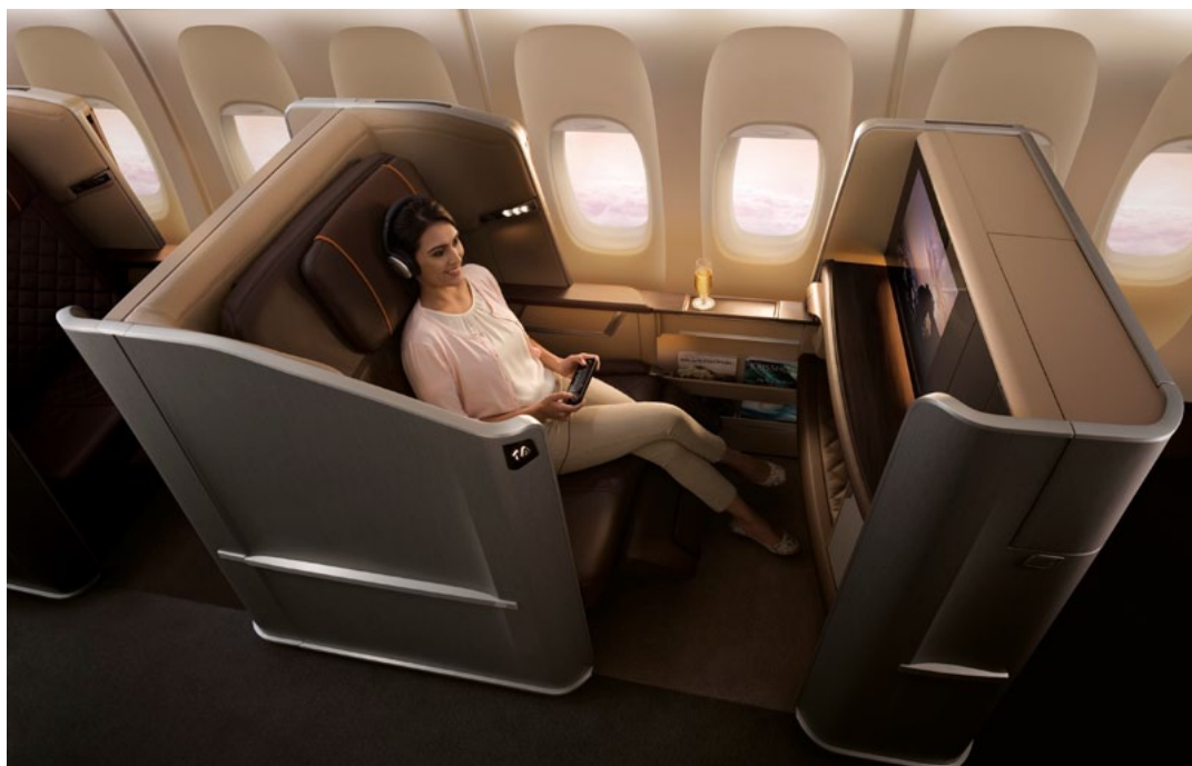
IFC service providers continued to equip aircraft.