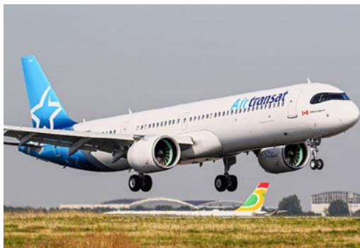
AJW Group has signed a new PBH support contract with Canadian airline, Air Transat

Vancouver. AJW Group has supported Air Transat with PBH service contracts for nearly ten years, originally for its Airbus A330 fleet.