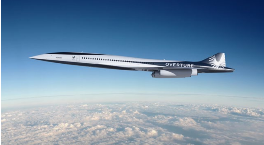
The Overture jet is expected to roll out in 2025 and fly its first passengers by 2029