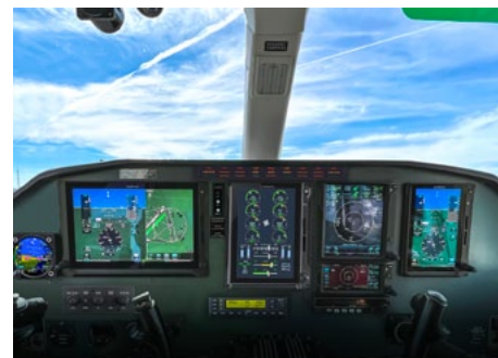
Photo: Britten-Norman BN2T Islander with Garmin TXi EIS instrumentation

UK aircraft manufacturer, Britten-Norman, is working with avionics technology company Garmin to develop the TXi Engine Indication System (EIS) for its Islander turboprops. The development and distribution agreement signed between the parties is for creating a CAA-approved supplemental type certificate applicable to both new and retrofit turboprop aircraft that will complement the existing STC for the piston variants. The TXi EIS includes many innovative safety features such as engine timers, exceedance recordings, dynamic engine indications and wireless data logging to reduce pilot workload, improve engine efficiency and reduce maintenance costs. The first installation will be this August, with a worldwide rollout following within six months.