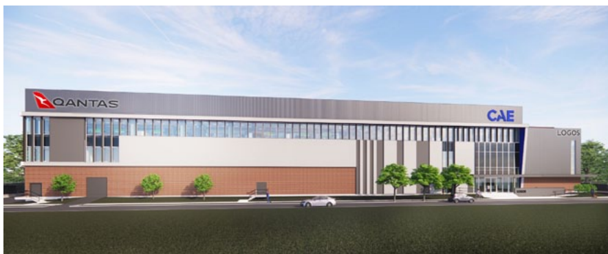
Artist's impression of Qantas' new flight training centre

Delta Air Lines (Delta) will resume flights from Los Angeles International Airport (LAX) to Tokyo International Airport (HND) beginning October 30, in anticipation of Japan's easing of travel restrictions. The route will start operating three-times weekly before moving to daily starting December 1. The restart of service will use an Airbus 330-900neo aircraft featuring Delta One Suites, Delta Premium Select, Delta Comfort+ and Main Cabin services. Delta will also start a new daily service between Honolulu and Haneda on December 1. This is the first time Delta has offered service from Haneda to Honolulu with its start delayed due to the pandemic. Customers will be able to enjoy Delta One, Delta Premium Select, Delta Comfort + and Main Cabin services using the Boeing 767-300ER aircraft. Haneda is a key hub for Delta and offers multiple travel options from key U.S. gateways including Seattle, Atlanta and Detroit.