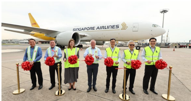
DHL Express and Singapore Airlines are celebrating their new partnership with the arrival of the new Boeing 777 freighter

DHL Express has welcomed the arrival of its new Boeing 777 freighter at Singapore Changi Airport. The freighter, which sports a dual DHL-Singapore Airlines (SIA) livery, has a maximum capacity of 102 tonnes. SIA will operate it on routes to the United States of America via South Korea thrice weekly from August 2022. In March 2022, DHL Express and SIA signed a crew and maintenance agreement to deploy five Boeing 777 freighters. These freighters will be operated by SIA pilots, with the maintenance overseen by SIA. The second Boeing 777 freighter is slated to enter into service in November 2022, with both freighters to operate the Singapore-Incheon-Los Angeles-Honolulu-Singapore route six-times weekly. The remaining three freighters are planned for delivery throughout 2023. Following this, all five freighters will operate on routes between the United States and Singapore via points in North Asia and Australia.