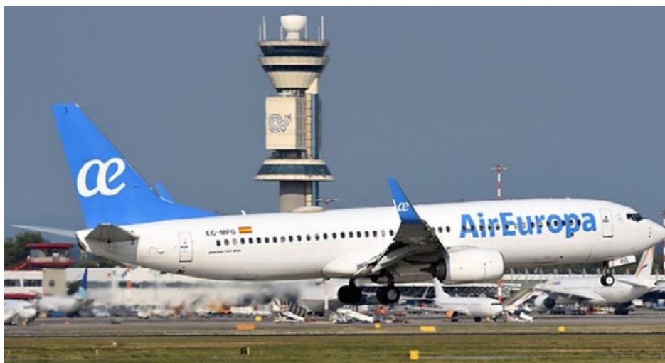
Air Europa has taken delivery of two Boeing 737-800 aircraft from Stratos