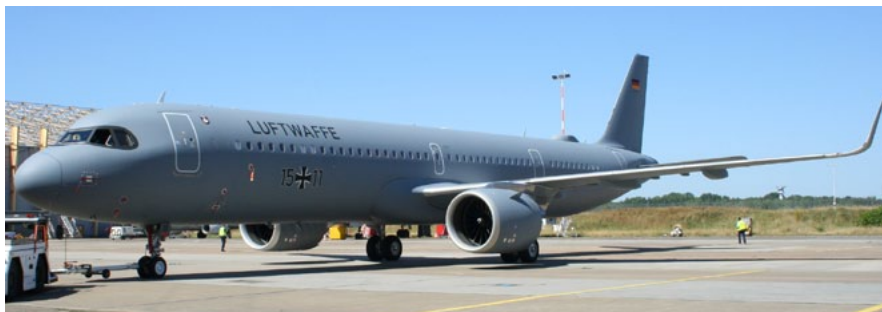
Handover of the second Airbus A321LR to the German Air Force