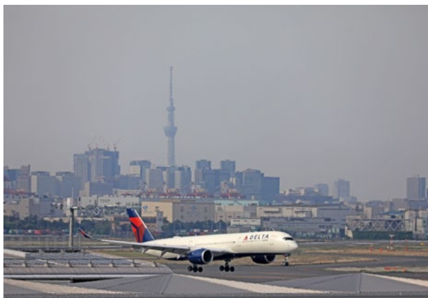
Photo: Delta will resume flights from LAX to Haneda starting December 1.

Delta Air Lines (Delta) will resume flights from Los Angeles International Airport (LAX) to Tokyo International Airport (HND) beginning October 30, in anticipation of Japan's easing of travel restrictions. The route will start operating three-times weekly before moving to daily starting December 1. The restart of service will use an Airbus 330-900neo aircraft featuring Delta One Suites, Delta Premium Select, Delta Comfort+ and Main Cabin services. Delta will also start a new daily service between Honolulu and Haneda on December 1. This is the first time Delta has offered service from Haneda to Honolulu with its start delayed due to the pandemic. Customers will be able to enjoy Delta One, Delta Premium Select, Delta Comfort + and Main Cabin services using the Boeing 767-300ER aircraft. Haneda is a key hub for Delta and offers multiple travel options from key U.S. gateways including Seattle, Atlanta and Detroit.