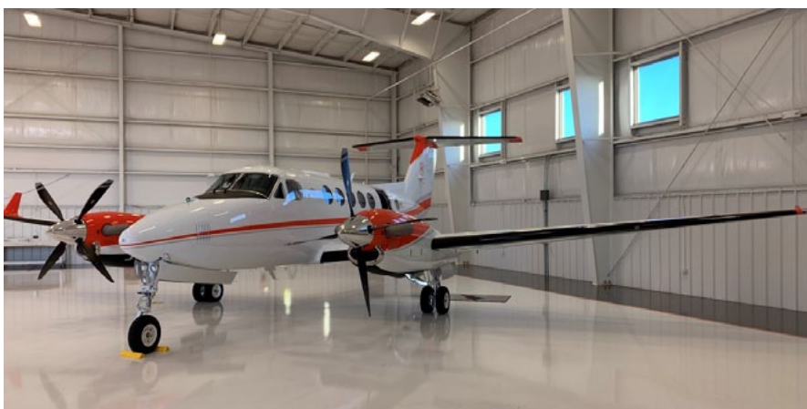
Beechcraft King Air 260 for the U.S. Forest Service wildfire mapping mission