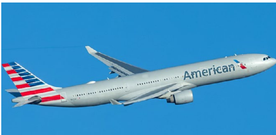
American Airlines Airbus A330-300