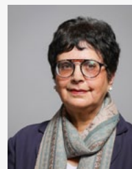
Baroness Usha Prashar

• Hans Airways , the new long-haul hybrid airline readying to start scheduled flights between Birmingham, UK and Amritsar, India, has confirmed the appointment of Baroness Usha Prashar , CBE to its Executive Board. Since 1970, Baroness Prashar has served as director, or chair, of a variety of public and private sector organisations, including NED appointments with Channel Four, ITV Television, UNITE Group Plc and Nationwide Building Society. She has