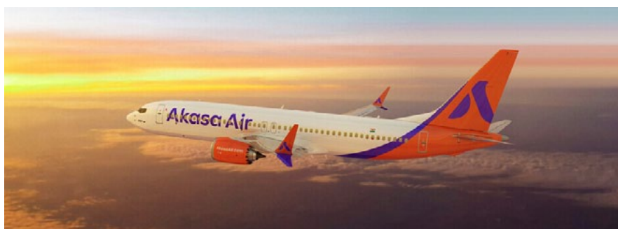
New start-up airline Akasa Air goes live with AMOS