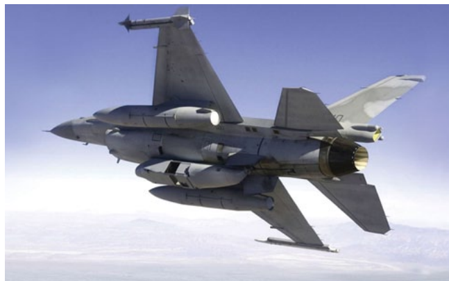
F-16 jet with MS-110

Collins Aerospace has successfully completed the first flight test of its newest fast-jet reconnaissance pod, the MS-110 multi-spectral airborne reconnaissance system, on an F-16 for an undisclosed international customer. The test flight demonstrated aircraft integration, flightworthiness, and full-system performance within the