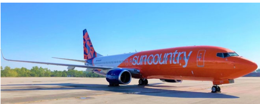
Photo: Boeing 737-800 in Sun Country Airlines livery