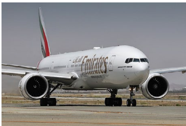
Emirates will retrofit a combined 120 Airbus A380 and Boeing 777 aircraft