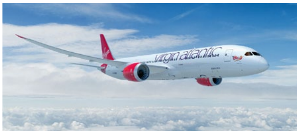
Bii.aero will oversee the consignment of Virgin Atlantic's surplus inventory

Virgin Atlantic has appointed Bii.aero, a leading provider of aircraft parts and services for the commercial aviation sector, to oversee the consignment and storage process of its large surplus inventory of B747-400, A340-600 and A330-200 assets now that the airline no longer operates these fleets of aircraft. The top-quality material covers all ATA chapters and includes engines, APUs and avionics. Virgin Atlantic is the latest airline to consign its inventory to Bii as the company augments its portfolio of new and used serviceable material to meet global demand. Following the competitive tender process Bii was chosen based on the organisation's highly experienced team and its reputation for specialist consignment management. In a mutually beneficial agreement, Bii will store, manage, and market the material to secure revenue from the excess stock. The material is desirable, already certified and ready-to-go. Bii will sell, exchange