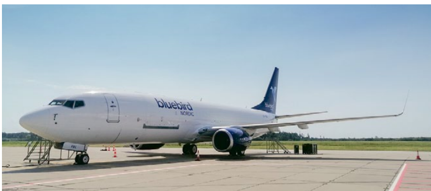
Photo: AviaAM Leasing has delivered a 737-800 BCF to Bluebird Nordic

AviaAM Leasing, a global aviation holding company engaged in tailored aircraft leasing and trading services, has announced its third delivery of a 737-800 Boeing converted freighter. The aircraft has joined the fleet of Bluebird Nordic, a rapidly growing Iceland-based cargo airline, offering ACMI and full-service cargo services. The continued cooperation between both companies – which are a part of Avia Solutions Group, a global end-to-end capacity provider – is assisting the lessee in continuously reaching step-by-step fleet expansion goals. The 737-800 passenger-to-freighter (P2F) conversion work was provided by Boeing at Taikoo (Shandong) Aircraft Engineering Company (STAECO) in Jinan (TNA), China.