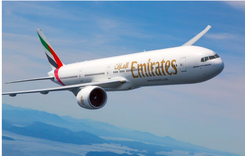
Emirates plans to suspend Nigerian flights this week.

The Qantas Group has posted its third consecutive Statutory Loss Before Tax of more than $1 billion, reflecting the Delta and Omicron impacts as well as upfront costs from restarting the airline as lockdowns finally ended. For the full 2022 financial year, the Group experienced an Underlying Loss Before Tax of $(1.86) billion and a Statutory Loss Before Tax of $(1.19) billion.