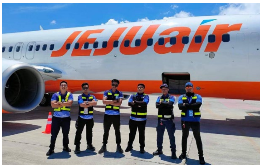
Photo: Staff of MRO Dornier Technology Philippines in front of an aircraft from Jeju Air