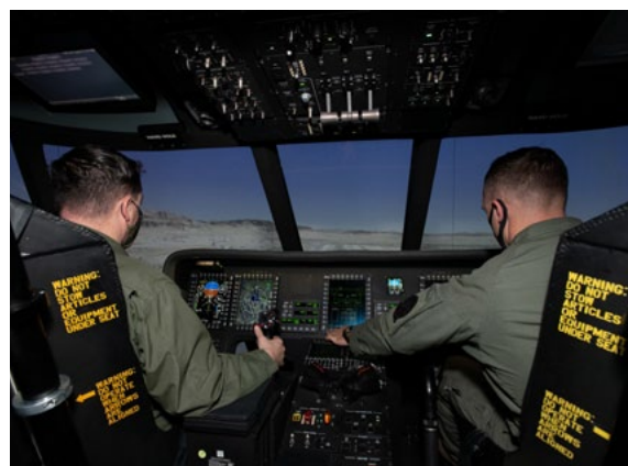
Photo: Lockheed Martin containerized flight training device CH-53K

The United States Marines will gain additional training opportunities preparing them to operate the Sikorsky CH-53K heavy lift helicopter. The aircraft is the most modern and powerful helicopter in the Department of Defence inventory capable of moving troops and equipment from ship to shore, and to higher altitude terrain, more quickly and effectively than ever before. Lockheed Martin will provide an additional containerised flight training device (CFTD) to the U.S. Navy with options for three more under