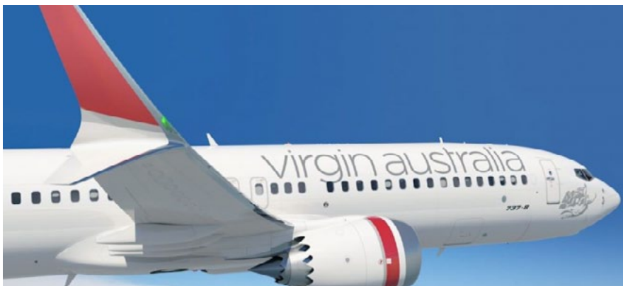
Photo: Virgin Australia will add four Boeing 737 MAX 8 aircraft to its fleet

Virgin Australia Group has announced the addition of four Boeing 737 MAX 8 aircraft and priority access to a Boeing 737NG full-flight simulator that will be deployed in Jandakot, near Perth, as part of a long-term partnership with global aviation training provider CAE. The Boeing 737 MAX 8 aircraft, which are in addition to another four MAX 8 aircraft announced in April 2022, will reduce emissions by 15% per flight and play an important part in Virgin Australia’s net-zero journey. These additional aircraft support capacity increases in line with Virgin Australia’s broader growth strategy, bringing the total Boeing 737 fleet to 92 (consisting of 737-700s, 737-800s and Boeing MAX 8s) an increase of nearly 60% since relaunching in November 2020. First delivery of the additional Boeing 737 MAX 8 aircraft is expected in 2023.