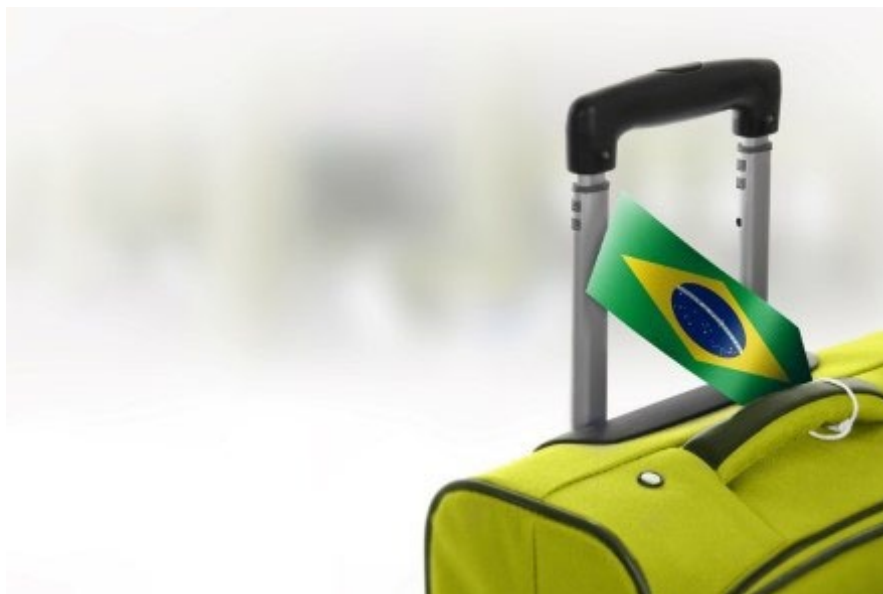
SITA technology helps two Brazilian airports cope with the surge in travel