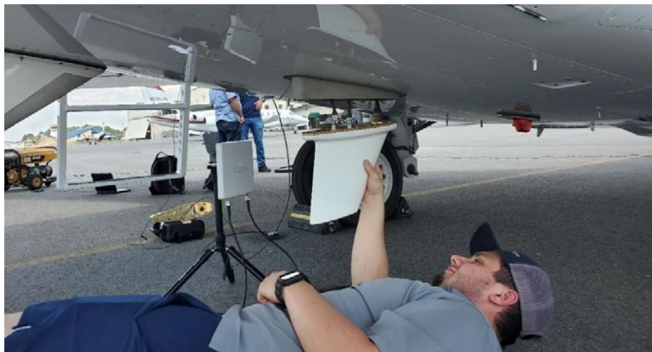
Photo: SmartSky installation on a flyExclusive Citation X jet

SmartSky Networks, a leading provider of inflight ATG connectivity for business aviation, has announced the completion of an STC for the installation of SmartSky hardware on the Cessna Citation X series business jets. With more than 300 aircraft in operation, the Citation X series joins a growing list of aircraft types that have already been granted STCs for SmartSky's patented air-to-ground connectivity service. FlyExclusive, the fourth-largest private jet fleet operator globally, performed the installation at its Kinston, NC facilities. With the hardware installed, the Citation X aircraft made its inaugural flights using SmartSky's enhanced air-to-ground (ATG) network in June and the FAA supplemental type certification was issued on August 12, 2022. The Citation X certification comes hot on the heels of SmartSky's announcement in July that its ATG connectivity is now available nationwide for aircraft flying on routes across the continental United States. SmartSky has previously been awarded STCs for many of the world's most popular business aircraft, including aircraft from major manufacturers such as Textron Aviation, Gulfstream Aerospace, Bombardier and Embraer. Additional STCs are in progress that will make the service available for those in business aviation who need reliable, consistent, and responsive inflight connectivity.