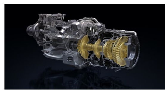
PW127XT Regional Turboprop Engine