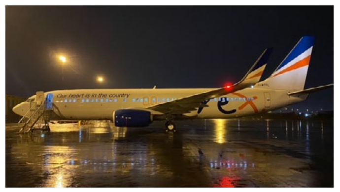
Boeing 737

Rex has taken delivery of another Boeing 737-800NG, further bolstering the airline's jet fleet deployed on its domestic network. The aircraft, registered VH-MFM, arrived in Brisbane from Montpellier in France, adorned in the distinctive Rex livery. Prior to being painted, the aircraft underwent a scheduled heavy maintenance check at an engineering facility at Montpellier, France. It is the seventh Boeing 737-800NG to be added to Rex's Air Operator's Certificate (AOC) and will enter service in early September. This will enable Rex to add additional capacity on the 'Golden Triangle' between Sydney, Brisbane and Melbourne. "Our seventh aircraft allows us to meet the ever-increasing demand for Rex's services given the shocking reliability on both Qantas and Virgin Australia," Deputy Chairman, the Hon John Sharp AM, said. "Demand for Rex flights is so great that we are urgently looking for another two Boeing 737-800NGs which we hope to deploy by Q2 – Q3 of this financial year."