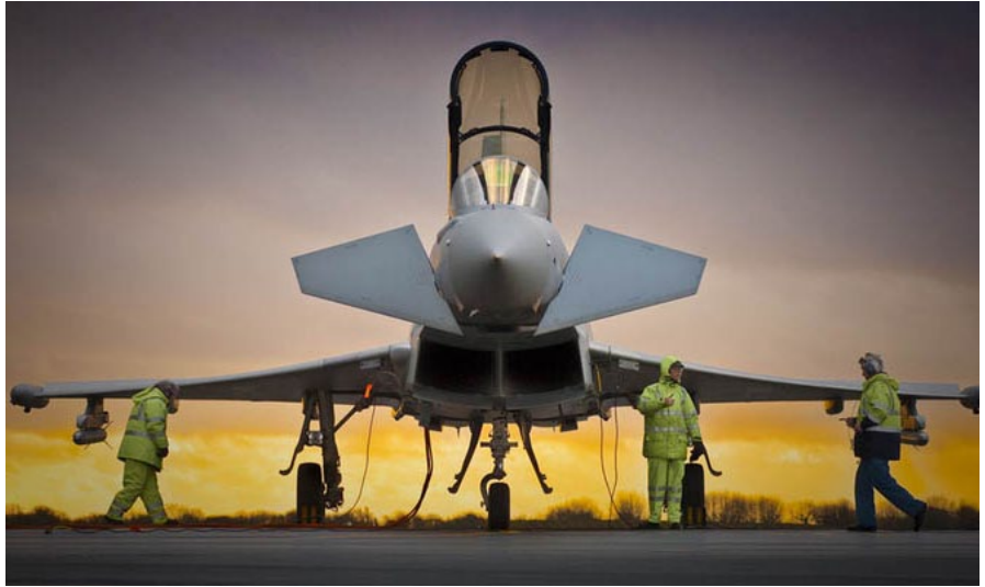
Typhoon on the flight line