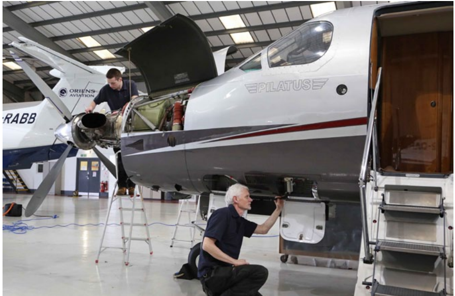
Oriens Aviation acquires Avalon Aero at Biggin Hill