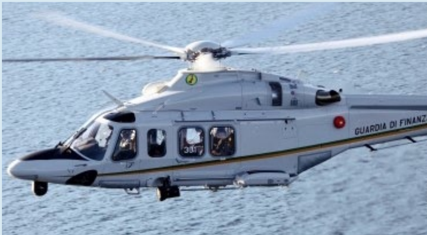
Italy has ordered eight more AW139s for rescue and border patrol services