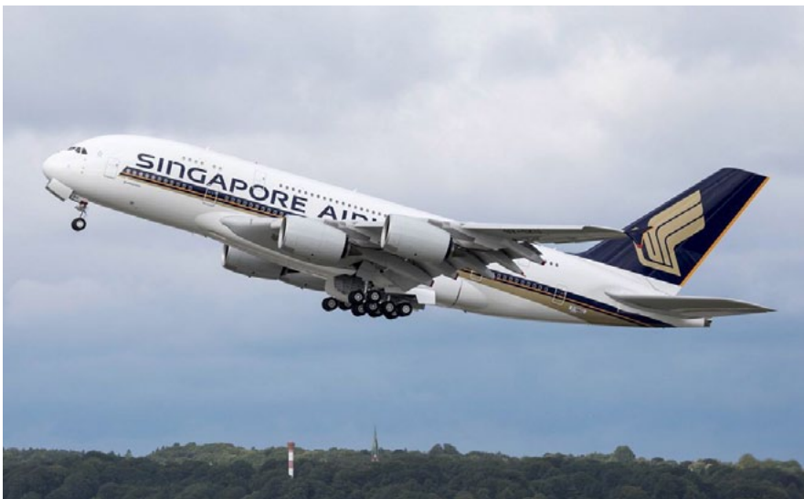
The first of five new A380 aircraft for SIA, takes to the skies