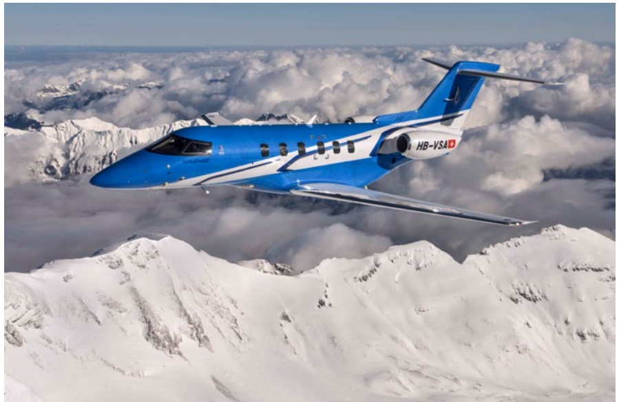
The PC-24 business jet from Pilatus received EASA and FAA type certificates