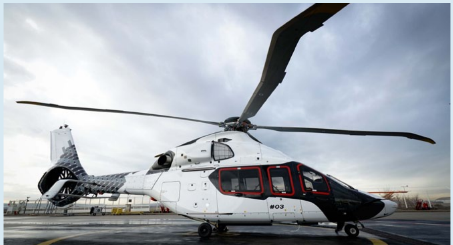
H160 prototype Carbon Livery